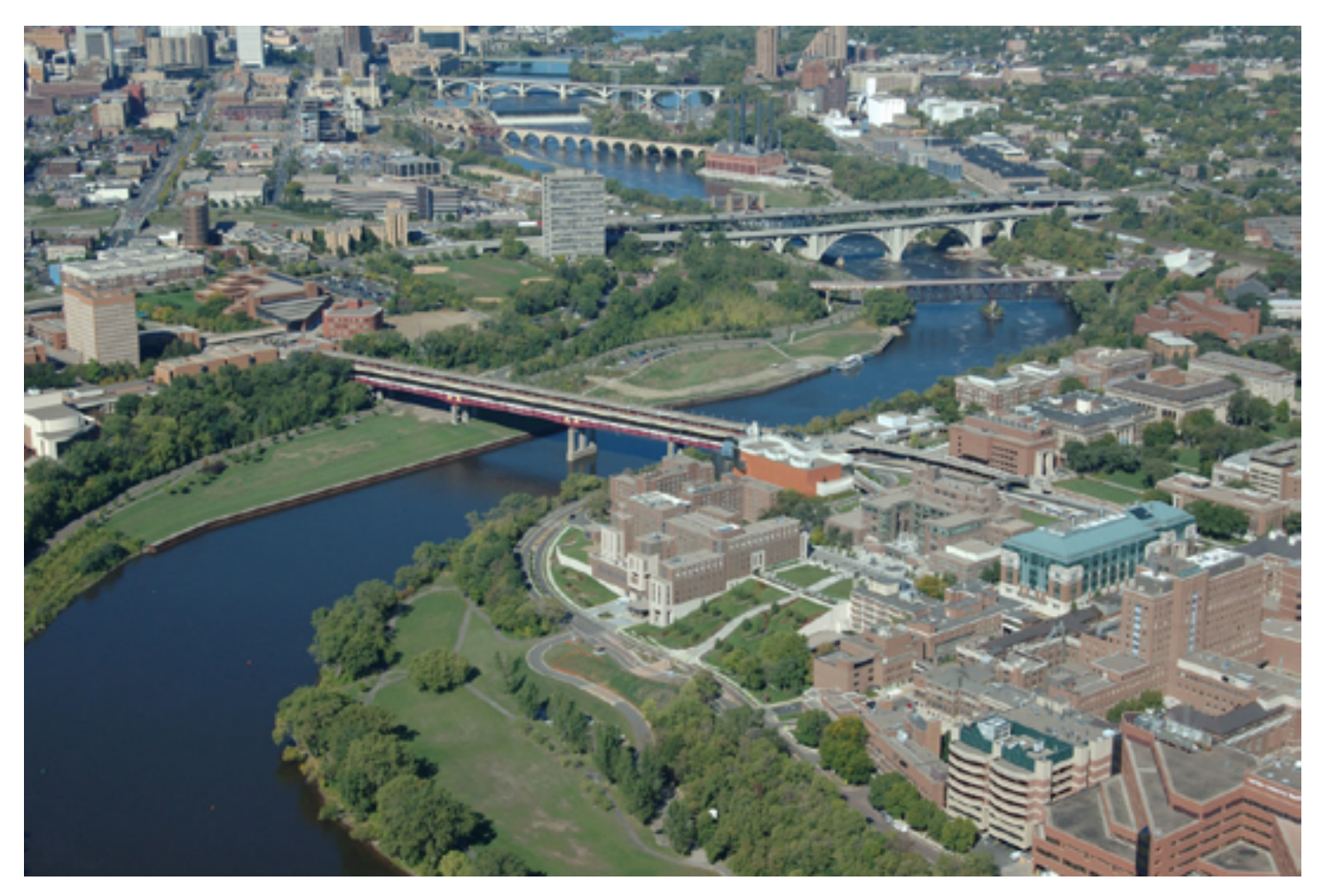
University of Minnesota on the Mississippi River looking towards St. Anthony Falls.

Obviously, we think so. Over the past decade or so, we have noticed as many "gaps" in the conversations about the Mississippi as there are fruitful connections. We want to address these gaps by connecting engineers with historians, engaging artists with policy folks, and making a space for community people and scholars to learn from and with each other. Few, if any at all, people are speaking with Native Americans, those people