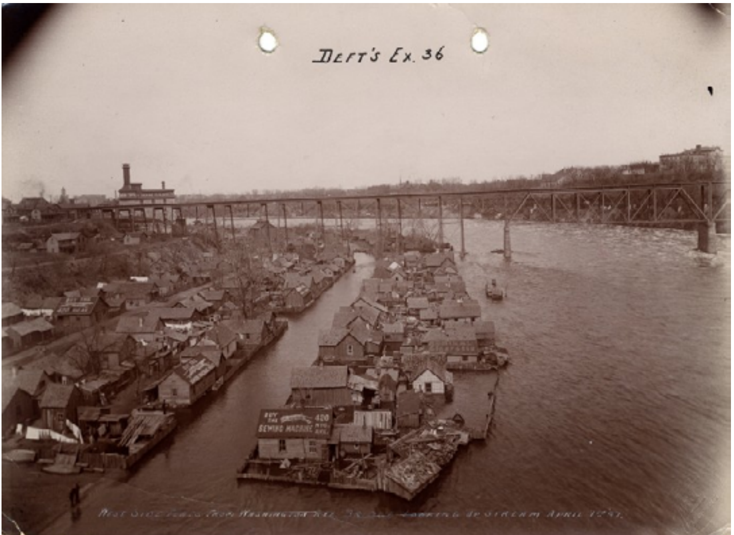
Spring Flooding at the Bohemian Flats in 1897.

river flats. While few probably notice this nondescript, grassy strip of land, fewer still are aware of its history. This park was once home to the Bohemian Flats, an Eastern European immigrant community occupied from the 1870s until the