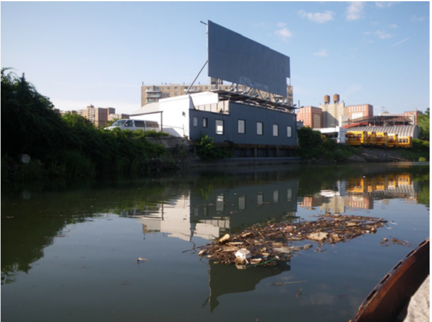
Fig. 15. "this is where I always wanted to be!" she said," from Photography with Susannah Ray and Catherine Despont, 7/3/2015.

As I have already suggested, the art historical landscape conventions that took shape in the United States in the early part of the nineteenth century celebrate hard-to-reach places as Eden-like. Yet scholarship reminds us that those pristine landscapes were themselves fictional (Myers 1995, Harris and Pickman 1996). For example, the iconic works of the Hudson River School painters portray the Hudson River as wild, but these paintings were made after the