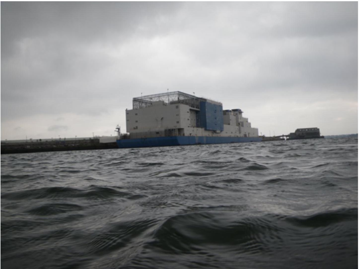
Fig. 2. “Also, the whole thing seemed to be listing, ever so slightly, to the starboard side,” from Freedom/Captivity with Lisa Sigal, 9/5/2013.

and Captivity . The journal consists of 62 photographs of the trip, each accompanied by text written by Lorenz. The text that Lorenz writes and pairs with each photo journal is not a series of captions, but a narrative that works in tandem with the images. These texts share snippets of conversation, ideas, details about the water or wind that affect the trip and that may not be visible in the photographs, and other information that adds to the narrative. In addition, the text helps to set the pace and the tone of each trip, often conveying a sense that as the boat drifts, so do conversations, thoughts, and perceptions.