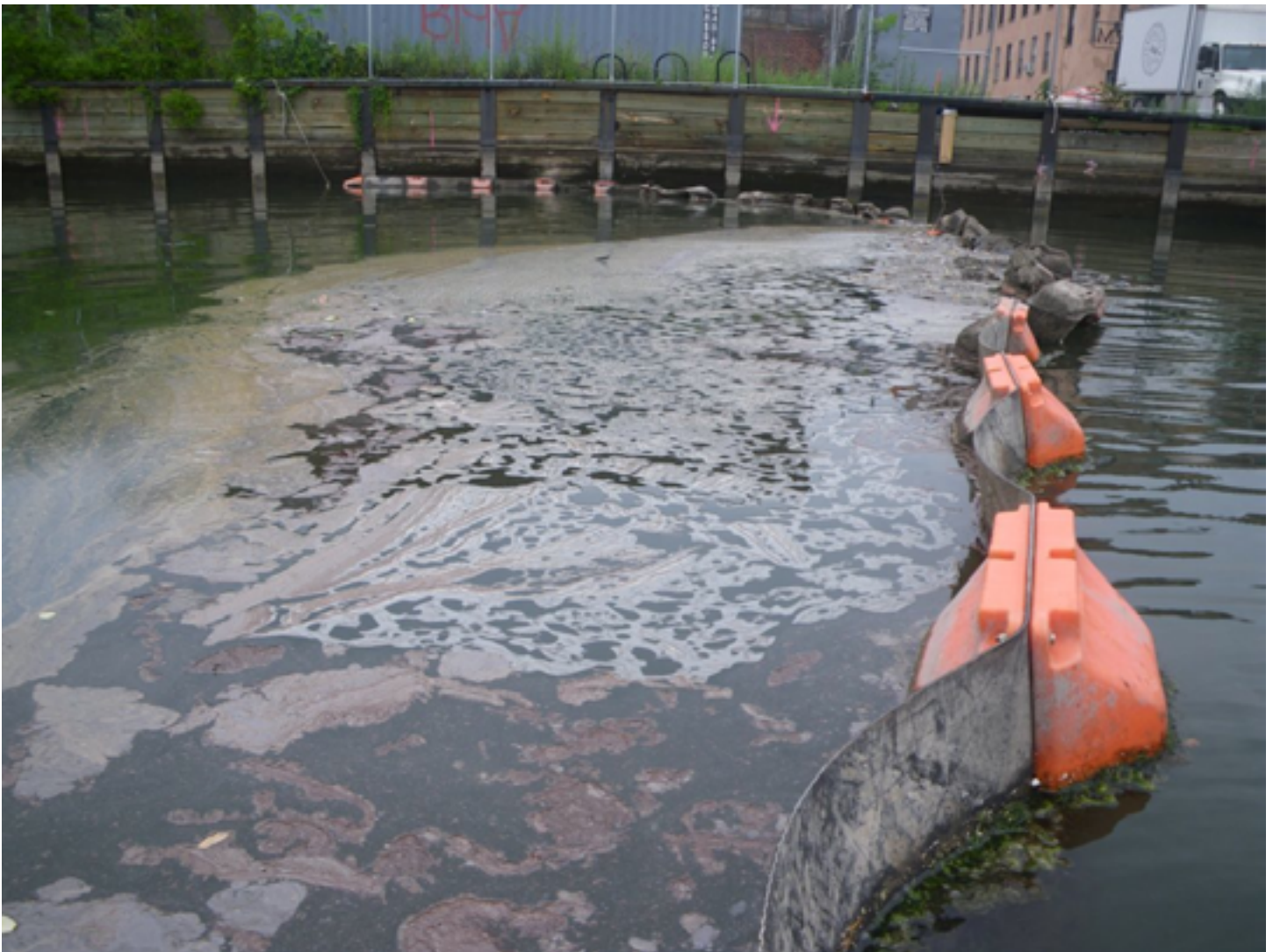
Fig. 12. “The boom has done a good job of catching some coal tar churned up by the new flushing tunnel,” from Evolution with Eben Kirksey and Latasha Wright , 7/4/2015.

dizzying at times. Lorenz and her passengers encounter an urban landscape that is both beautiful and revolting. Biologist Latasha Wright and anthropologist/ecologist Eben Kirksey, for example, are described as “equal parts fascinated, grossed out” on a trip on the Gowanus, and Lorenz offers many photographs showing us how deeply revolting the canal can be (Fig 12). While exploring a hundred-year-old landfill in Jamaica Bay recently torn open by Hurricane Sandy, Lorenz took pictures of the trash that are visually striking, but she also recalls through her text that, “As we picked through the debris with sticks, I fought back a wave of revulsion. There was