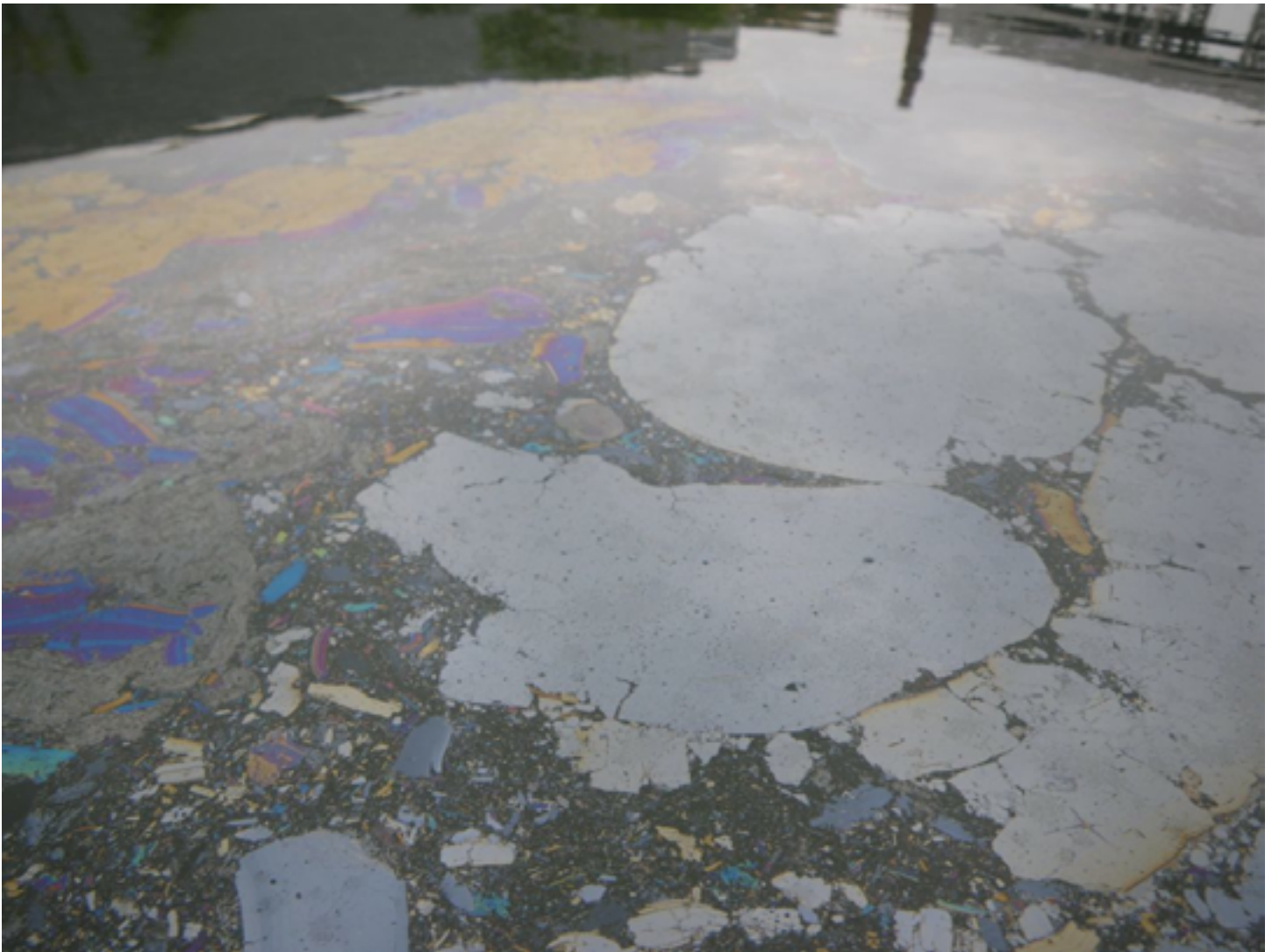
Fig. 11. “iridescent residue from the manufactured gas plants that contaminated this place for years,” from Evolution with Eben Kirksey and Latasha Wright, 7/4/2015.

“Go somewhere else!” Nature intermingles with pollution and filth without any qualms, even if we find the muck of our own making monstrous or uninhabitable. Conversely, many of the journals for the Gowanus trips include photographs where the still and stagnant water of the canal strikingly reflects the colorful shapes of the rusted bulkheads, silos, colorful cement factories, cranes, sheds, and drawbridges that line the shores (Fig. 10). These images of a post-industrial waterfront and Superfund site are classically beautiful and poised. Lorenz even manages to capture the compelling ways in which a permanent oil slick that glistens on the surface of one section of the