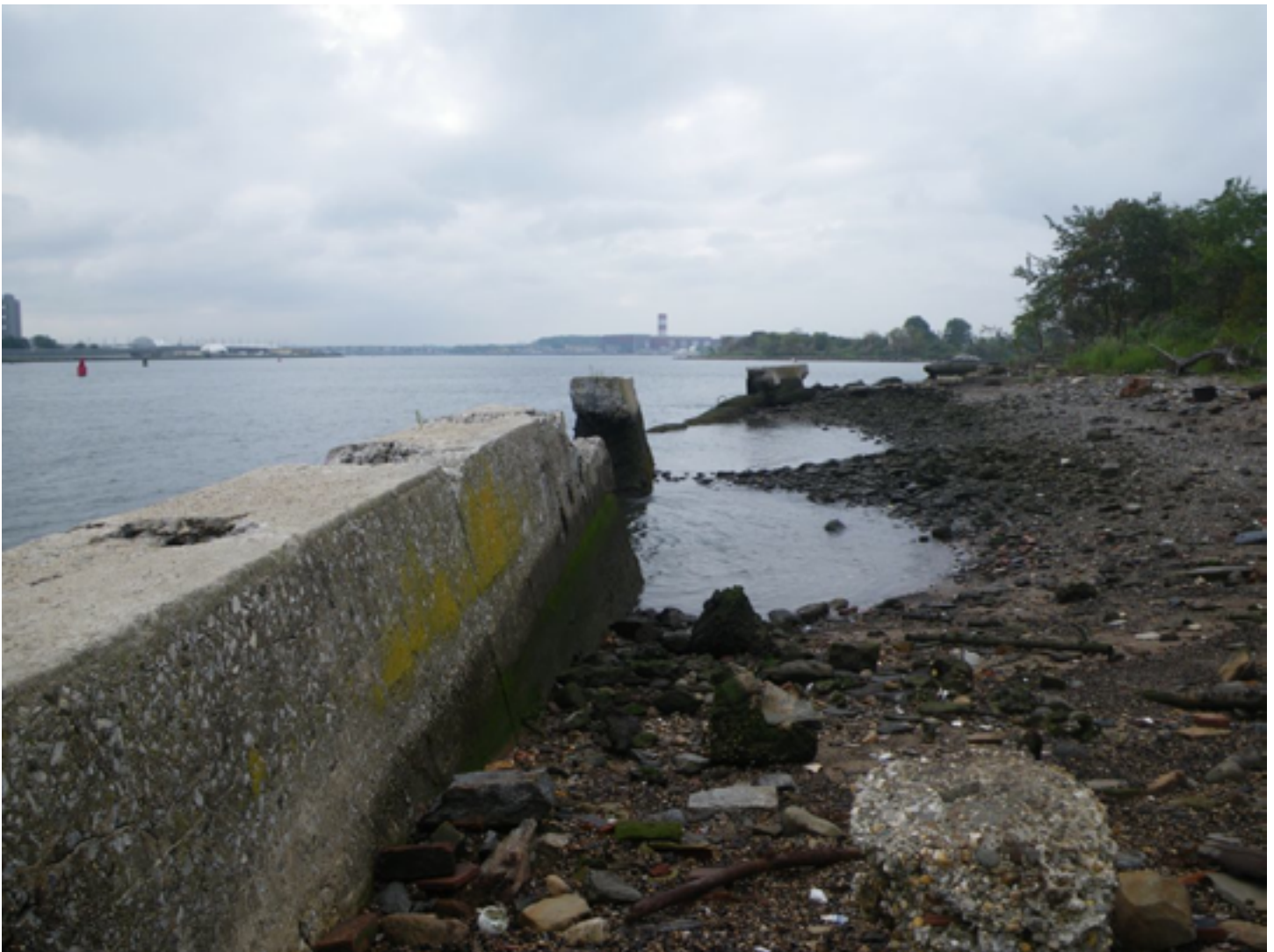
Fig. 3. “We talked about how water is used as a barrier, psychological as well as practical,” from Freedom/Captivity with Lisa Sigal, 9/5/2013.

Lorenz also documents her conversation with Sigal, in which they consider how water can be used to separate people from one another as well as to facilitate connection. “Both a road and a barrier,” Lorenz writes (Figs 3-4).