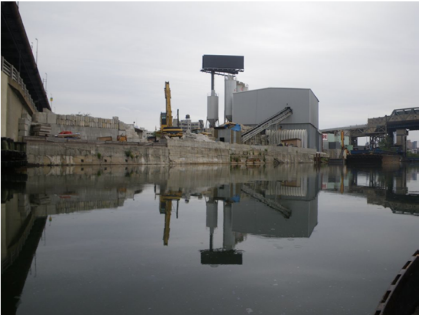
Fig. 14. “nematode worms, polychaete worms, annelid worms – those all look like worms to us but they are radically different,” from Evolution with Eben Kirksey and Latasha Wright, 7/4/2015.

out. In it, Lorenz shows us a fenced-off, stagnant patch of water facing a blank billboard. A small island of Styrofoam, plastic soda bottles, and a raft of unidentifiable, brownish debris floats in the center of this water. The caption to the photograph, “”This is where I always wanted to be! She said,” is startling, horrific. Ray’s exclamation makes more sense in the narrative, where we learn that this spot is one she had frequently seen and photographed from the roadway above. And yet the dissonance between emotion and image that is found in this image/text pairing is still