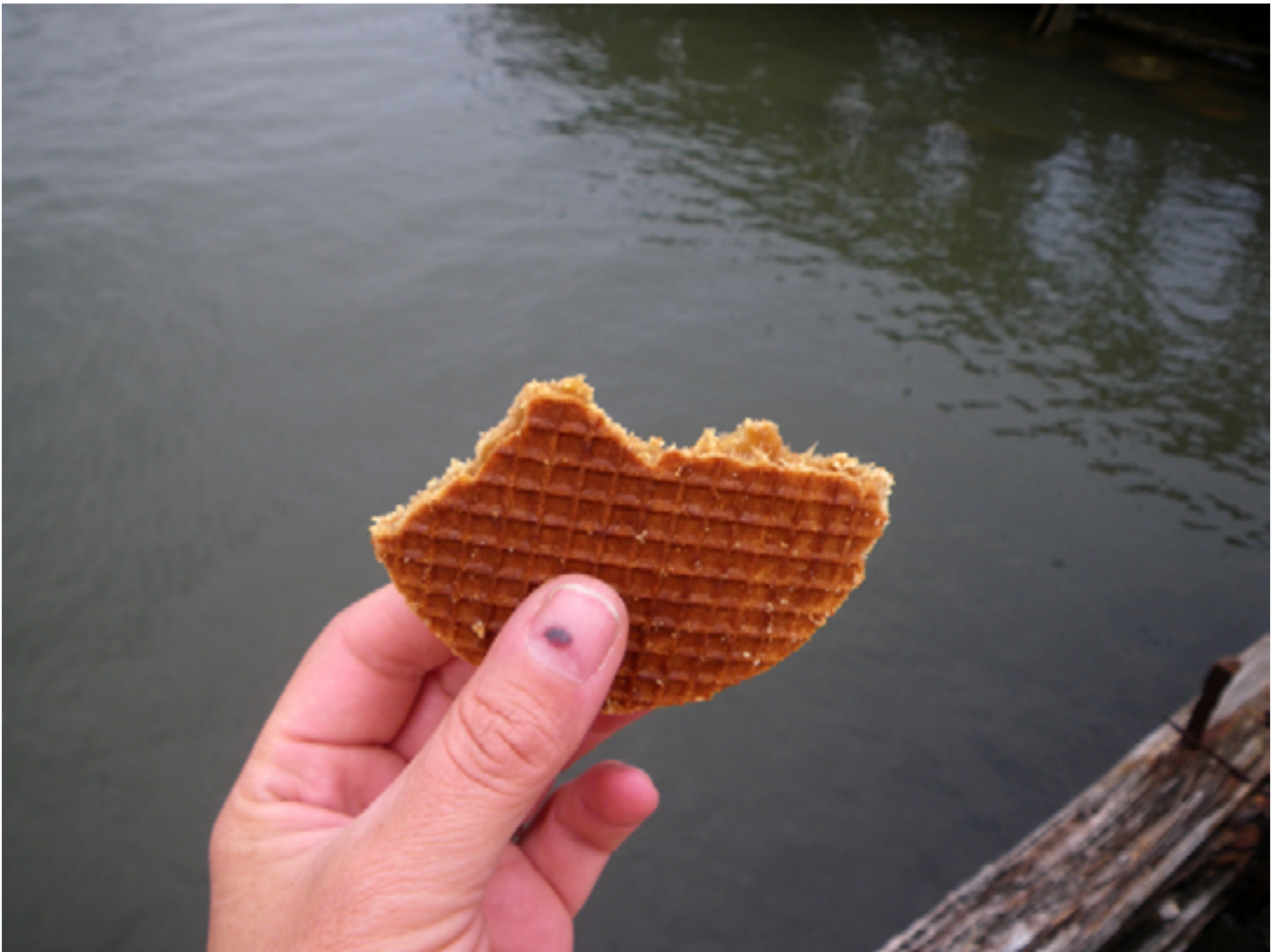
Fig. 6. “Sarah brought ‘Stroopwafel’ from the Netherlands,” from Tidal Cycles with Sarah Cameron Sunde and Kara Hearn , 6/26/2015.

Passengers on the Tide and Current Taxi not only shape the trip and return Lorenz’ act of generosity with the ideas or views they share, they also reciprocate in concrete ways, and these tiny gifts are regularly celebrated in the photo journals of the Taxi . Images and text describe a wonderful sandwich or special cookie brought and shared