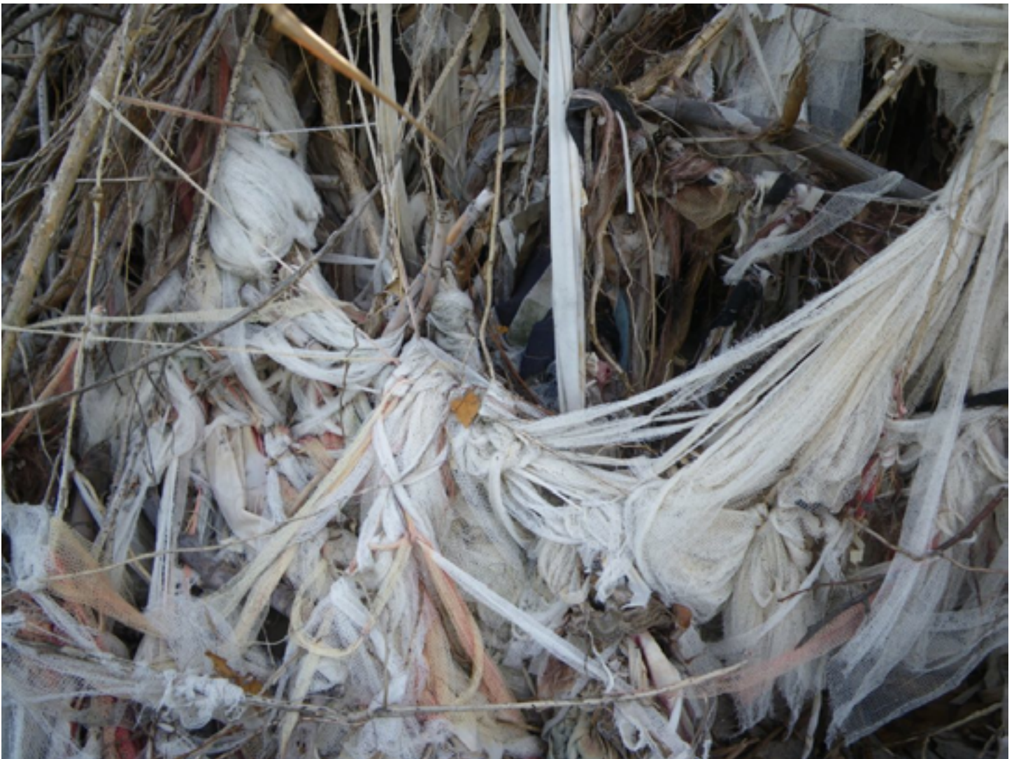
Fig. 13. “There was something scary about digging into this hundred-year-old trash,” from Treasure Map, with Essye Klempler and Beverly Acha, 9/6/2013.

decay as much as I do.” Moments later, Lorenz asks the scientists if there is more life in the city above the water or below, and they begin to list off the many things living in each realm. Below a photograph of the Gowanus cement plant, its sheds, silos, and conveyors reflected in still, seemingly lifeless water, Lorenz quotes the scientists listing the species living in the water: “Cnidarians, mollusks, amphipods, decapods, nematode worms, polychaete worms, annelid worms, nematode worms.” The dissonance between the seemingly inert scene represented in the photograph and this extensive list of vibrant living things initially seems comical, but it also