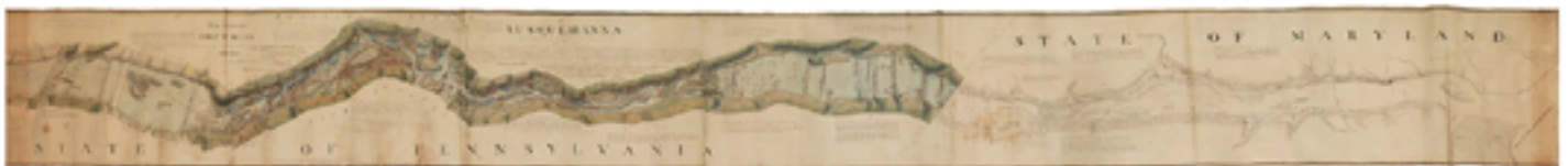
Benjamin Latrobe, Susquehanna River Survey Map, 1817 copy after 1801-02 original, pencil, pen, ink, and watercolor on paper, Special Collections

interventions, decades before the articulation of "ecology" as a scientific concept by late nineteenth-century naturalists such as Ernst Haeckel. [1] This map, which currently survives as a copy donated to the Library Company of Baltimore (now the Maryland Historical Society) in 1817, provided a detailed engineering and natural history record of the lower Susquehanna, one of the most important commercial rivers in the Mid-Atlantic region. The river supported agriculture and lumber industries on its shores and branches, but rapids, small islands, and large rocks