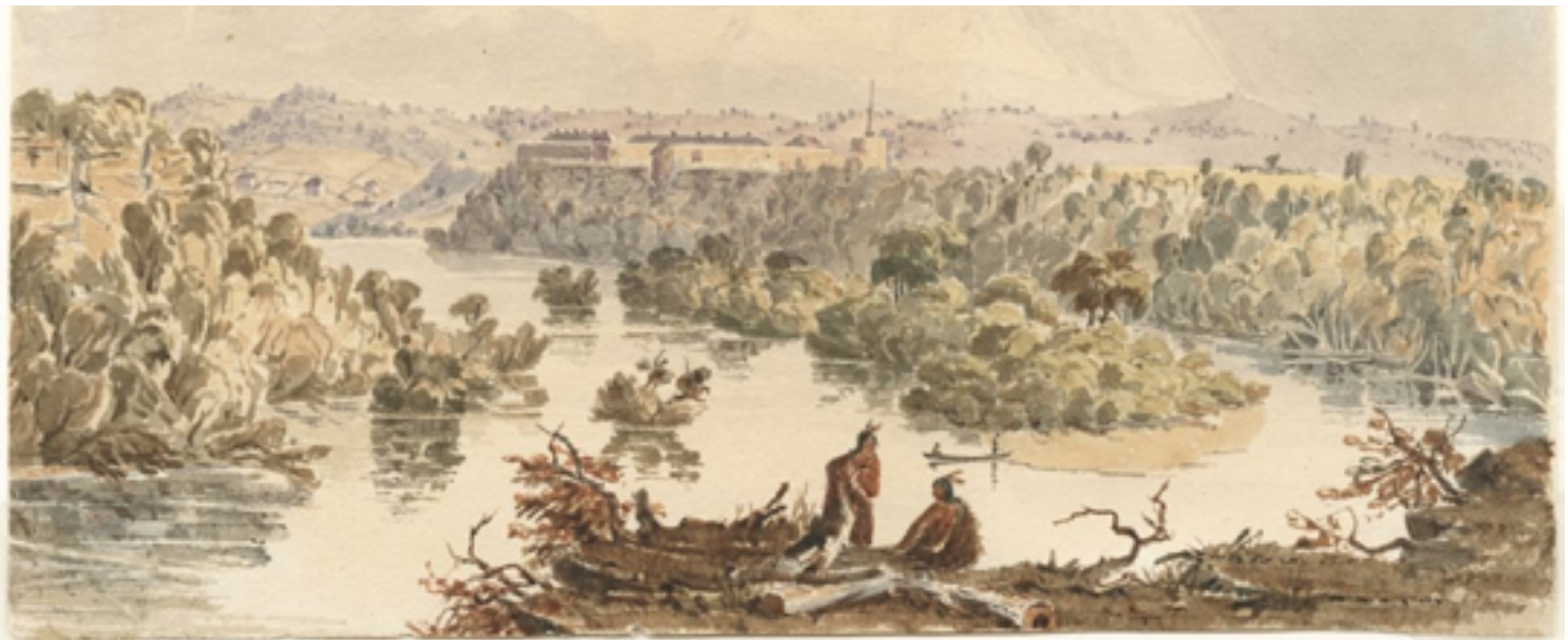
Seth Eastman, Detail of Distant View of Fort Snelling, 1847-49. Watercolor.

iterations, many of the essays and columns in this issue look beyond the Mississippi to consider a wide range of rivers and currents. We hope this breadth will encourage a rethinking of that iconic river through other conduits. The idea for this issue began with a panel, entitled “Fluid Currents: Water, Art, and Ecology,” that we co-chaired at the Southeastern College Art Conference in October 2015. Inspired by the conference’s host city of Pittsburgh, located at the confluence of three rivers, we wanted to generate a conversation about different ways that artists imagined and represented water conduits and their relationships with human and nonhuman life. Our call for papers received a large number of responses, ranging from the design of Baroque bridges and eighteenth-century fountains to early