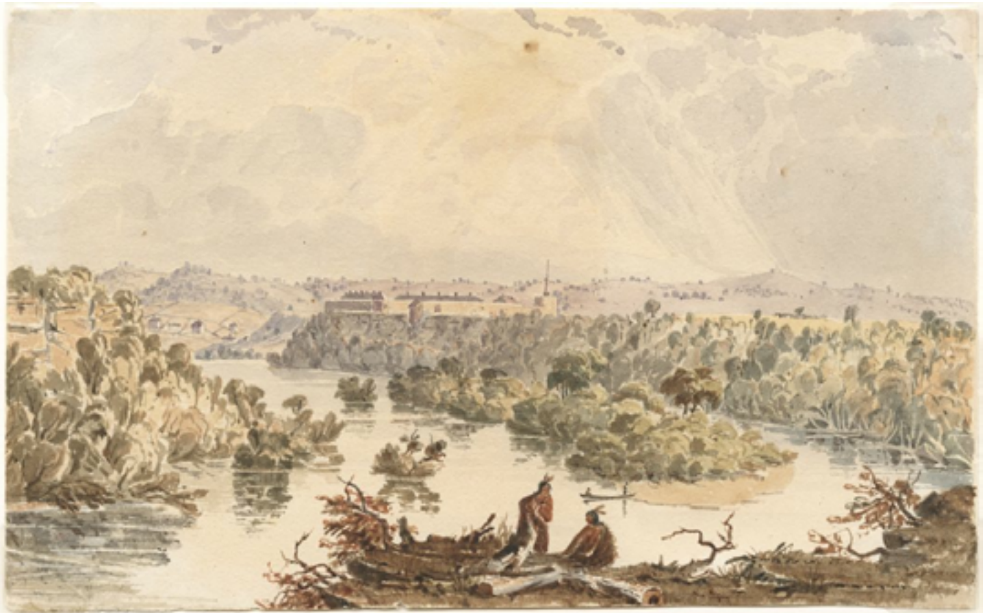
Seth Eastman, Distant View of Fort Snelling, 1847-49. Watercolor.

In the 1830s and 40s, Eastman created hundreds of postcard-sized watercolors depicting the Mississippi River valley. [4] Although they were not seen by many people at the time as such, the watercolors were the building blocks for easel paintings that Eastman exhibited in New York and St. Louis and a popular moving panorama by Henry Lewis that toured the U.S. and parts of Europe, its scrolling movement and theatrical presentation simulating a steamboat tour of the Mississippi. Eastman's views were disseminated even more widely as engravings and lithographs in illustrated magazines, as well as ethnographic and folkloric volumes by Henry Rowe Schoolcraft