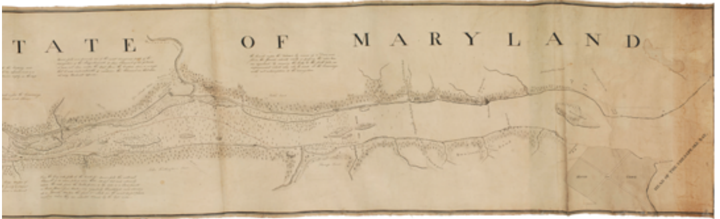
Benjamin Latrobe, Susquehanna River Survey Map, 1817 copy after 1801-02 original, pencil, pen, ink, and watercolor on paper, Special Collections, Courtesy of the Maryland Historical Society.