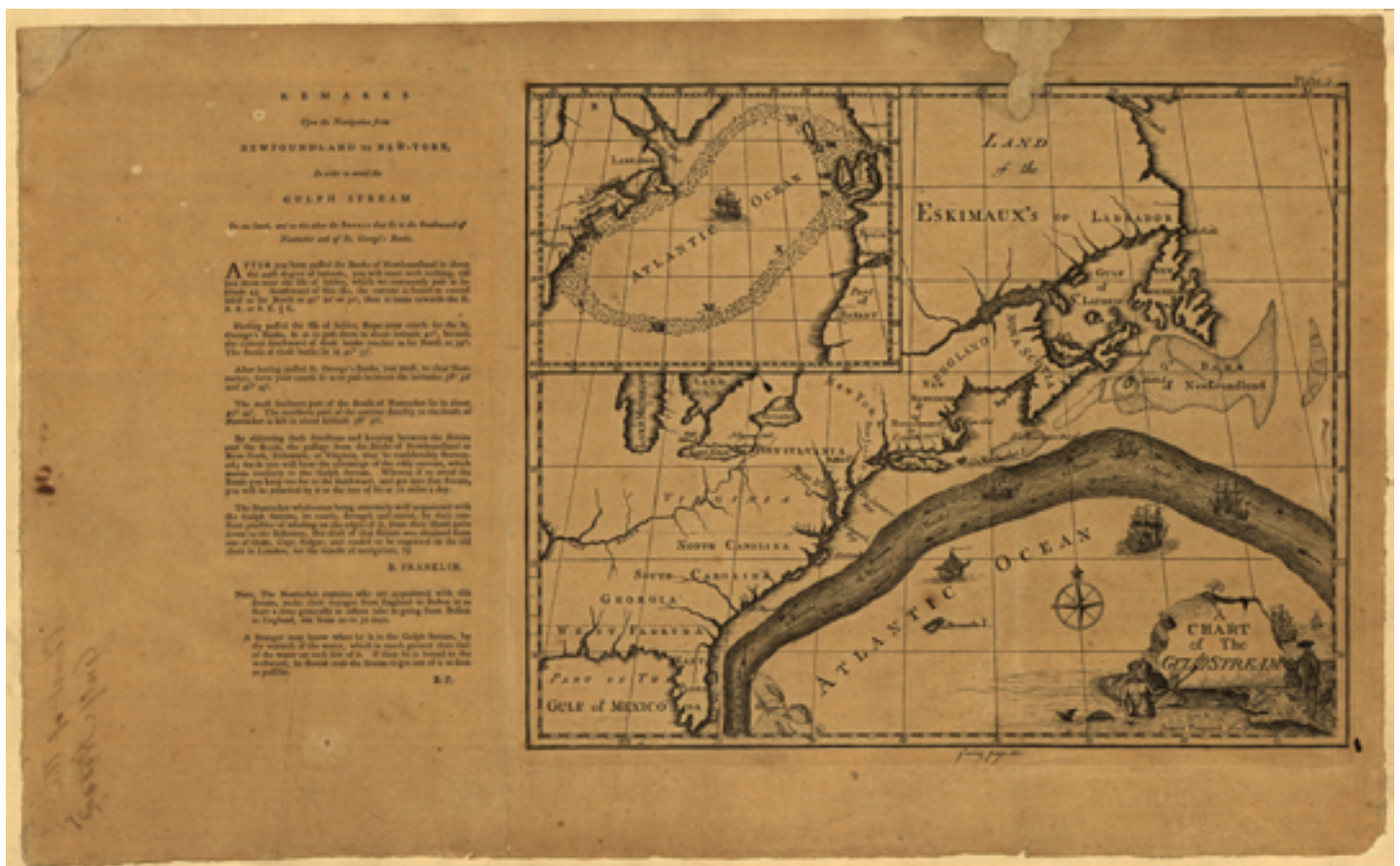
Figure 2, “A chart of the Gulf Stream,” Benjamin Franklin, James Poupard, engraver. Appears in “Maritime Observations” in the Transactions of the American Philosophical Society , 1786. Library of Congress Geography and Map Division, Washington, D.C.

the lower left edge of the page to the bottom right corner, a collection of densely engraved lines suggests the ocean’s flow. Arrows and notations of “minutes”—a method for measuring distance in nautical miles—indicate the current’s direction. Ships dotted along the stream and just outside it