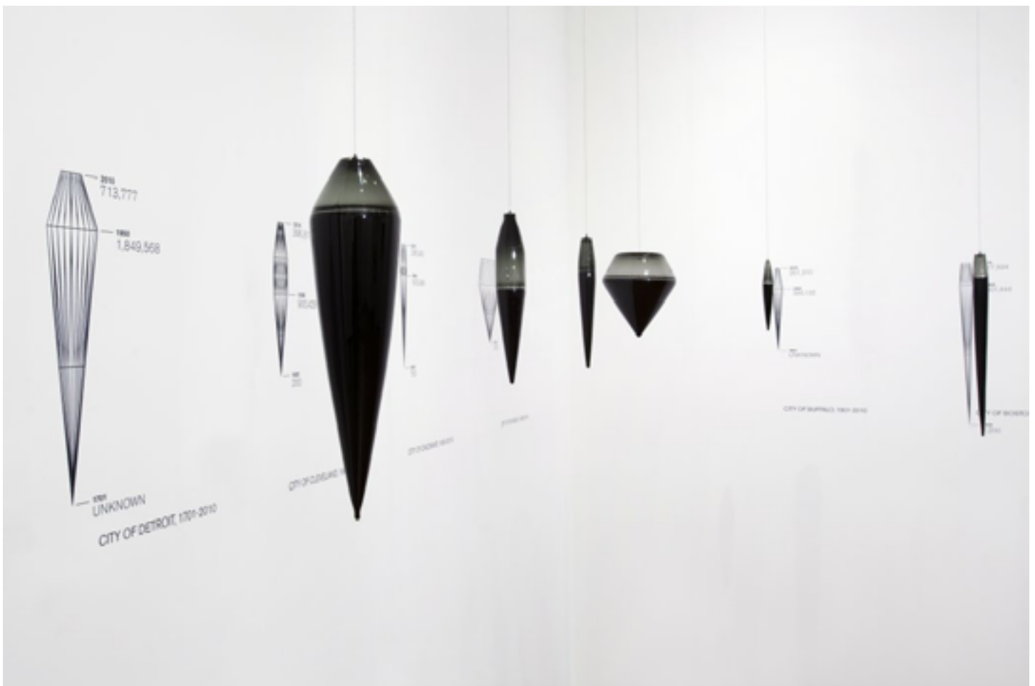
Norwood Viviano (American, b. 1972), installation detail of Cities: Departure and Deviation, 2011, blown glass and vinyl cut drawings.

The museum hosted two unique movement performances that investigated the theme of water from symbolic and religious perspectives. In Water Relics , a performance choreographed by dance professor Megan Thompson and theater artist Jenifer Alonzo, dancers led visitors through