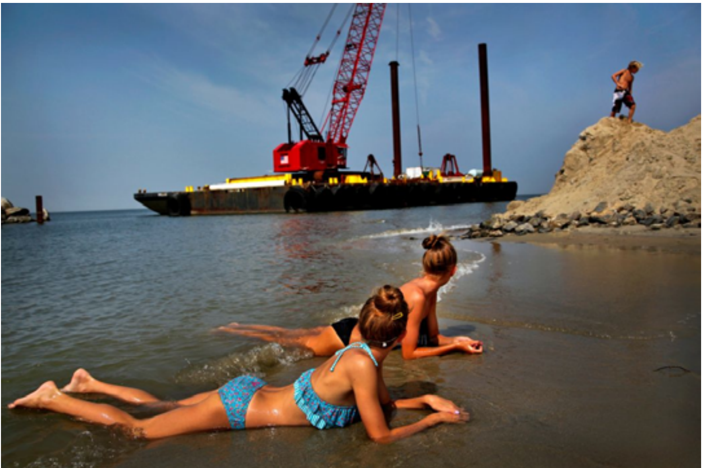
Preston Gannaway (American, b. 1977), Twins, 2013, from the series Between the Devil and the Deep Blue Sea.

Working with Virginia Sea Grant, Old Dominion University, and the Hampton Roads Planning District Commission, the museum also hosted the Adaptation Forum, a quarterly meeting designed to bring together flooding adaptation