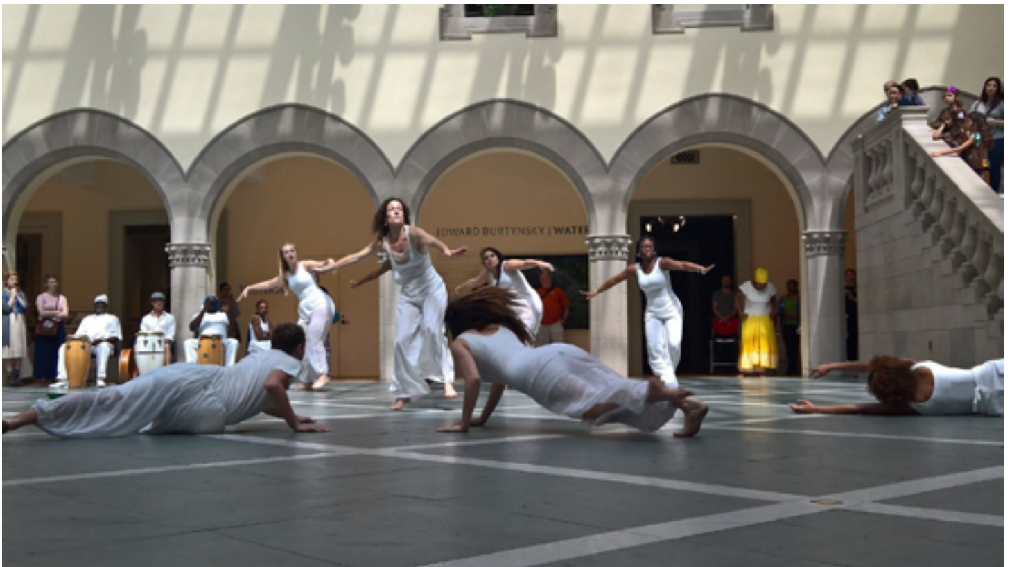
Waters in our Midst.

region's broader preparedness efforts. The City of Norfolk has recently appointed a Chief Resiliency Officer to address flood adaptation issues, and the museum will serve as a forum for strategizing city-wide flood mitigation initiatives. The museum has also begun participating in the Norfolk Resiliency Office's outreach programs, like those teaching residents how to reduce rainwater flooding through landscaping and rain-capture devices. Again working with the city, the museum has helped write a National Endowment for the Arts grant for a public art project that will respond to sea level issues and a museum representative will serve on the selection committee. Finally, the museum education team will design its annual summer camp as a STEAM (science, technology, engineering, arts, and mathematics) program that investigates water in all its forms, and the educators will lead programs at a new statewide charter school that challenges participants to design a museum capable of embracing and responding to water.