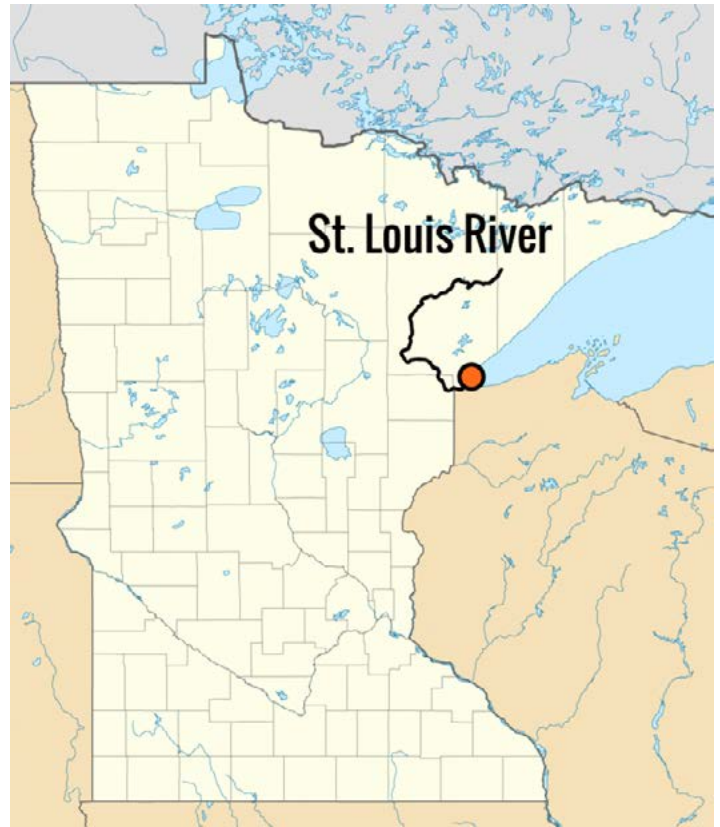
Map of Minnesota and the St. Louis River showing the location of Duluth (MN) and Superior (WI), marked in orange.