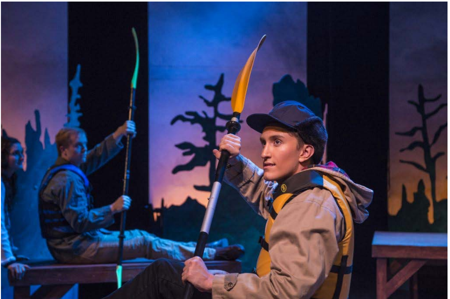
Kayaking on the St. Louis. Scene from “One River.”

As they explored the intertwined ideas of “story” and “sense of place” throughout One River , the players evoked the Department of Natural Resources, the Nature Conservancy, and other agencies and advocacy groups. The characters invited all to enter into the stories and to participate in shaping the narrative. The story would not have been complete without attention to the conflict that grips the region today. Communities throughout the North Country and the region are debating the pros and cons of copper-nickel mining: a promise of renewed mining jobs on the