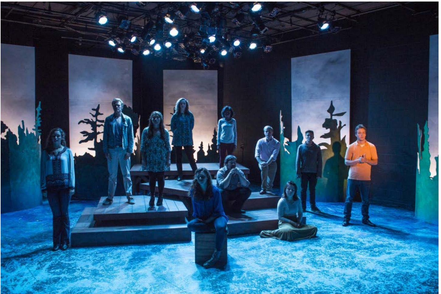
Scene from production of "One River" at University of Minnesota Duluth.

The play grew out of “ One River, Many Stories ,” a year-long initiative launched in fall 2015 by UMD