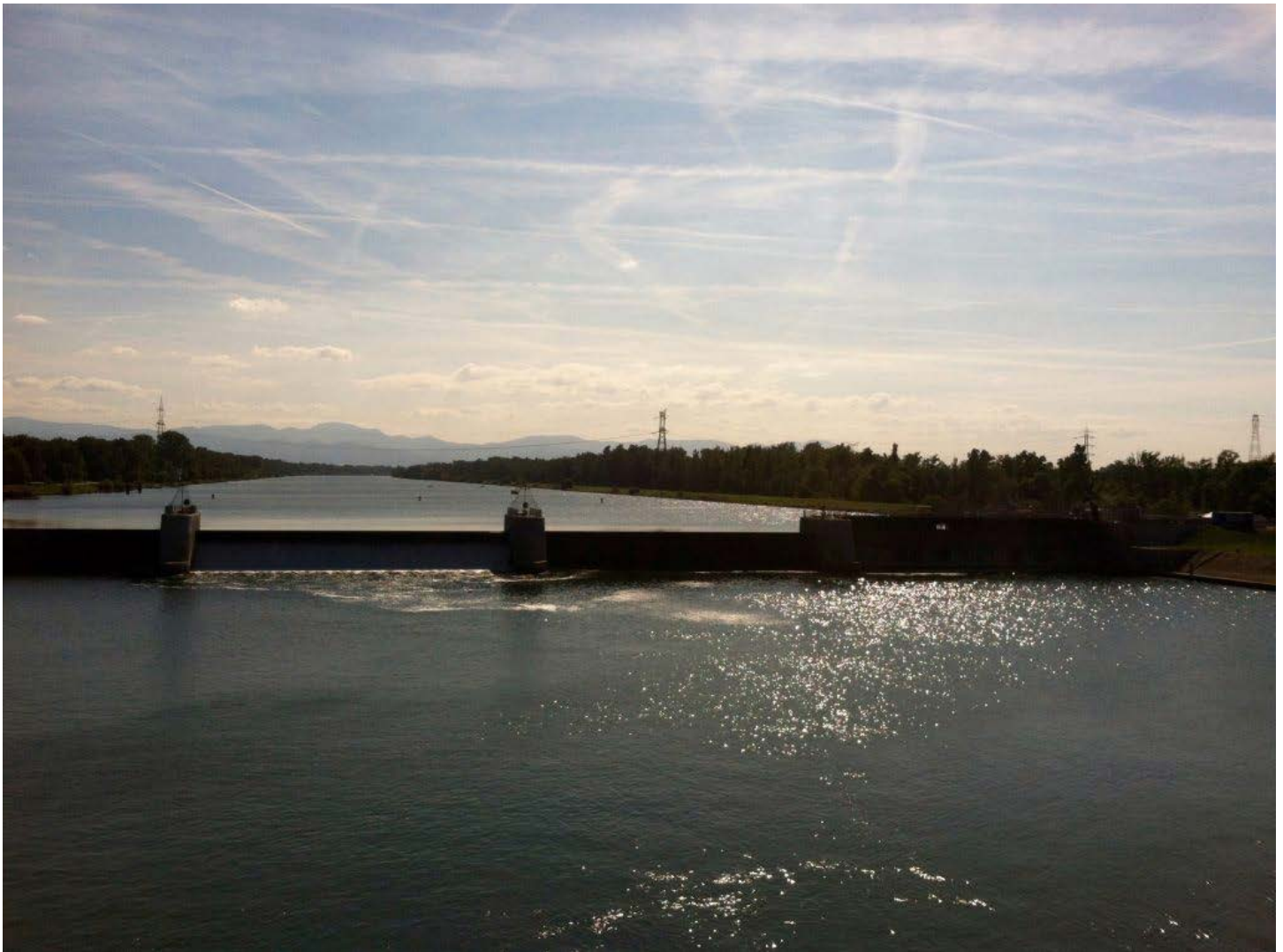
Weir dam and lock on the Rhine River at Breisach, Germany.

and sustainability in theory and in practice. I have grown especially interested in water issues. I care about the Mississippi riverfront in Minneapolis, the effects of agriculture on water quality, and the connections people have to their