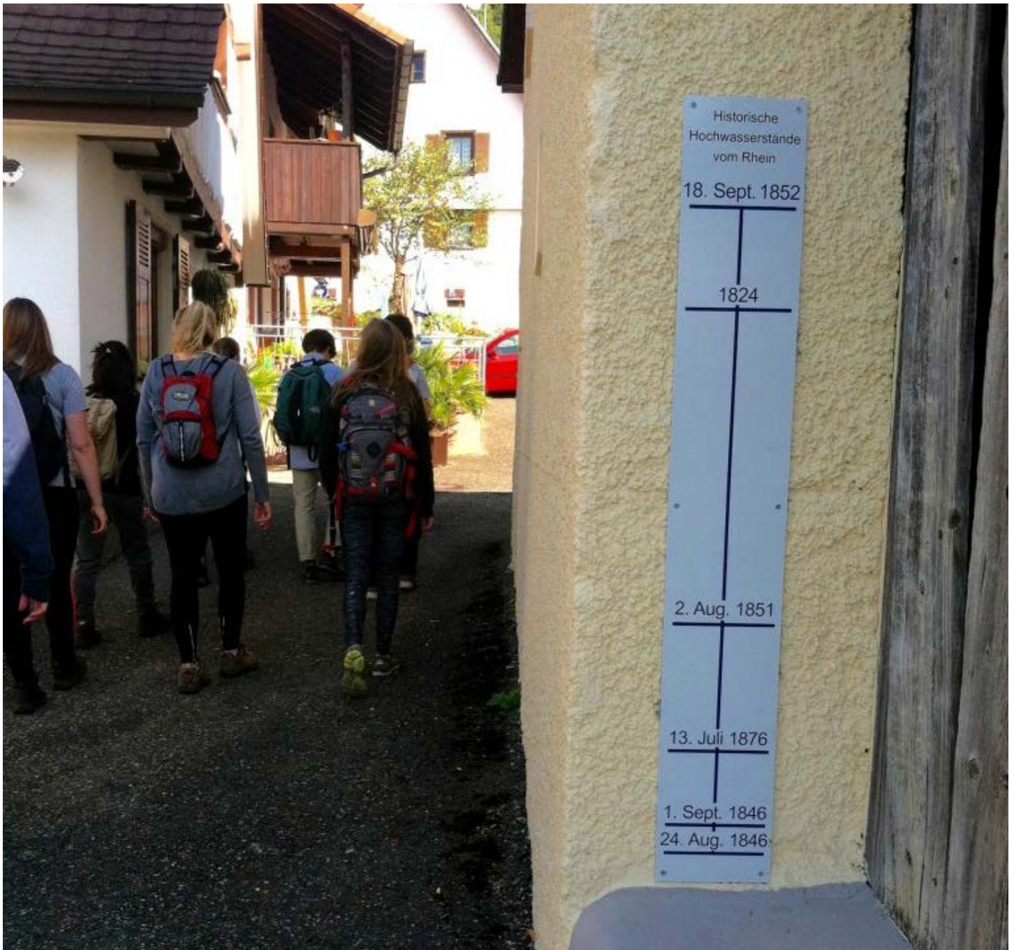
Students walk past a sign indicating historic flooding levels prior to channelization of the Rhine River in Istein, Germany.

Additional canalization in the Upper Rhine Valley is seen in the extensive Grand Canal of Alsace. It has several locks and dams and allows