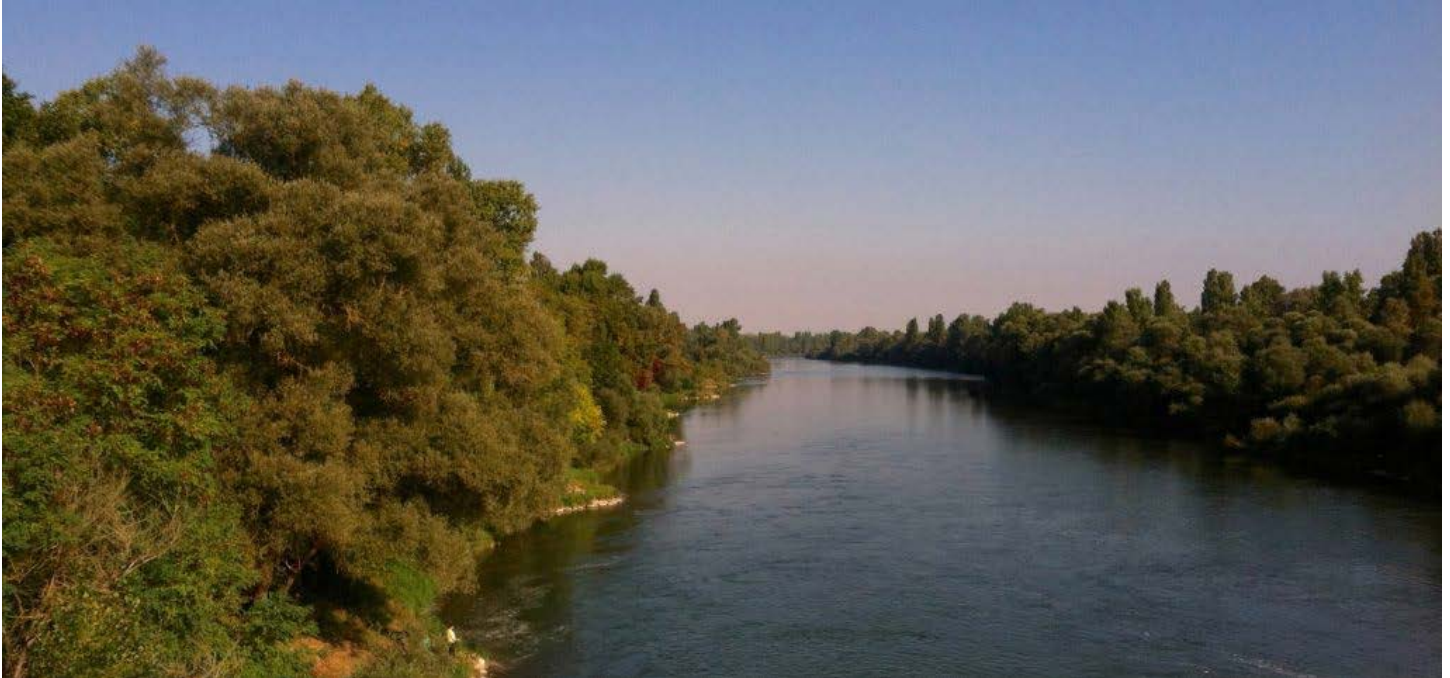
“Natural” Rhine River channel allowed to flood near Hartheim, Germany.

Of the proposed projects necessary for full implementation of flood regulation on the Rhine, some have encountered resistance. At a project near Hartheim, for example, local citizens put up a billboard to express their concerns about increased truck traffic through their town. The project involved the removal of thousands of truckloads of gravel which allowed the river to flood into the gravel pit area. Despite the local frustrations, within two years there was successful regrowth of the willow-poplar alluvial forest. Other projects have yet to be completed.