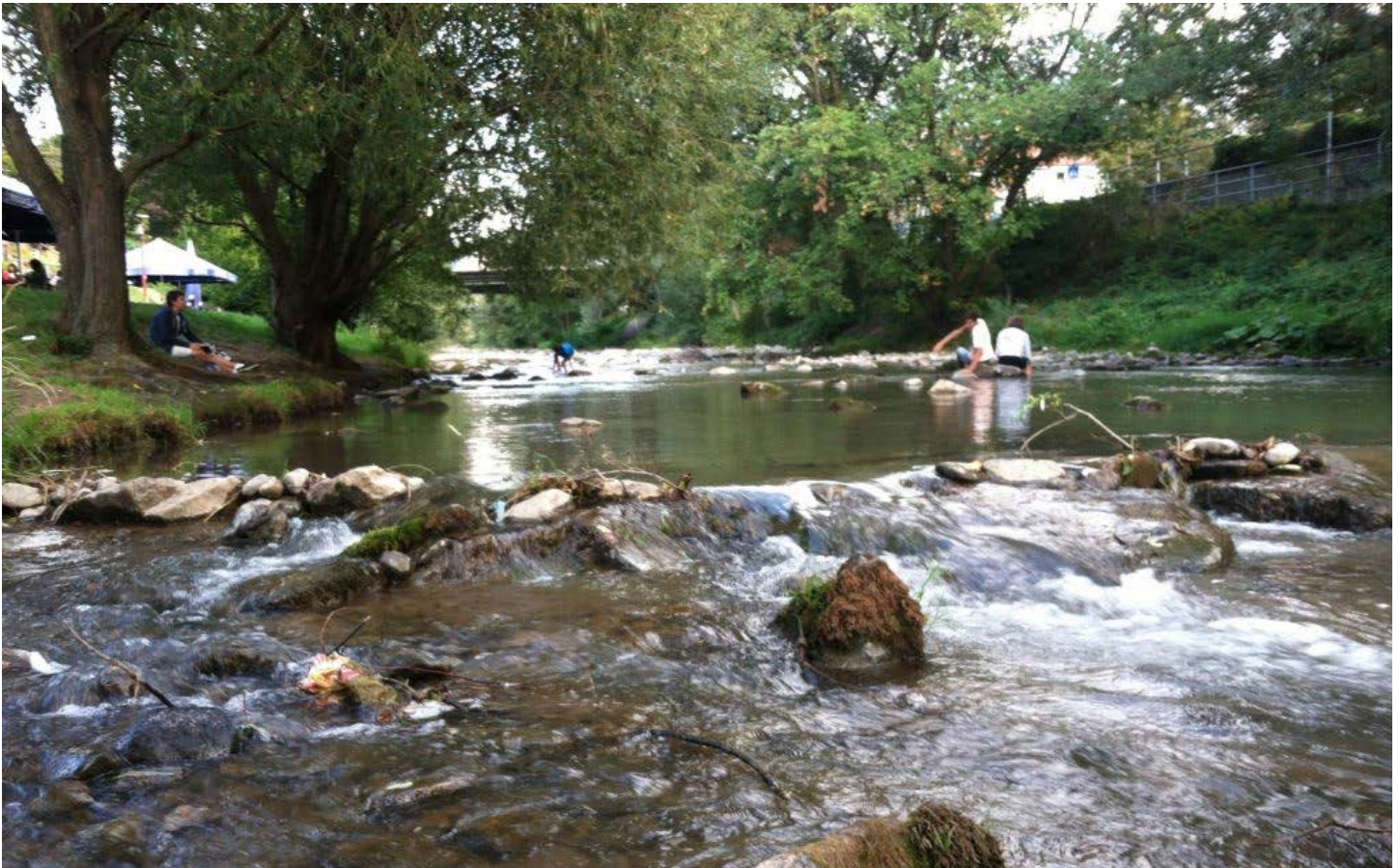
Wading near a streamside cafe in Freiburg, Germany.