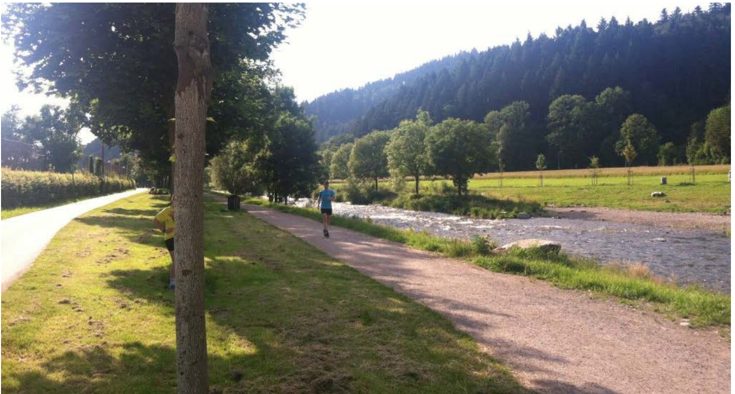
Express bike route, pedestrian path, Dreisam River and picnic grounds in Freiburg, Germany.