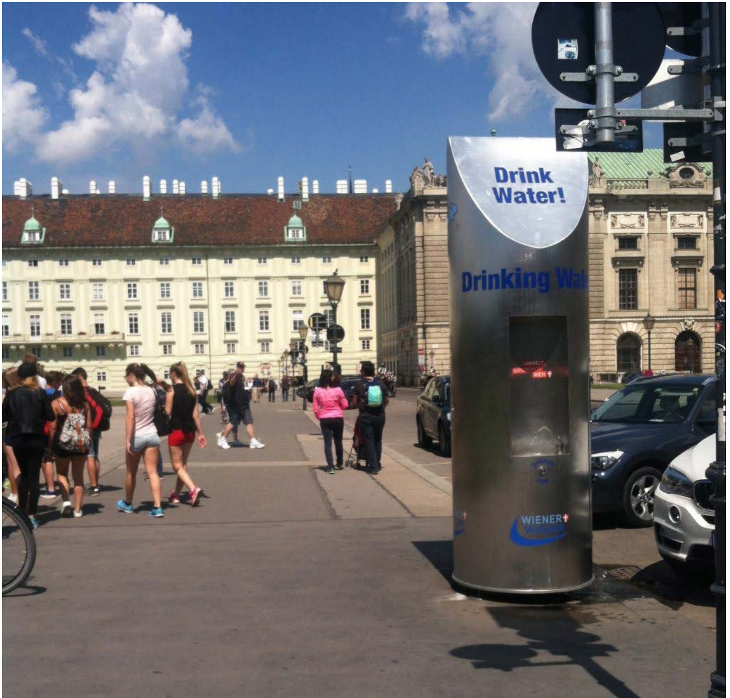
Viennese drinking fountains feature spigots and a mist shower.