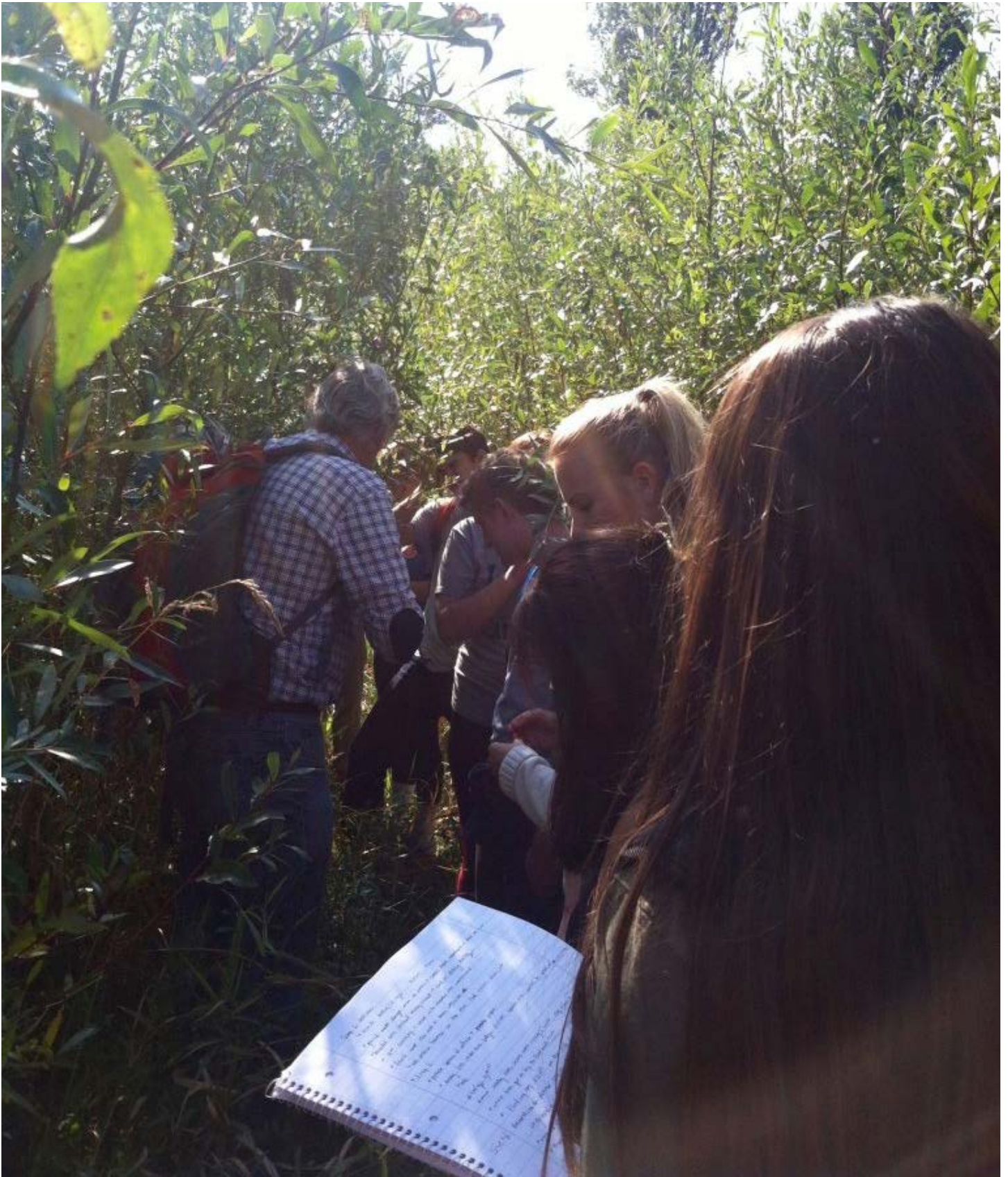
Students learn about a successful new flood mitigation forest several miles from another project facing opposition at Harthem, Germany.