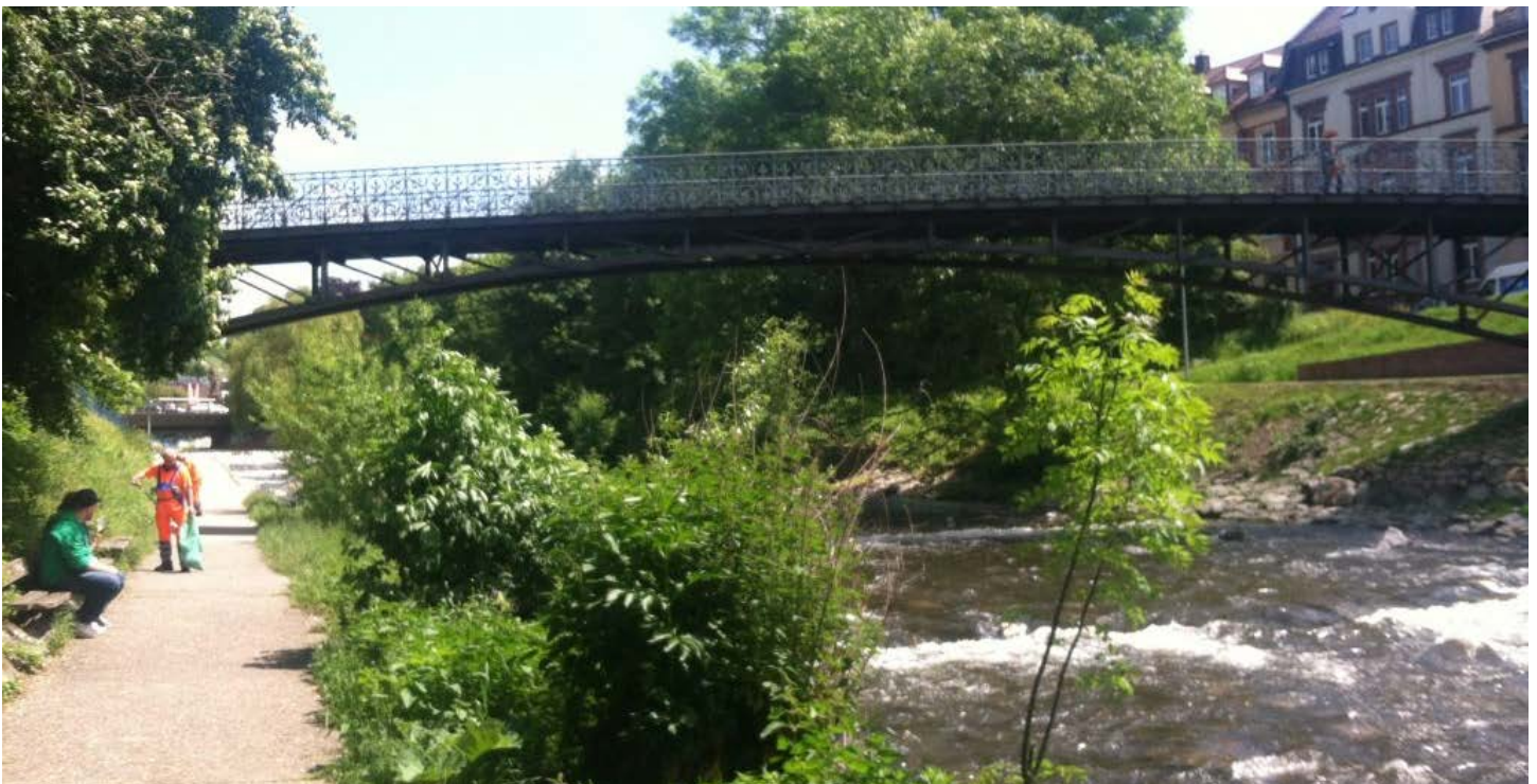
Pedestrian paths and bridges along the urban Dreisam River in Freiburg, Germany.