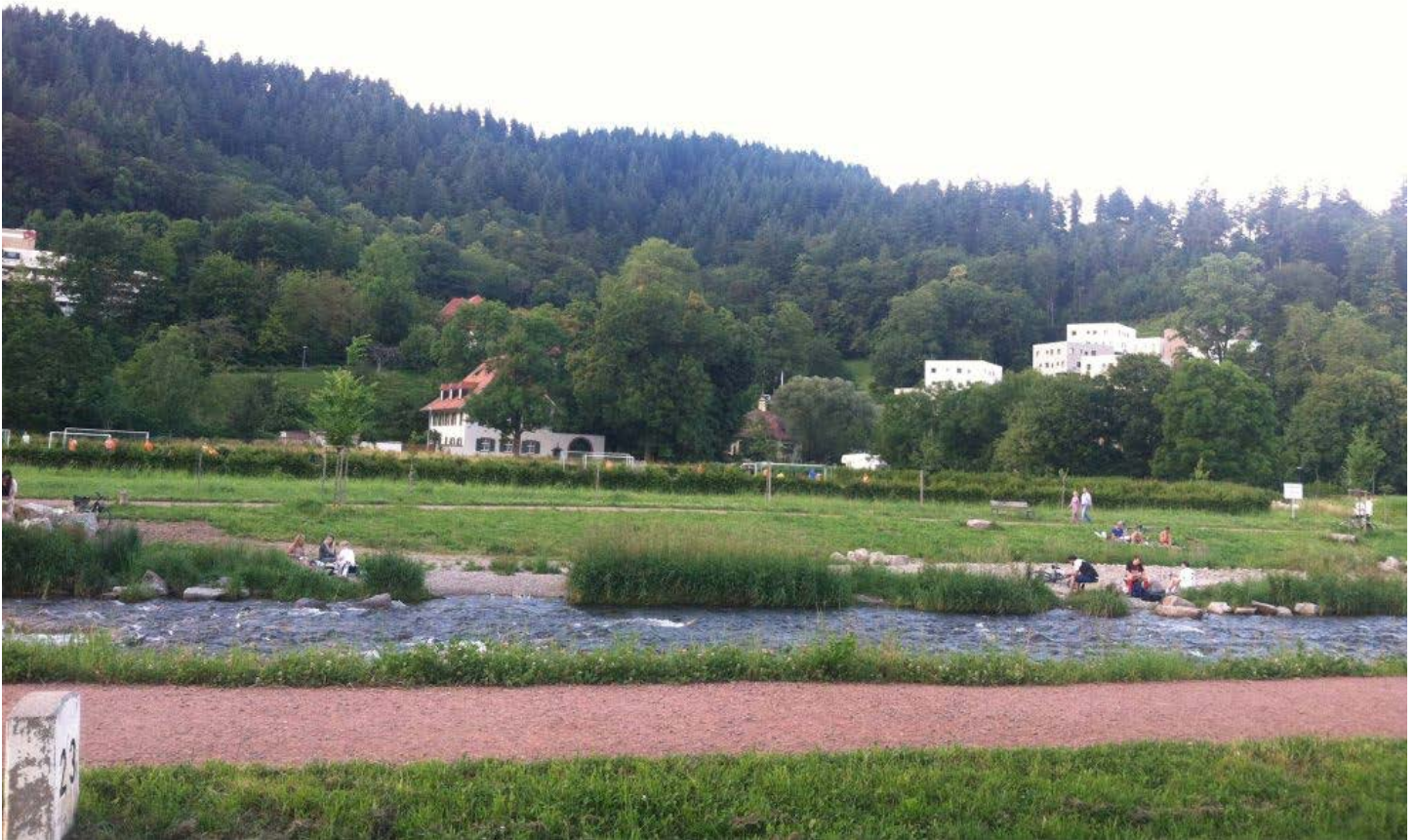
Picnickers enjoy the Dreisam River and the beginning of the Black Forest in Freiburg, Germany.

On the other riverbank of the Dreisam, opposite the walking path, there is an express bike route. At the intersections where the bike route meets a road, the bikes have the right of way. This express bike path is part of the city's Bicycling Concept for 2020 because it gives easy access to important neighborhoods, to the city center, and to other attractions like the stadium located along the river. The riverfront bike path extends several dozen miles. High water levels are monitored by public gauges reporting daily streamflow; the