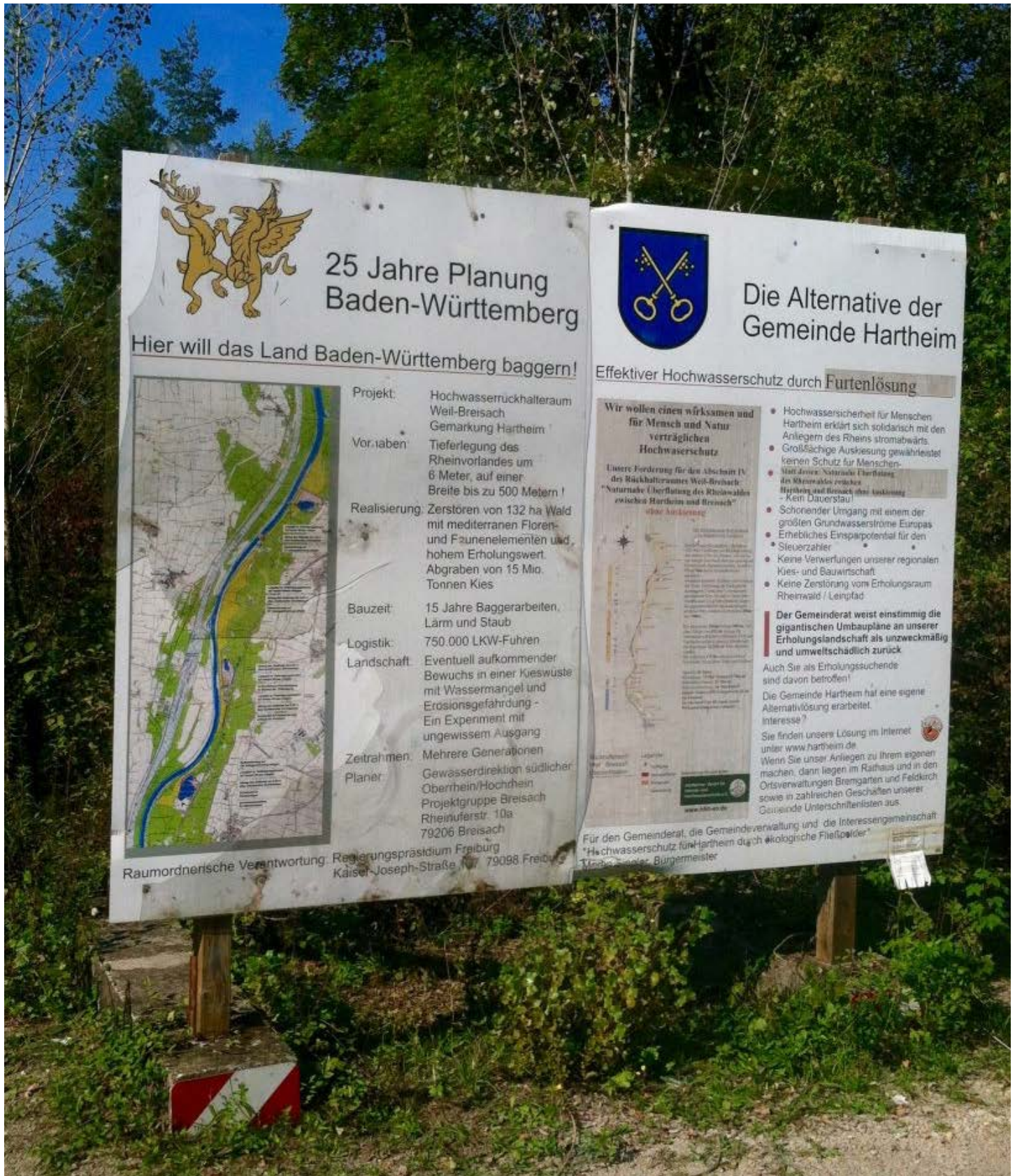
Citizen activists oppose a flood management project with this billboard on the proposed site near Hartheim, Germany.