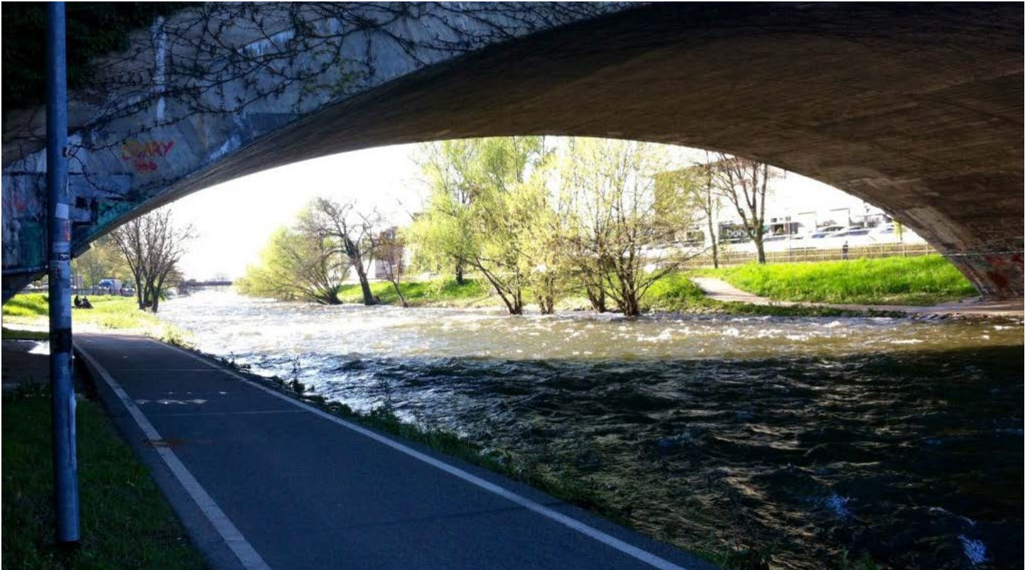
High water levels nearly flood the Dreisam River bike route in Freiburg, Germany.