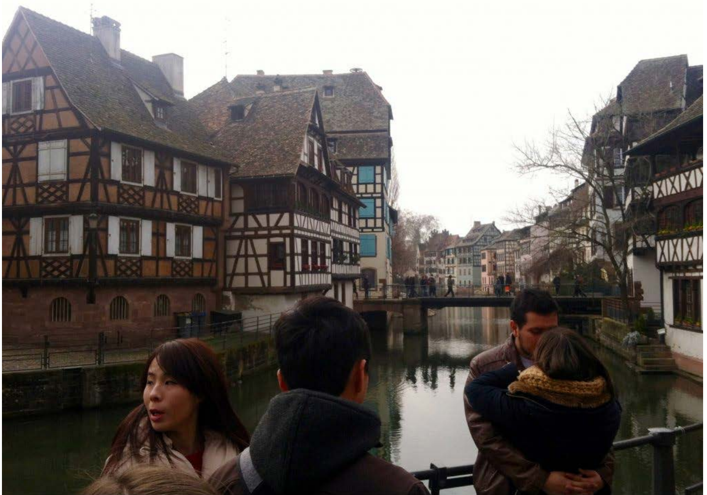
Tourists and Tanner's House in the Petite France area of Strasbourg, France.

centuries of shifting control, the region also had shifting borders and developed its own language, culture, and river borderland history.