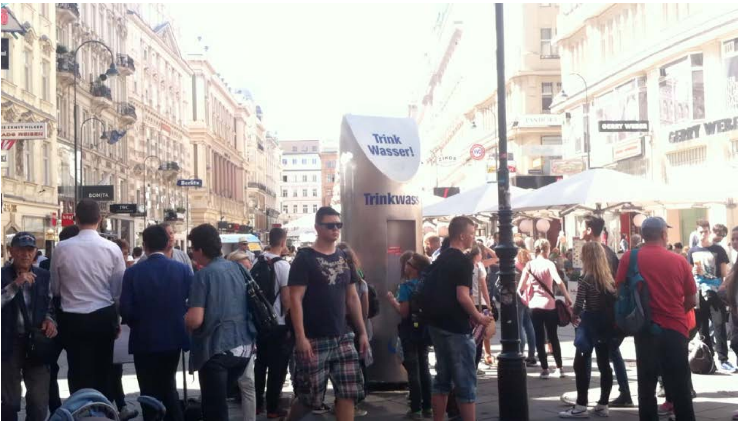
One of twelve drinking fountains in Vienna, Austria, designed for the European Soccer Championships.

designed for the European Soccer Championships to provide refreshment to fans in crowded public places. They have “Drink Water!” written prominently (in German and English) and feature two spigots and a button-operated mist shower. These movable fountains are now set up in the most popular tourist areas of the city to provide free fresh drinking water.