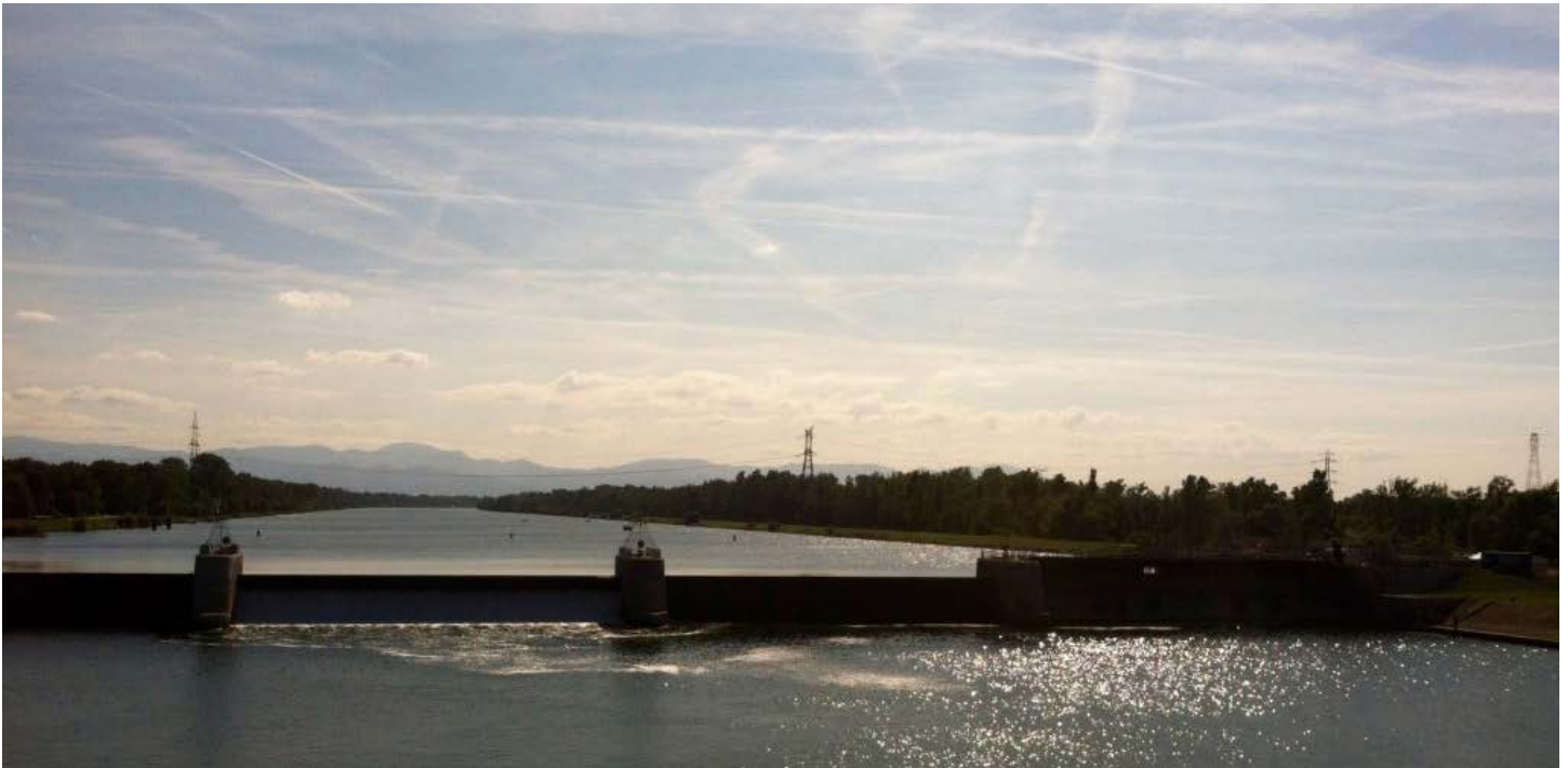
Weir dam and lock on the Rhine River at Breisach, Germany.