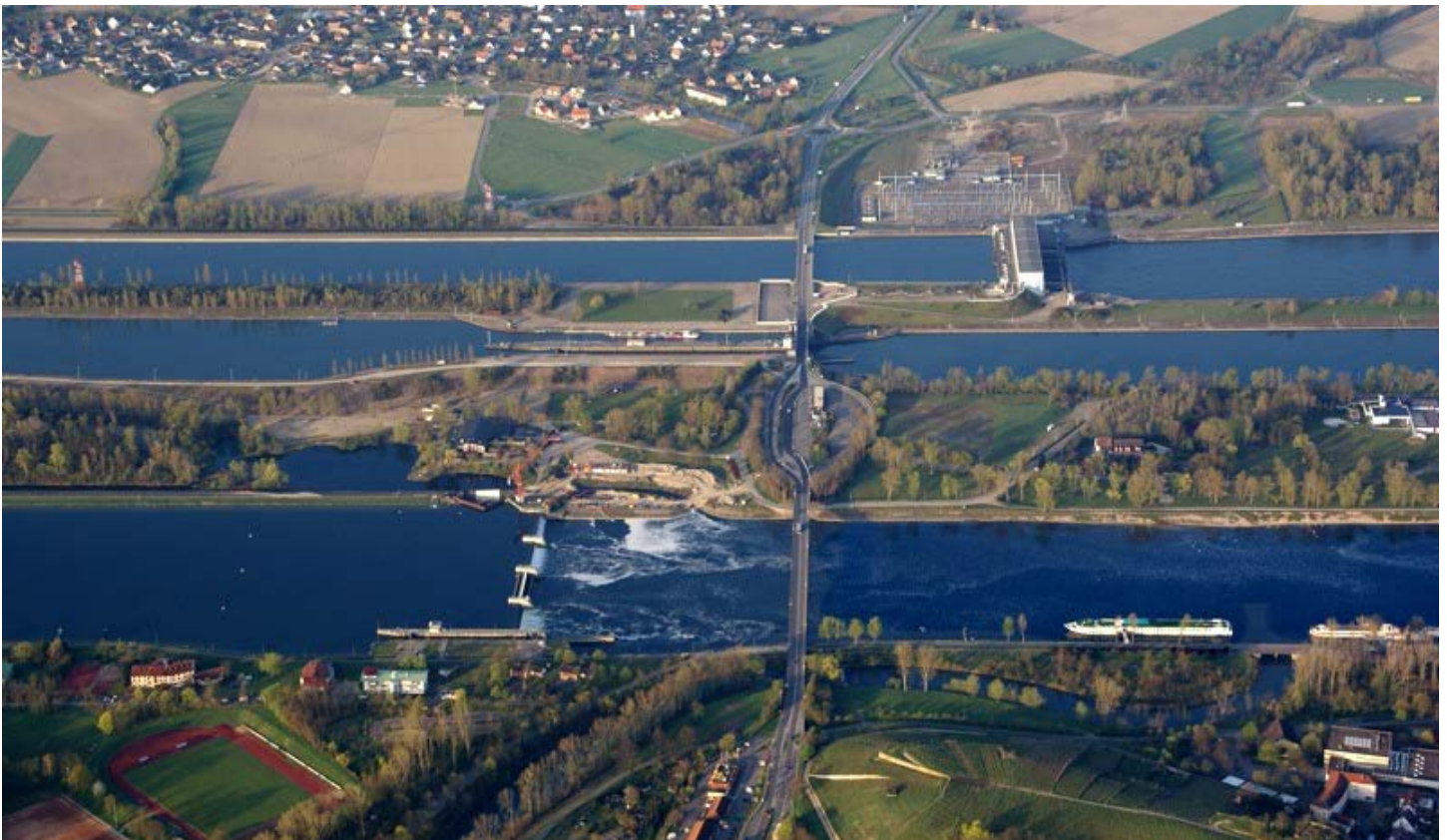
From the bottom of the image to the top: Rhine Canal, navigation channel, hydroelectric plant. Breisach, Germany.