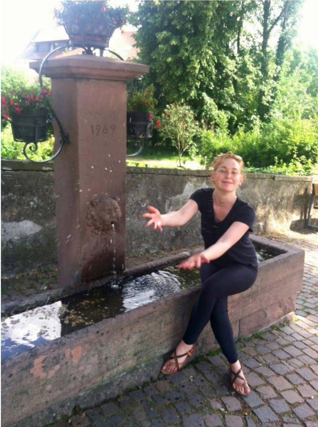
Drinking fountain near Freiburg, Germany.

of places, it's impossible to make generalizations about "Europe" overall. There are so many histories, so many languages and dialects, so many different cultures. Here are some things I observed, organized by their scale on the landscape.