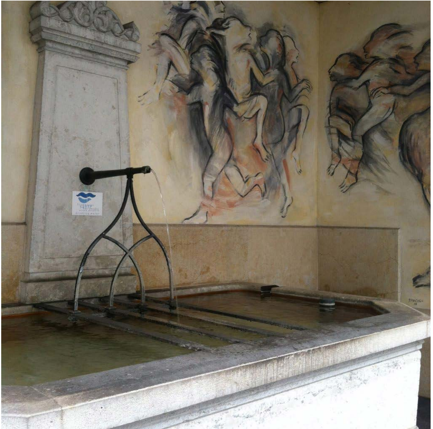
Water fountain and mural in Basel, Switzerland.

Whereas in the United States we have drinking fountains inside all schools, businesses, and most public buildings, I don't think I ever saw