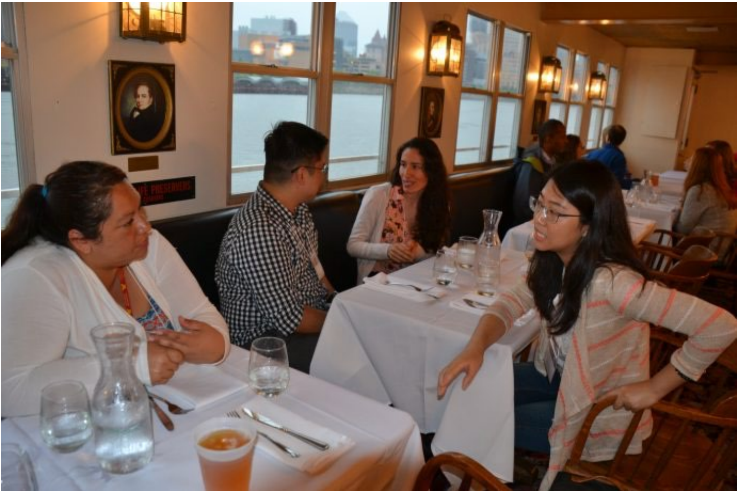
Grasping Water attendees having dinner on board the sternwheeler Jonathan Padelford on the Mississippi River.