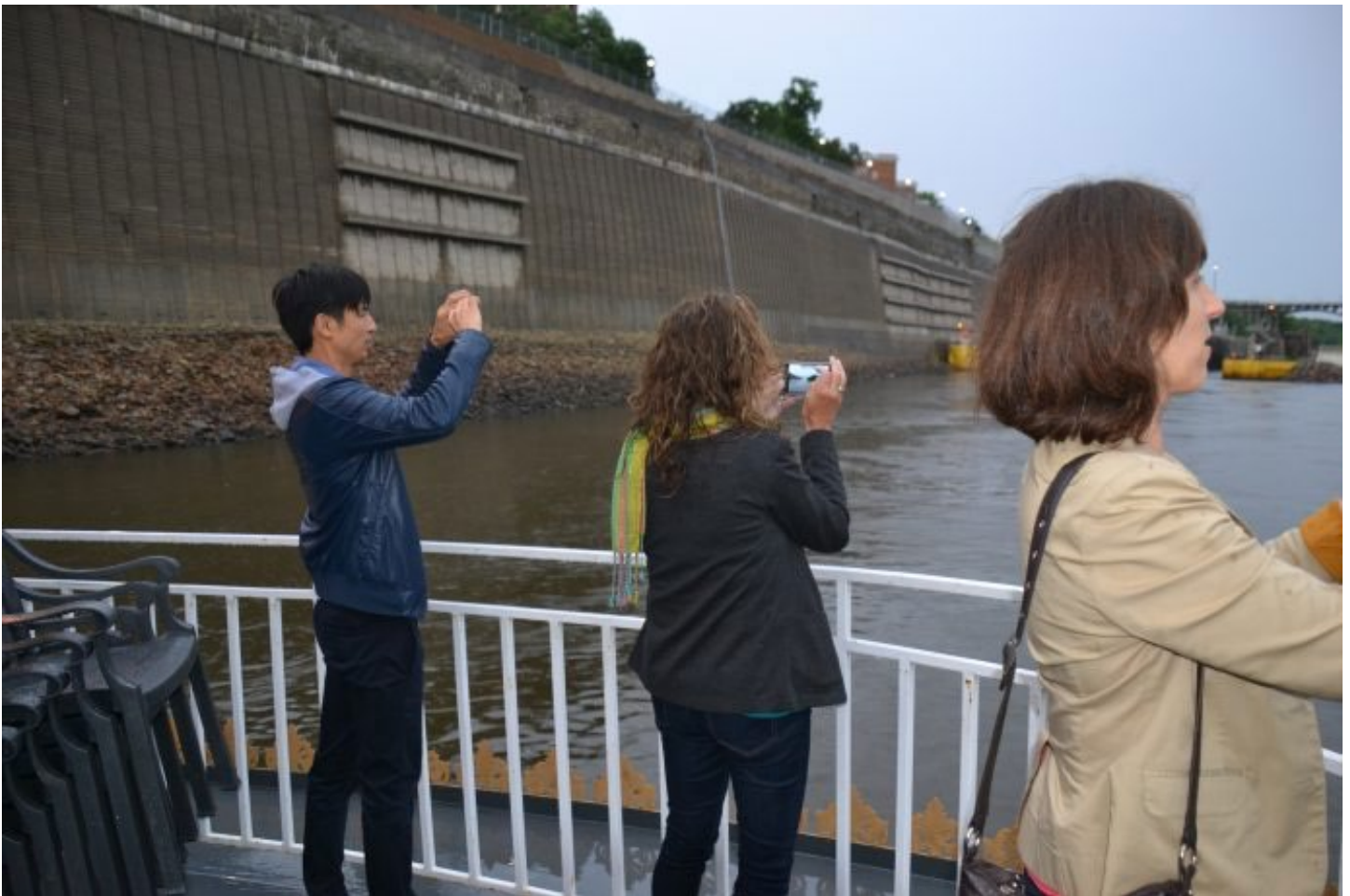
Participants of the Grasping Water Institute on the Mississippi River.

Our international and interdisciplinary participants took part in roundtables, joined a workshop on river science for humanists, received introductory training in GIS and cartography methods, explored digital scholarship and online resources for curriculum development and support, viewed an art exhibit, and boated on the Mississippi River. We pre-circulated readings and involved environmental scientists, filmmakers, and geographic information scientists as well as humanists so that the Institute was a learning experience for everyone. The articles and columns in this issue of Open Rivers reflect the types and breadth of the work we did together in the summer of 2016, and we are pleased to be able to share it here.