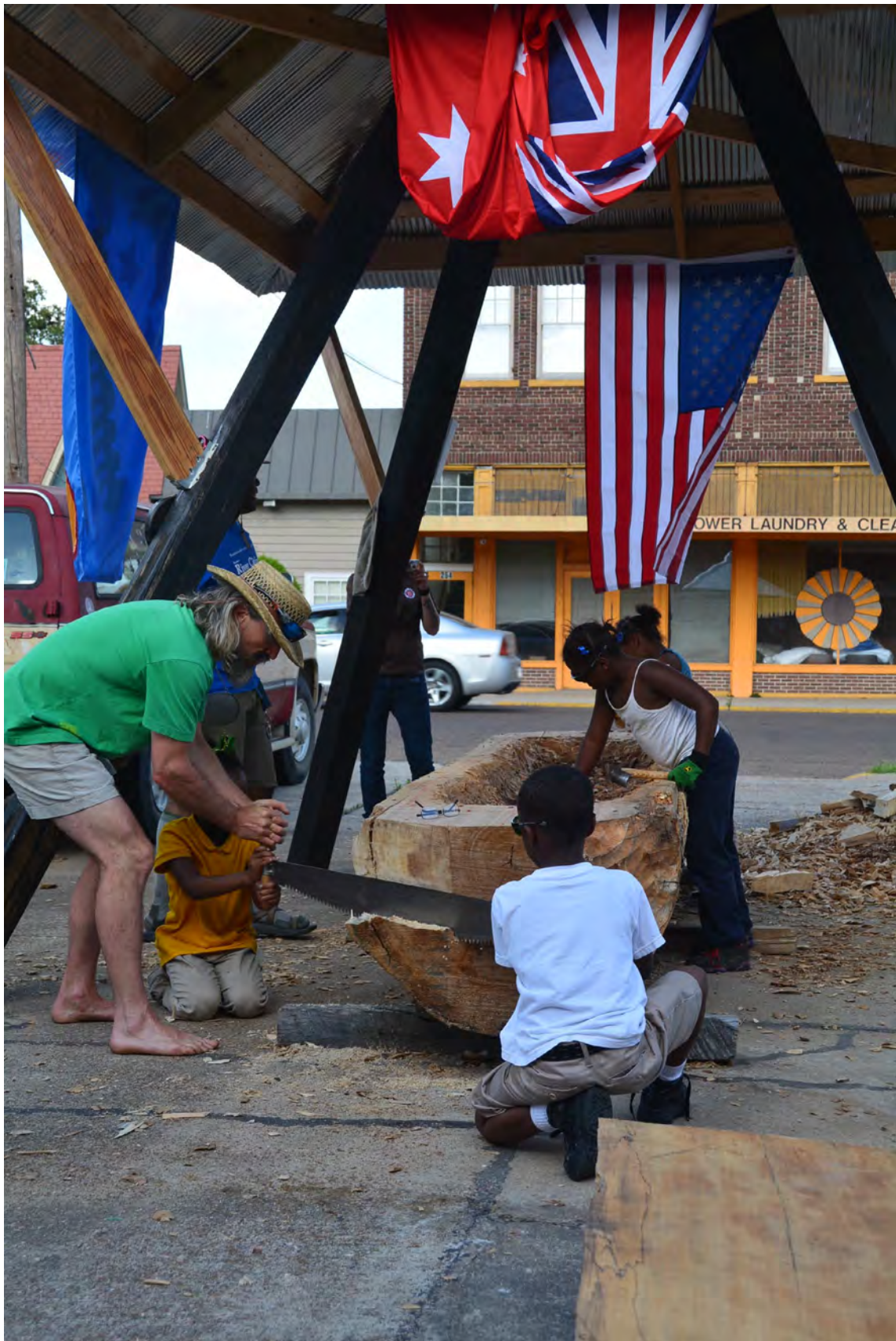
Carving a voyageur canoe.