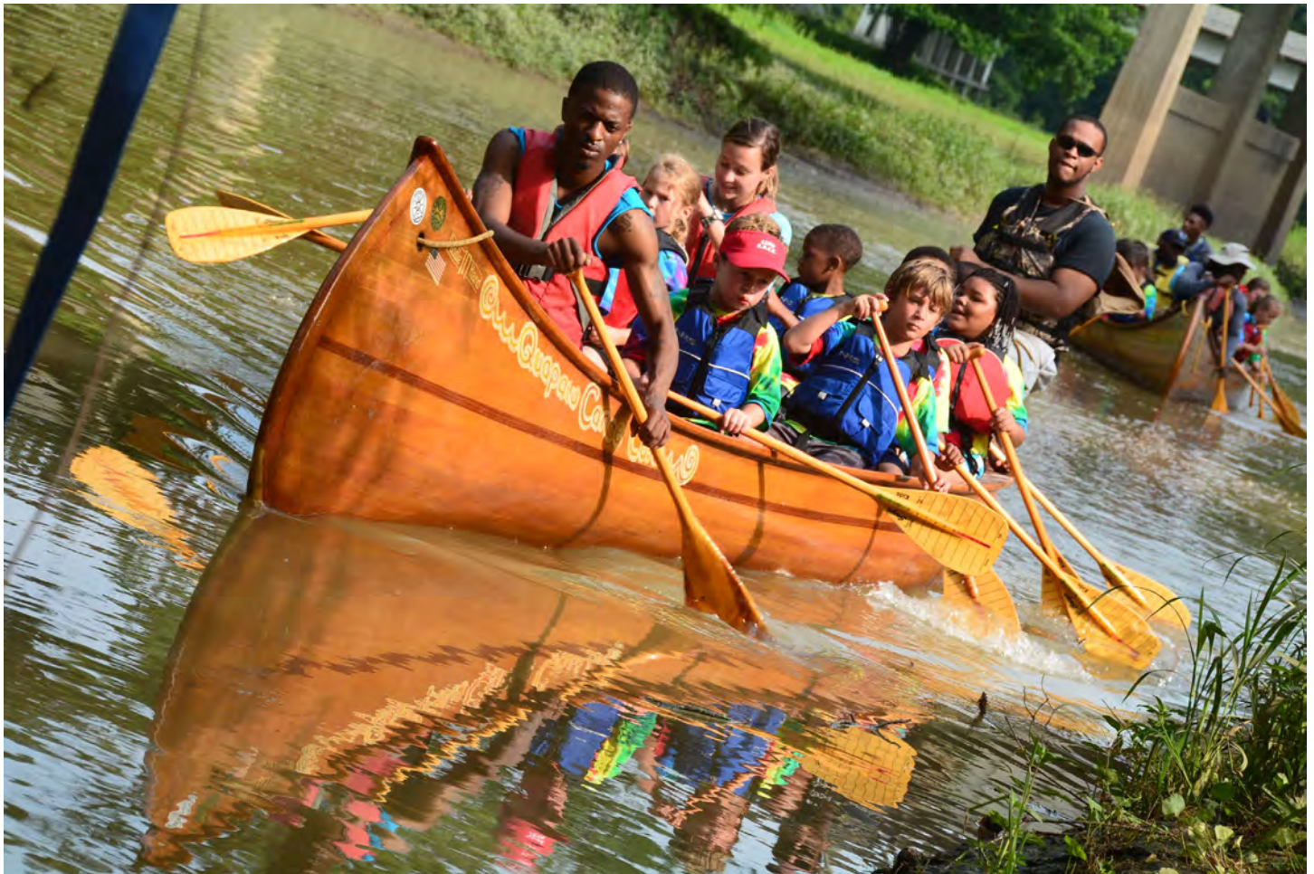
Bringing children to the river

share the knowledge and skills that will allow the public to enjoy these trails—ensuring Southerners feel comfortable swimming, paddling, and interacting with wild nature in sustainable ways. Thirty years from now, we envision a Lower Mississippi Valley where residents of all races and economic means view themselves and their children as integral inhabitants in a complex ecosystem. Children must be raised to understand, respect, and take responsibility for the wild floodplain through continual engagement and lifelong stewardship.