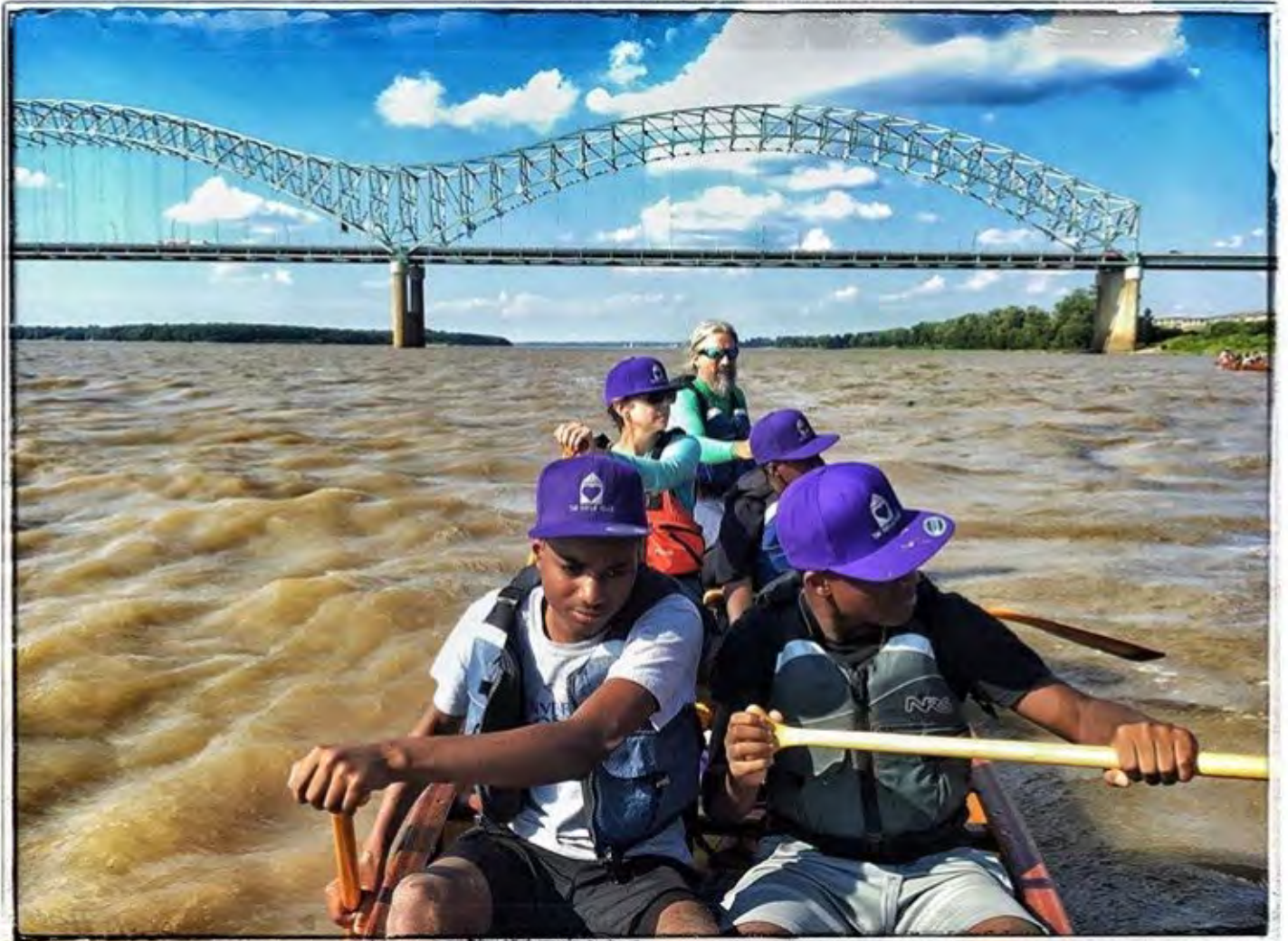
Reconnecting to the river.

In 30 years we envision a Lower Mississippi Valley where residents commonly recreate on their big river in canoes and kayaks and paddleboards. All children living in the Mississippi Valley will have some first-hand experience with the river and its wild beauty. Parents will respect the river, not fear it. They will know what the challenges are, and what skills, knowledge, and equipment are necessary to safely enjoy it from human-powered vessels. Canoes, we envision, will be as common as towboats, kayaks as