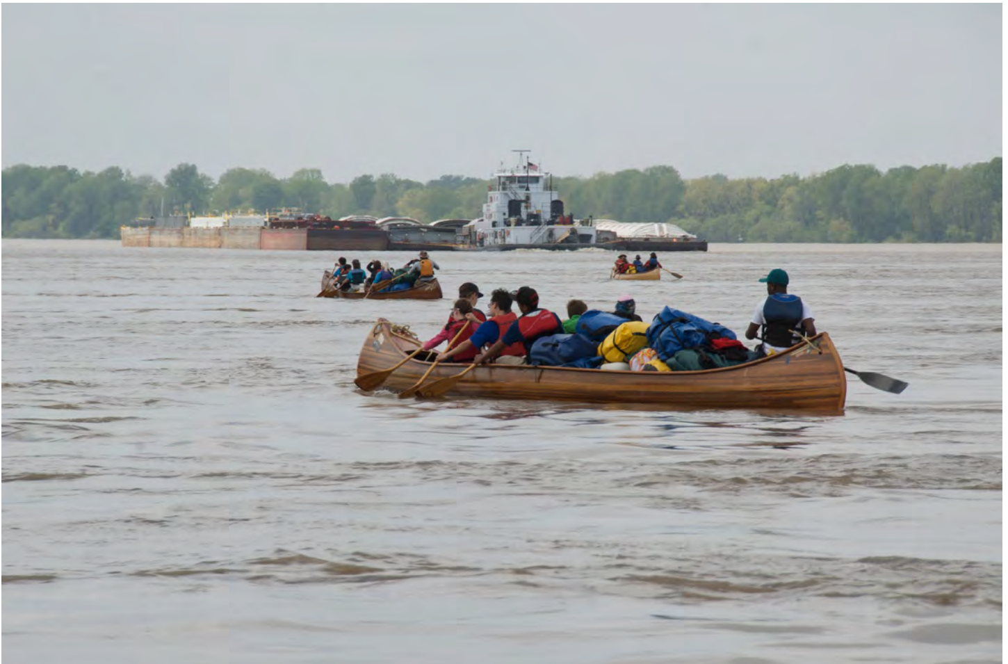
Sharing the waters.

As habitat disappears, industry seems to multiply. The "Chemical Corridor," from Baton Rouge to New Orleans, is home to a quarter of the nation's bulk commodity chemical production. Meanwhile, upstream development in the floodplain is so rampant that flood damage is spiraling out of control. As of October 2017, there were a record 16 "natural disasters" during the year that caused a billion dollars in damage; included in