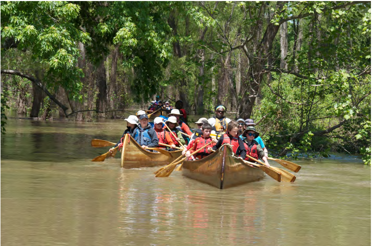
On the river.

Our mission is to recognize, protect, and promote the Lower Mississippi River as a viable wilderness. This serves the river itself, as it will preserve its ecological health, and it serves future generations, who will be able to enjoy an iconic American wilderness experience—that is, if we don't let it be washed away.