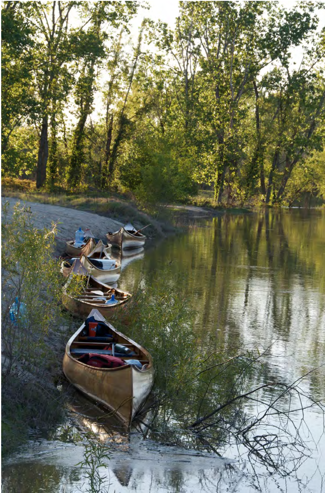
Getting people on the river.