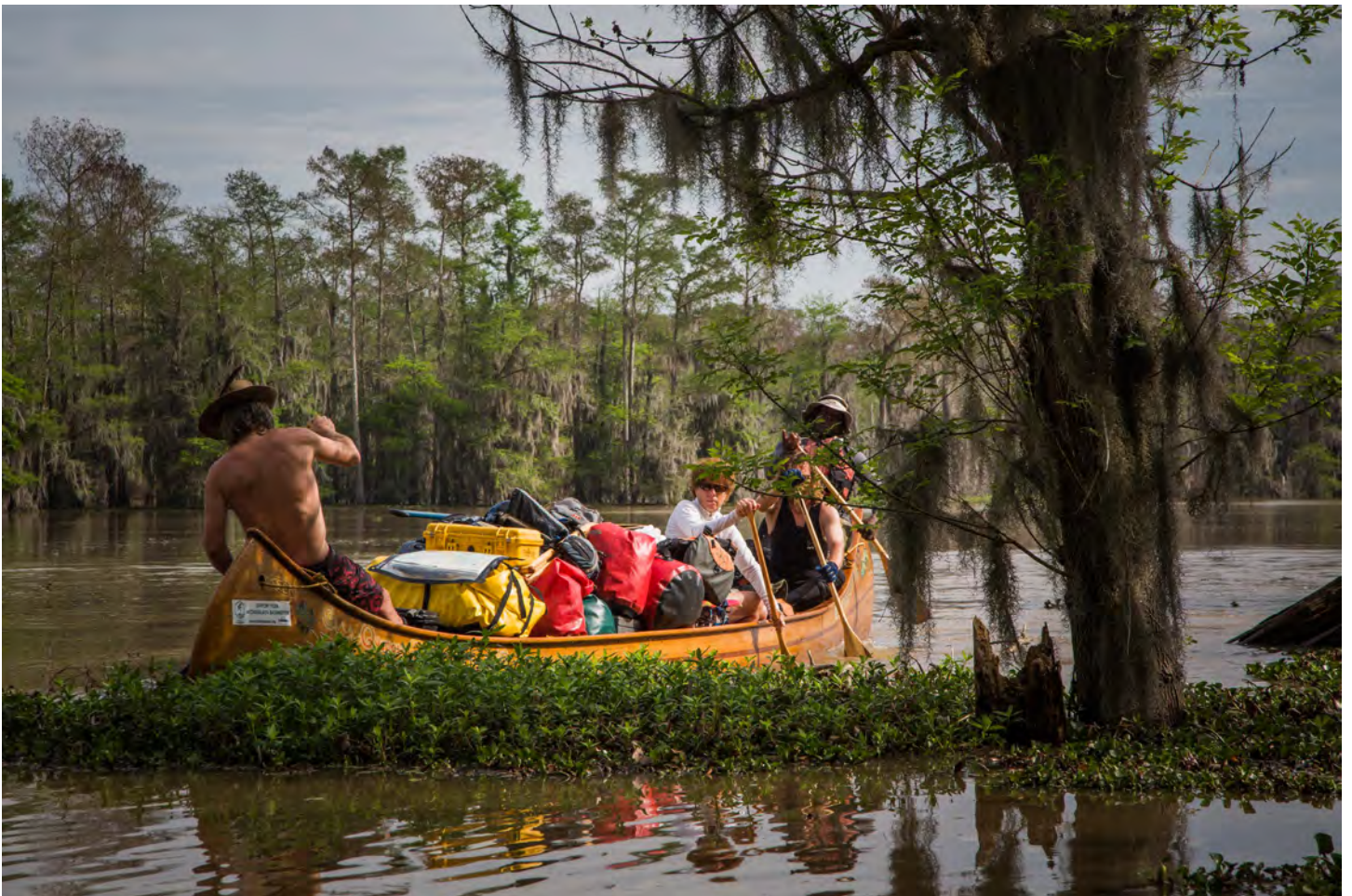
Fully loaded on the Atchafalaya River from the Atchafalaya Rivergator Expedition of 2015.

a promise I've kept, again and again. It's a promise I'd like to see others make, too, which is why I started the Lower Mississippi River Foundation.