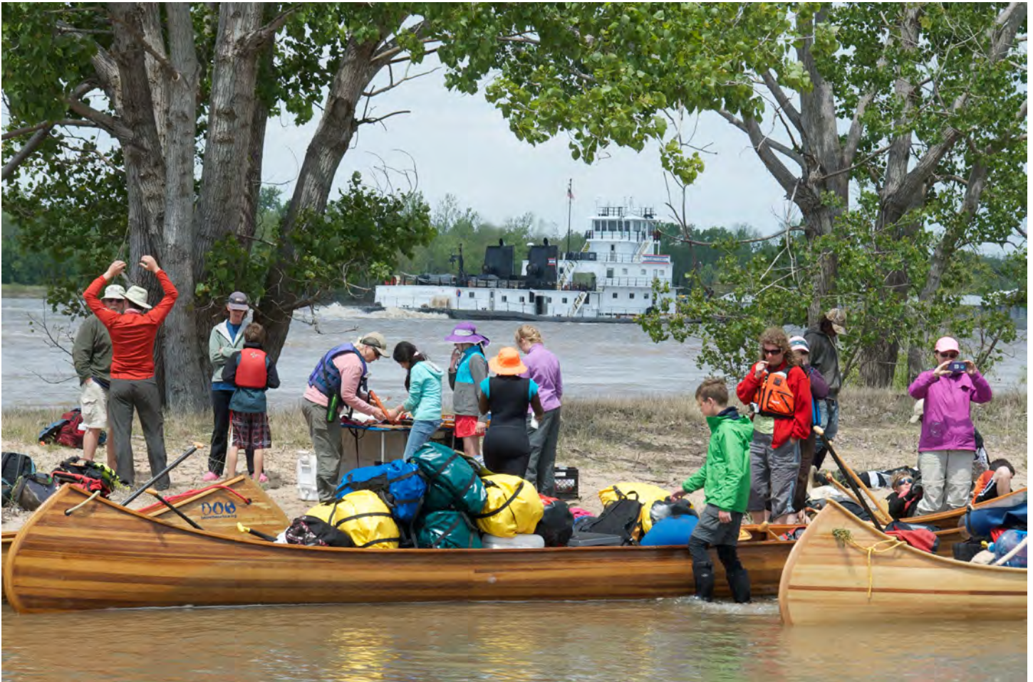
Sharing the river.

And the best way to care for the river is to know it. Yes, there are places, especially in Southern Louisiana, where a paddler should use caution—where the barge traffic is thick, and the pollution is real enough to make you sick. But on the whole, the Lower Mississippi River is still surprisingly intact—which means we still have a chance to give it the care it needs.