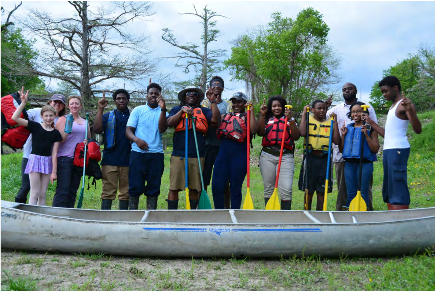
Bringing people together.

I also found that by bringing the right people to the river, I could help keep this land public. Buck Island, a large island easily accessible from the paddler-friendly harbor in Helena, Arkansas, was purchased by the American Land Conservancy (ALC) in 2005, with hopes of turning it over to