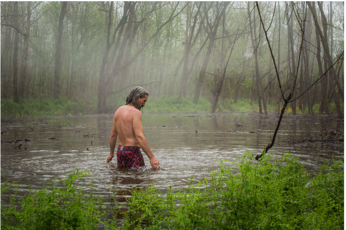
Contemplating the wetlands. From the Atchafalaya Rivergator Expedition of 2015.

I could hear engines and gunfire, smell exhaust and even sewage. But the human presence was as far away from me as the other side of the moon. I felt alone, and yet not alone. I felt that the river was mine, and that I was a part of the river, which is far bigger than me or my comprehension. The water flowed on, down towards my home in Mississippi, creating a meandering piece of paradise within the destruction of humankind.