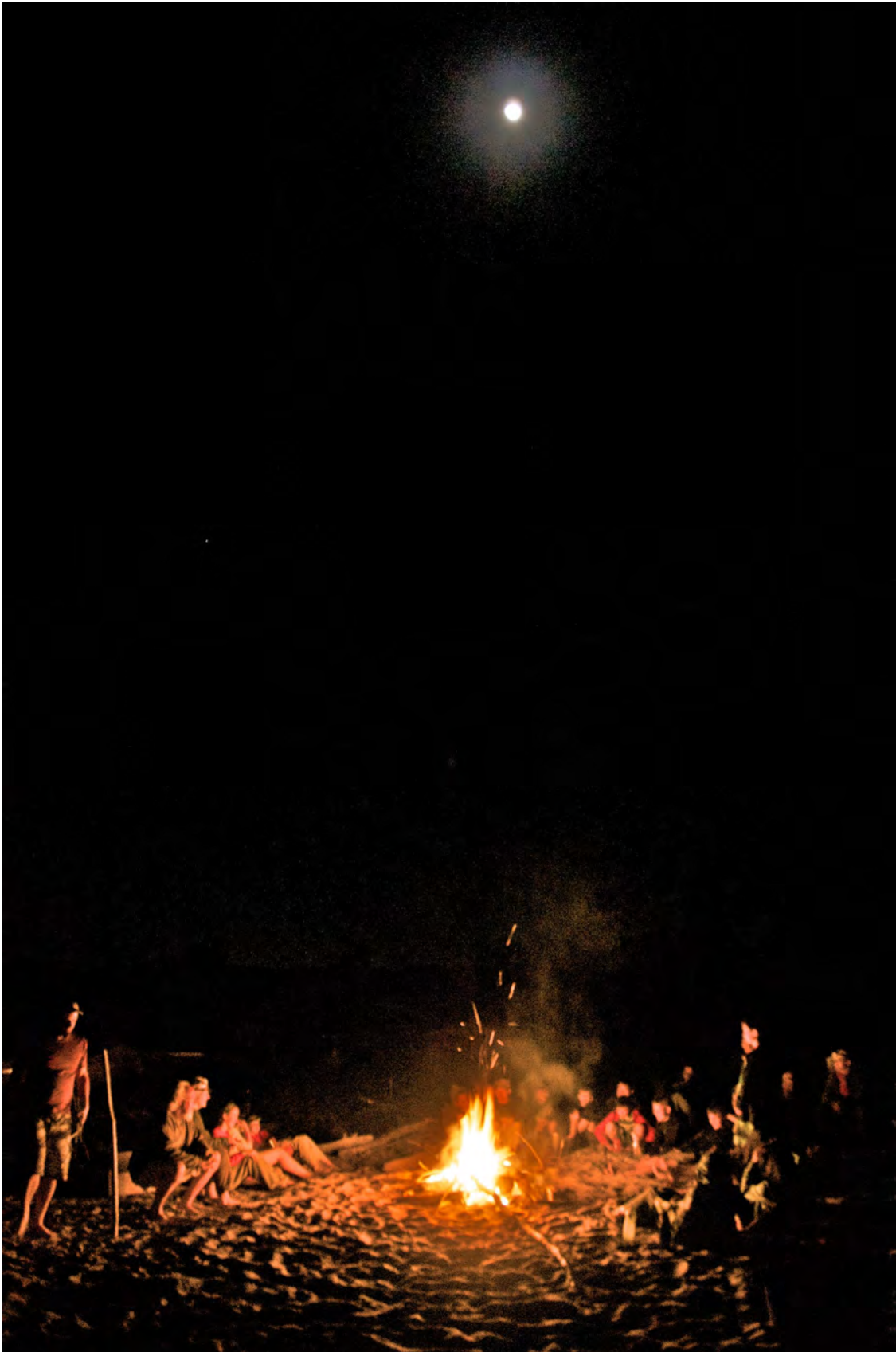
Learning on the river takes many forms.