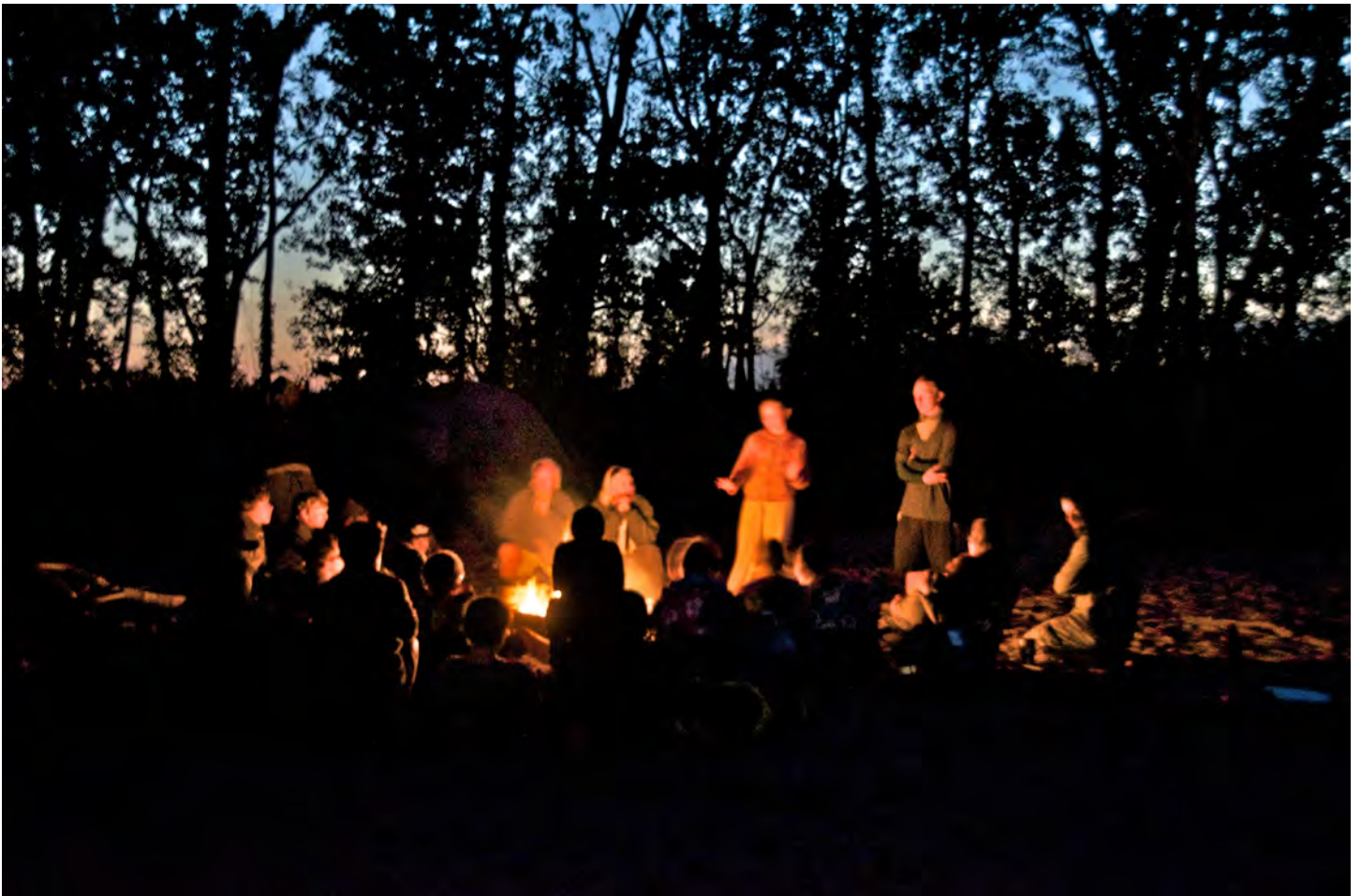
Wilderness at the doorstep.

could conceivably walk or swim through deep woods and wetlands from Baton Rouge to the city limits of St. Louis without having to cross a paved road (with one bottleneck at Natchez). All highways in this stretch travel over tall viaducts, and only a few dirt roads are found over the levee. The river creates a superhighway for wildlife of all sorts. Hundreds of species of songbirds migrate through the continent's heart each year. The lower river is home to 109 of the 140 bird species resident on the Mississippi; tens of thousands of snow geese stop here on their way to Alaska and Canada, far above the Arctic Circle. There have been no known extinctions of fish species. The