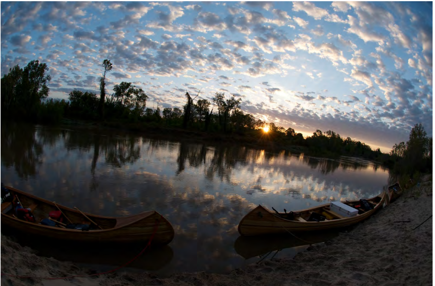
Sunrise over the river.

Perhaps the most famous consequence of that fact is the hypoxic dead zone that spreads at the river’s mouth. Farmers across the country are spraying nitrogen and phosphorous on their fields to fuel the growth of their crop—and the fertilizer from over 40 percent of the nation, from Montana to New York, is washing down the Mississippi River. In the Gulf of Mexico, those fertilizers come together to form a great feast for