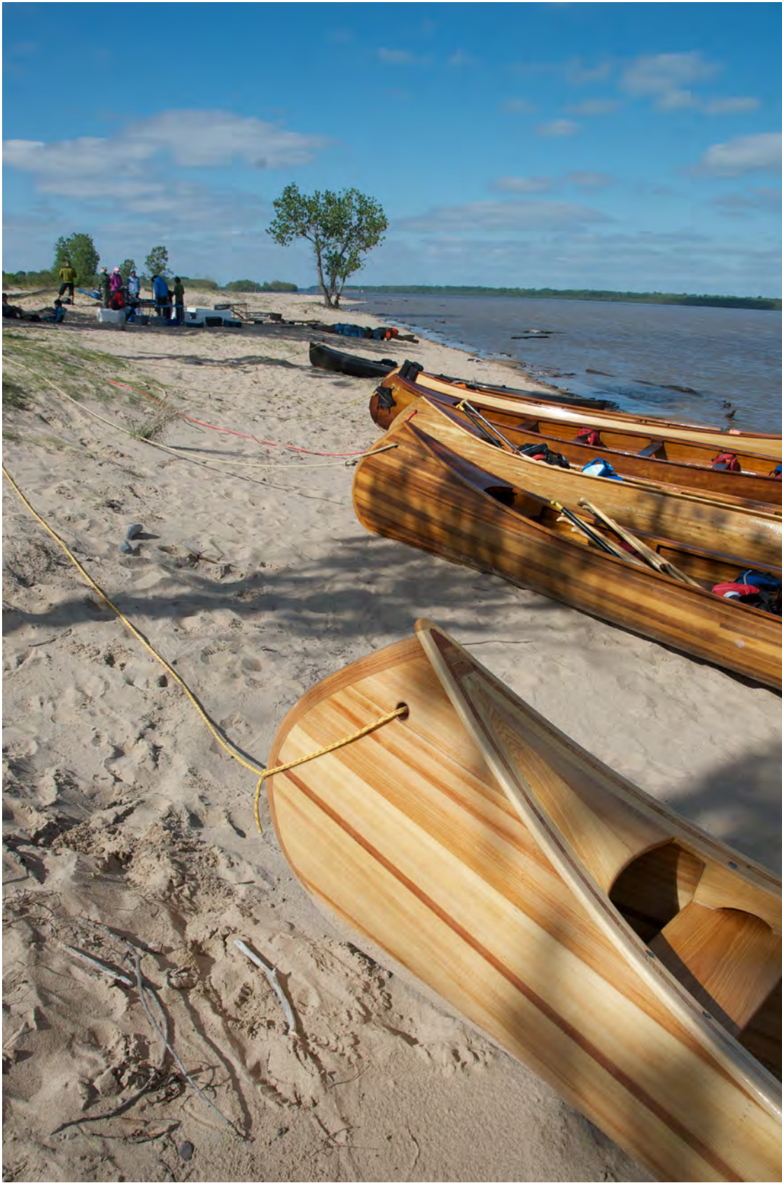
Public spaces on the river are critical.