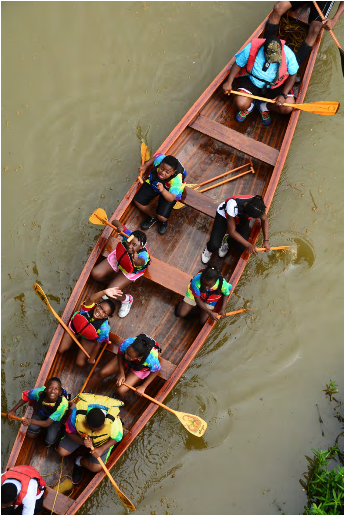
Getting outside on the river.