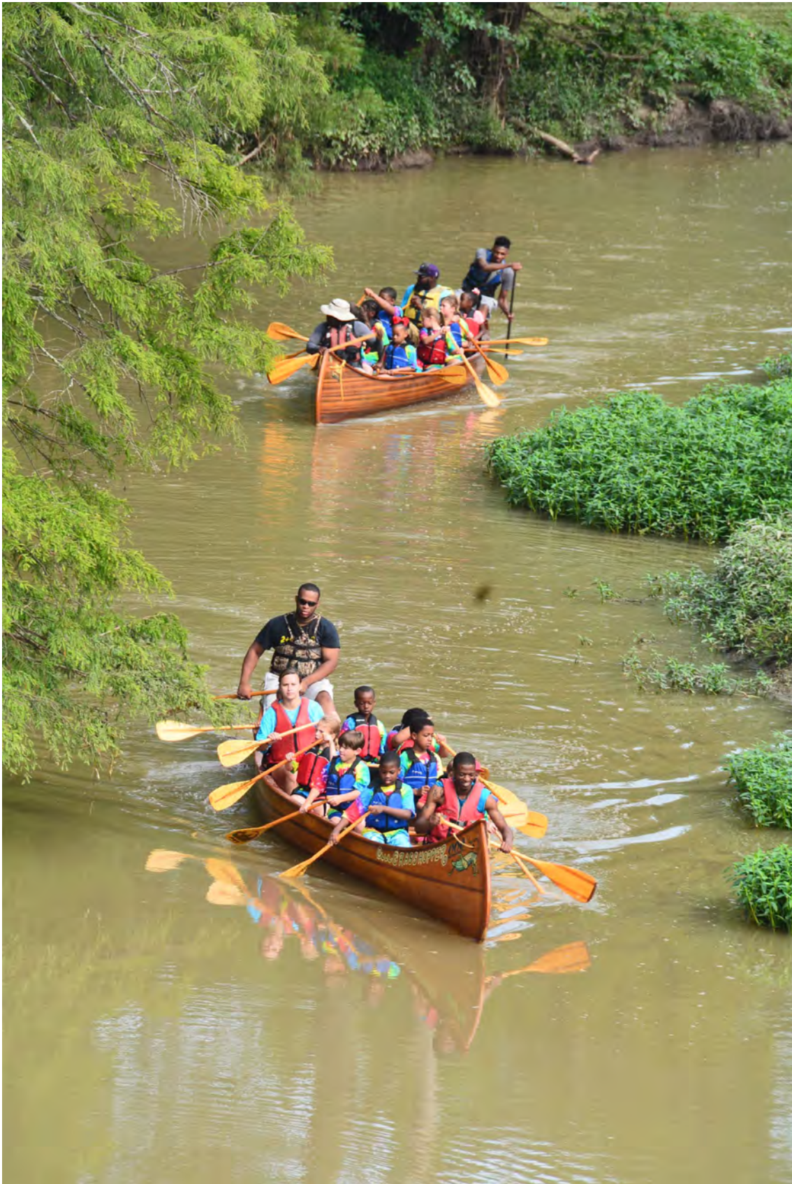
The long landscape of the river.