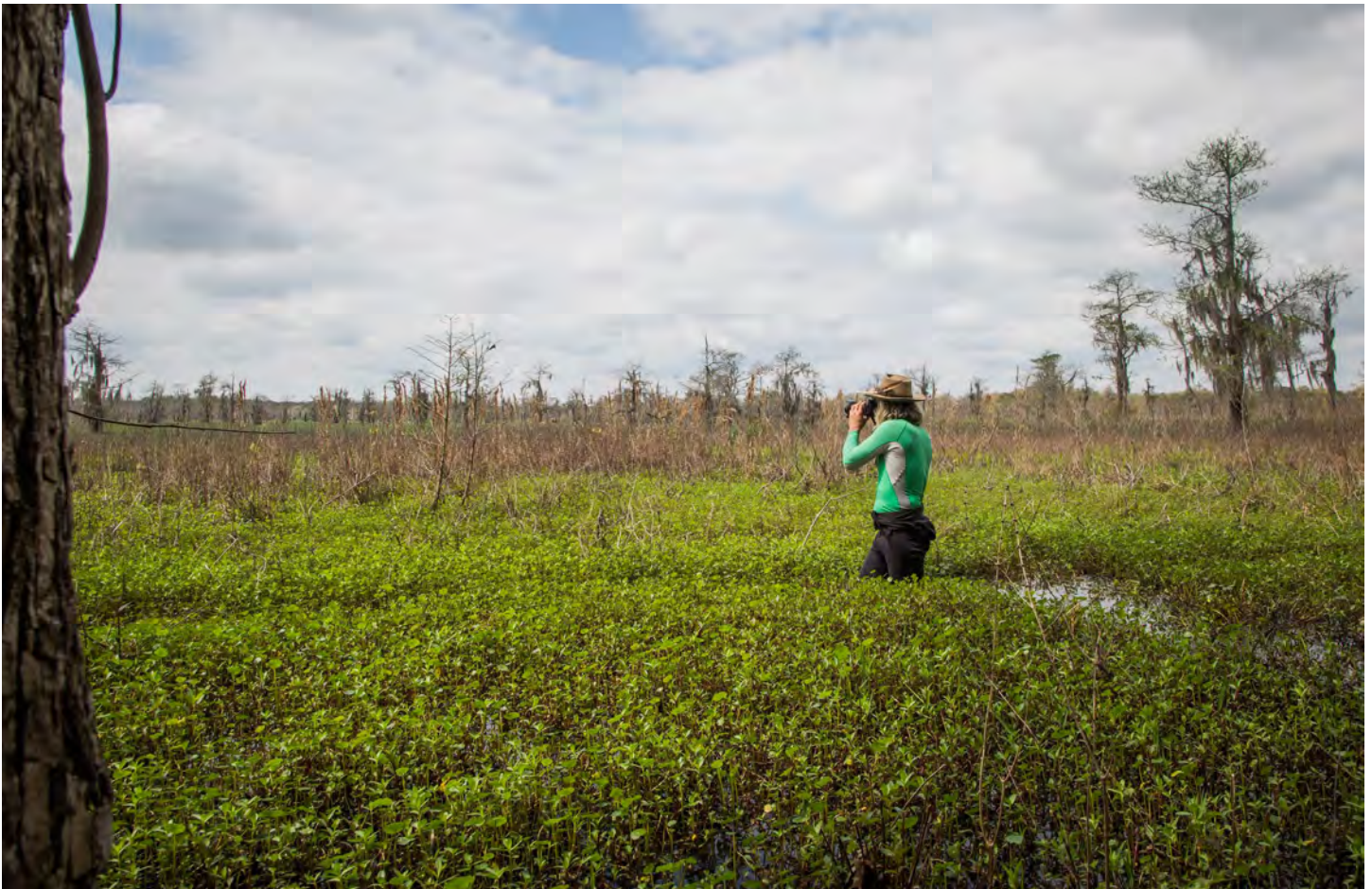
Documenting sedimentation at the Atchafalaya River Delta. From the Atchafalaya Rivergator Expedition of 2015.