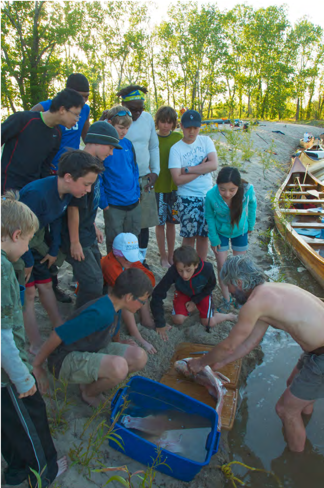
In the river, not just on it.