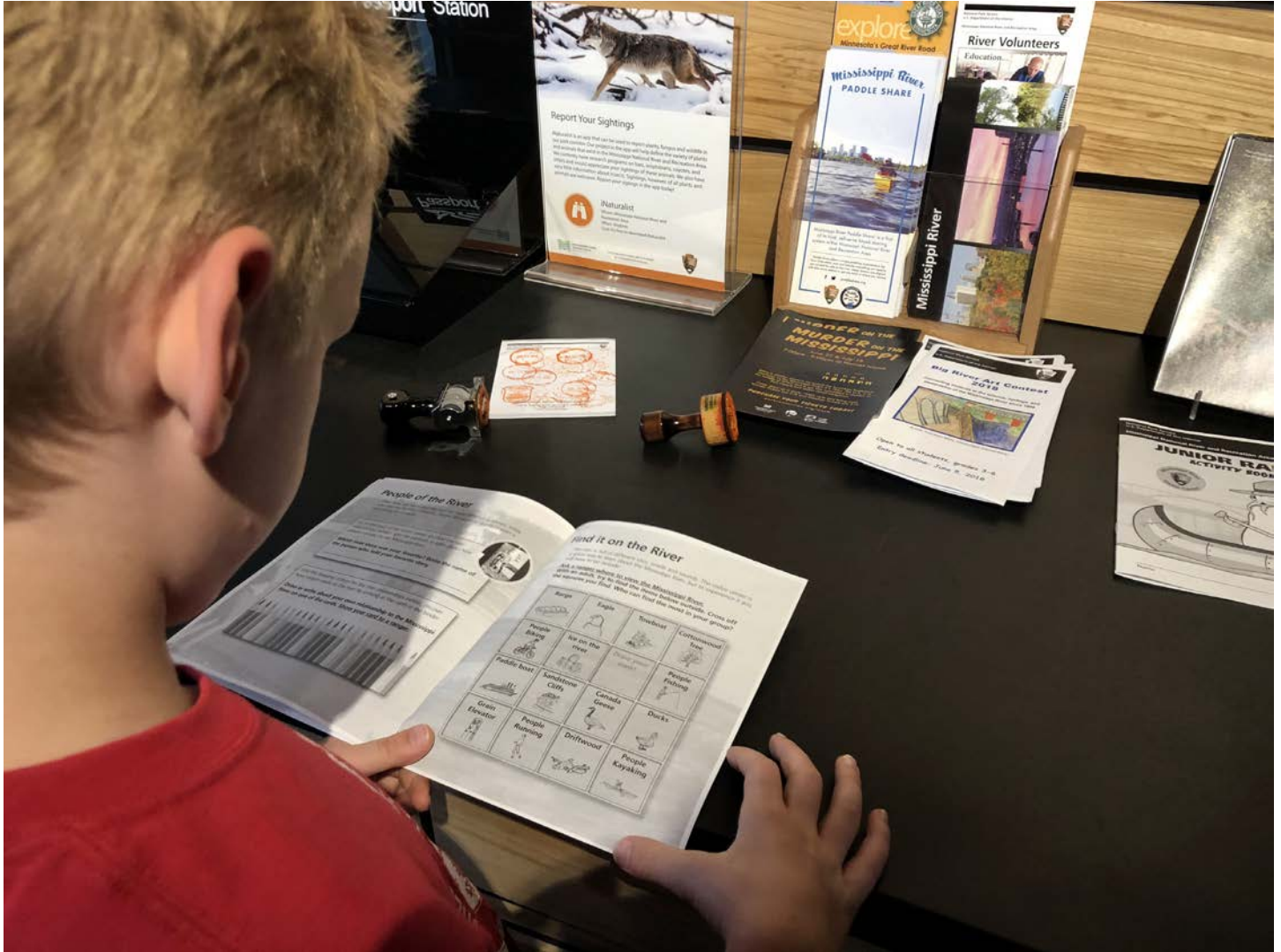
He said it looked like fun for later.