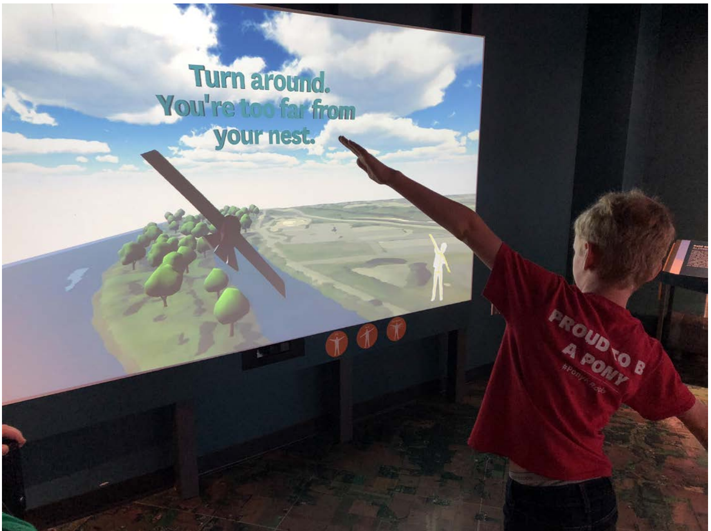
The prompts to return were a sign of success, he'd flown far enough to reach the edge.