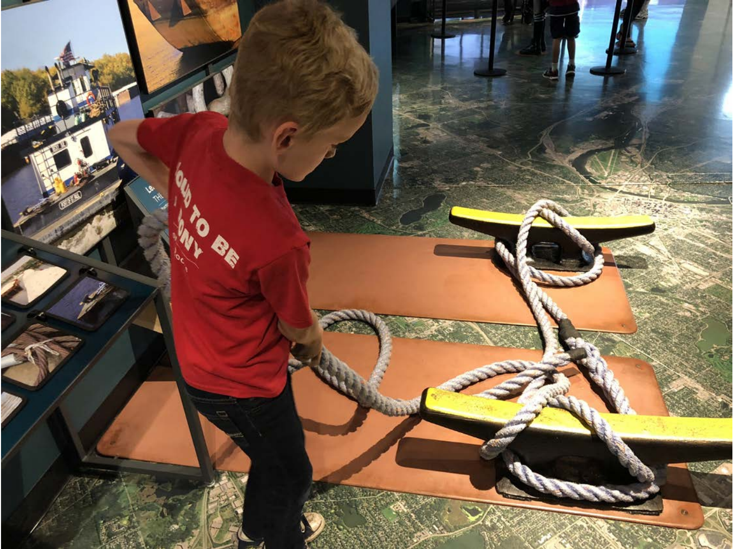
Tying knots is tricky.