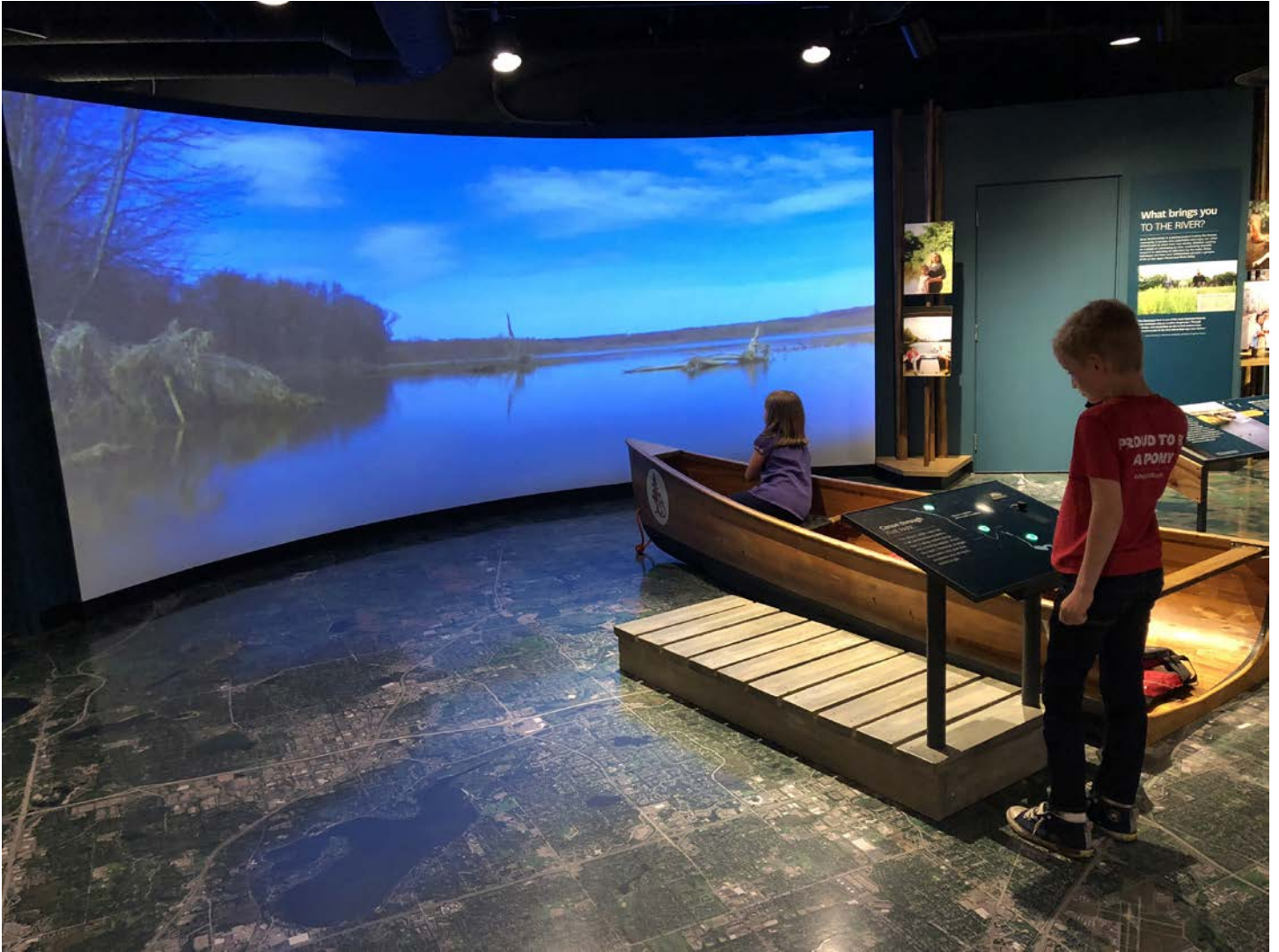
Shy about sharing the canoe, he enjoyed the presentation.