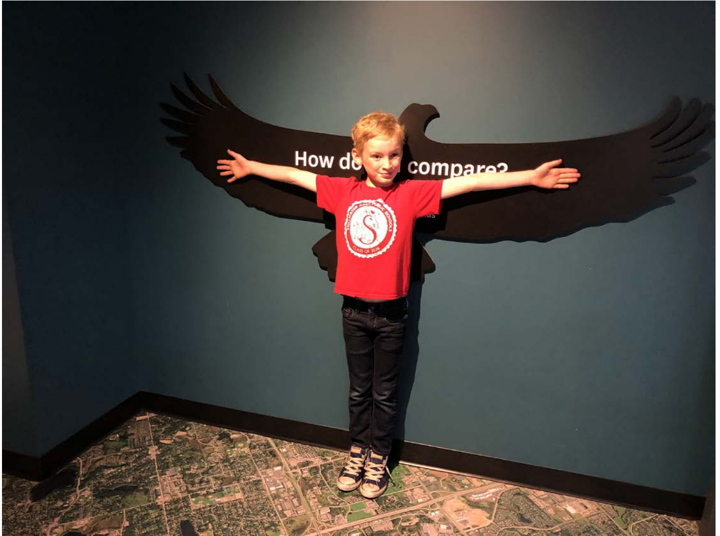
Still some growing left to do to catch up to an eagle's wingspan.