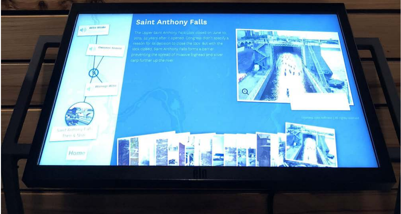
The digital kiosk was excellent, nice detail but not overwhelming.