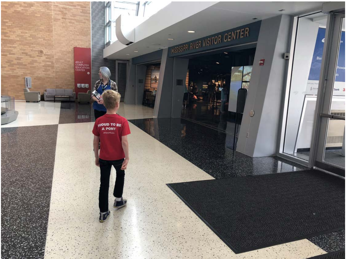
Approaching the visitor center through the SMM lobby.

St. Paul. MNRRA is an open secret in the Twin Cities, and it is not widely known as a national park, even by people who live and work within its borders.