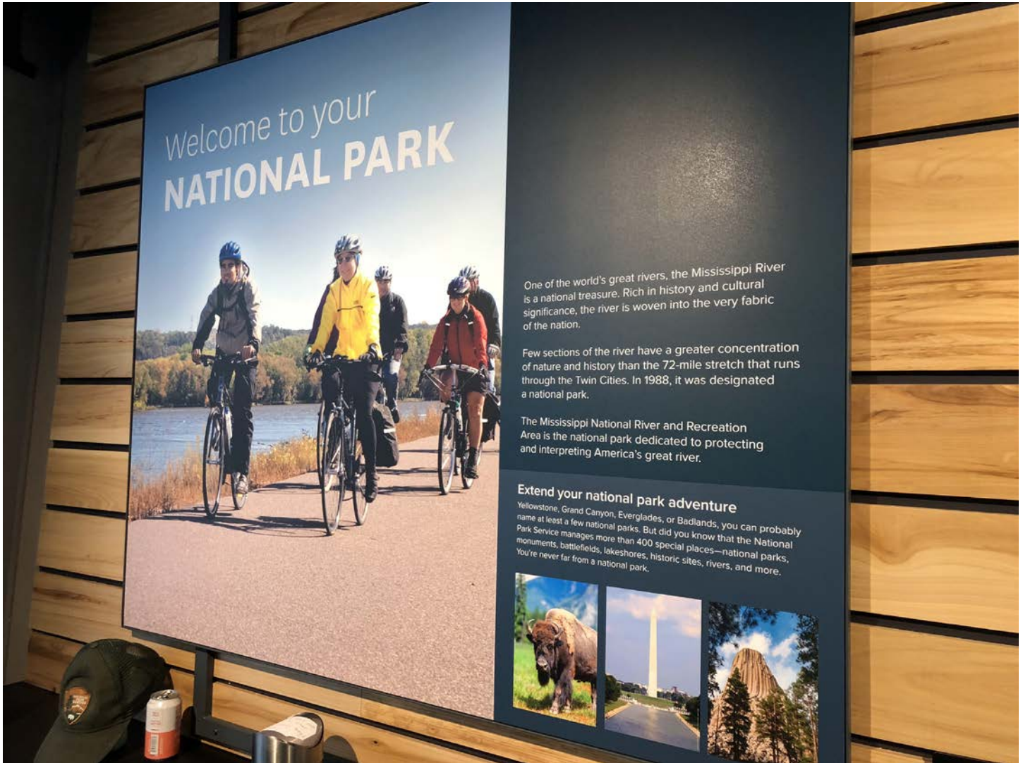
One of my favorite signs offers a wonderful summary of the park and why it is significant.