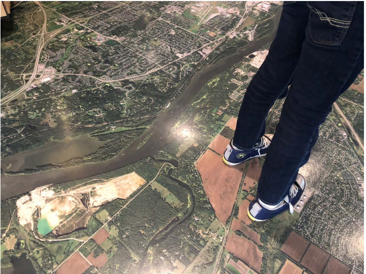
Impressive details, if you look down.

As I write this three weeks later, the eight year-old honest witness does not remember that the river is part of a park, or that this is unusual and special. He remembers the "best video game I ever played."