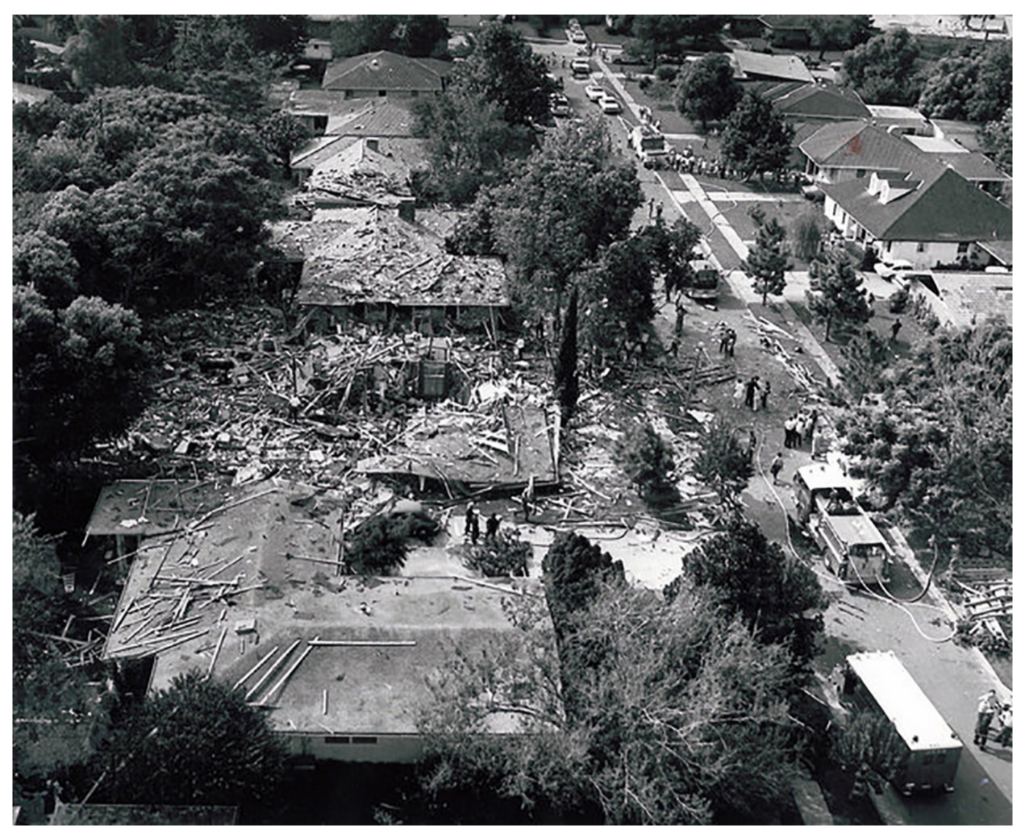
Early one September morning in 1975, in a quiet Metairie subdivision west of Transcontinental Drive, a ranch house suddenly exploded in a fireball so powerful it damaged 20 neighboring buildings and broke windows a mile away. The house plus four adjacent homes were reduced to rubble, and 11 people were seriously injured.