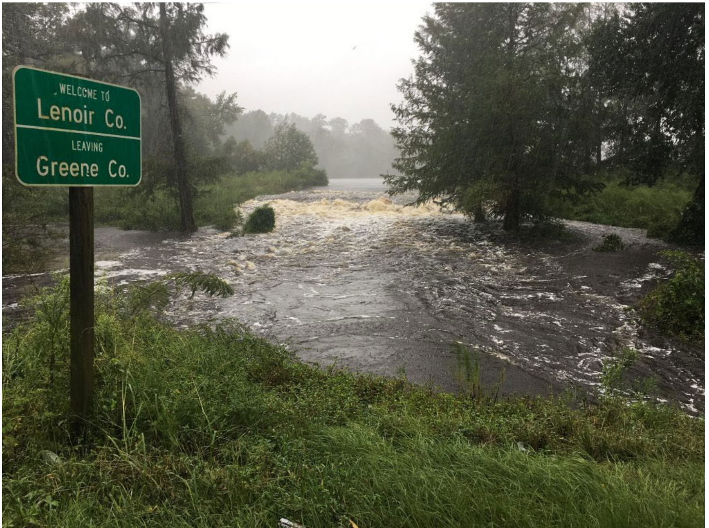
Flooding in Kinston, North Carolina during Tropical Storm Florence, September 14, 2018.