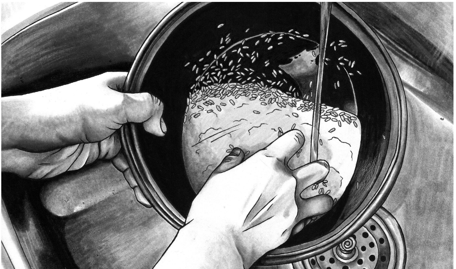
Detail from “Washing Rice,” 2018.

First, I am constantly overwhelmed by the work of two environmental justice and water-related projects in what is called Louisiana: Another Gulf is Possible , whose name is also their platform, and the L'eau Est La Vie Camp , which continues to mobilize against the southernmost end of the Dakota Access Pipeline in Chata Houma Chittimacha Atakapaw territory.