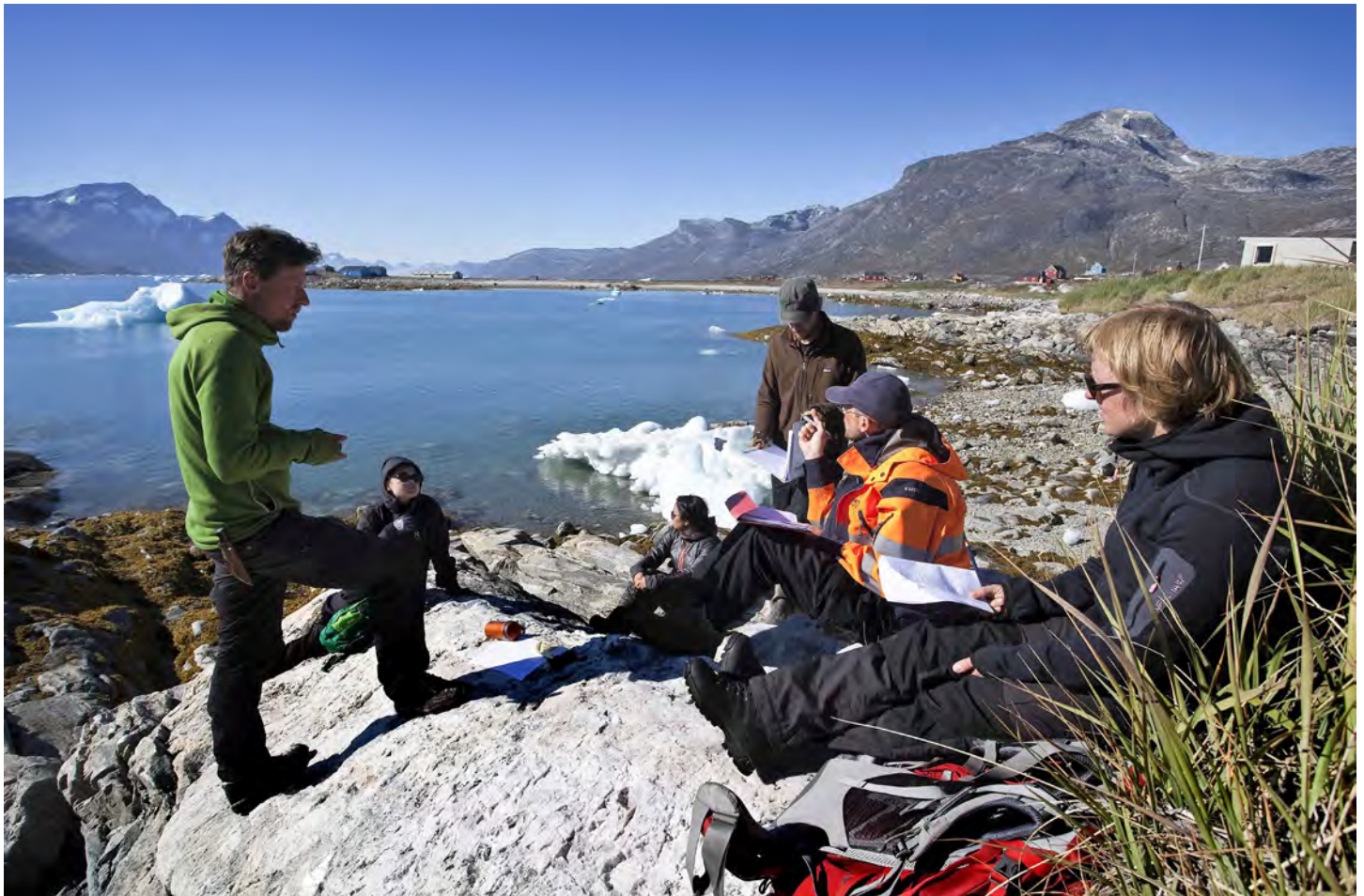
Researchers from REMAINS team are discussing how to evaluate the archaeological state of preservation, the preservation conditions, and asset value of organic deposits. The work of the project has led to the development of a standardized field protocol for site description and risk assessment.

One study is assessing current preservation conditions and processes in a kitchen midden in