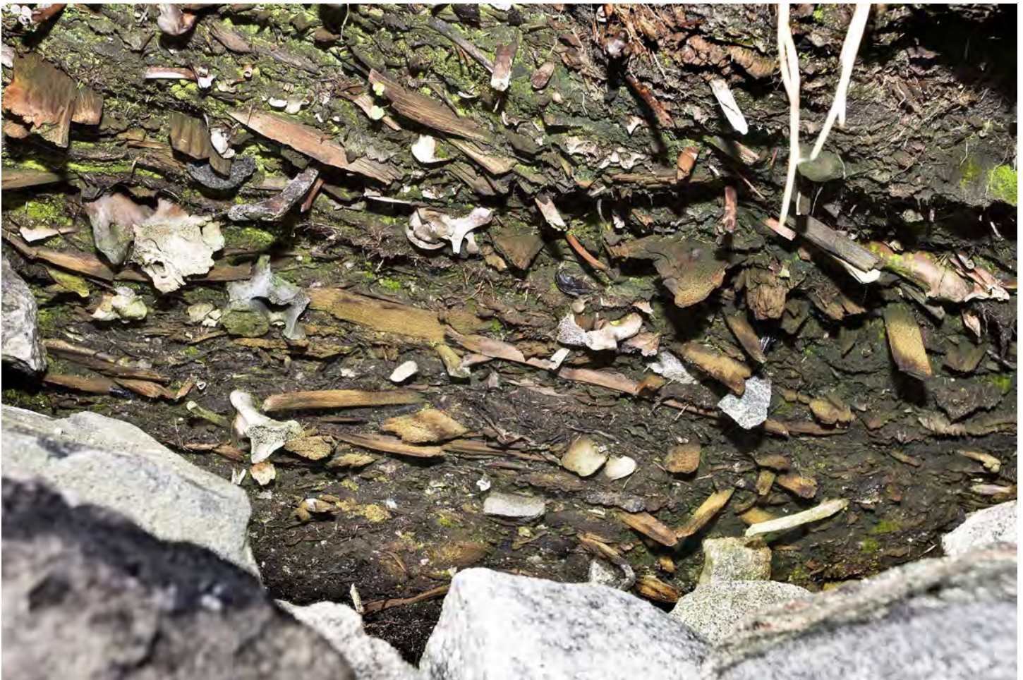
Archaeological middens in Greenland often contain large amounts of very well-preserved organic materials. The midden at Kangeq is no exception; here large amounts of wood and bone have survived for centuries.

The next wave of settlers was the Thule, who eventually became the modern Inuit Greenlanders. Their attention to seasonal rhythms along the coasts and fjords of Greenland is echoed in the remains of Kangeq. There is much to learn from these ancient cultures, especially with the new tools of analysis available to researchers, but the evidence is disappearing faster than it can be gathered.