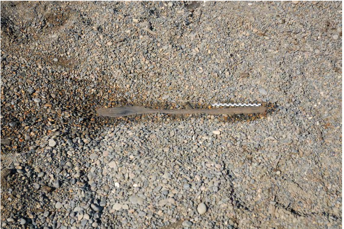
Ipiutak paddle in situ at Nuvuk.

For more on Walkapa and Nuvuk, visit https://iceandtime.net/ . See also https://www.youtube.com/watch?v=hh_KEQ-ayBI for excavation of a seventeenth-century village in Quinhagak, Alaska, which began eroding away in 2009. Referring to the imminent danger to organic materials normally seen only in museum collections, project director Rick Knecht described the situation as “like museums on fire, libraries.”