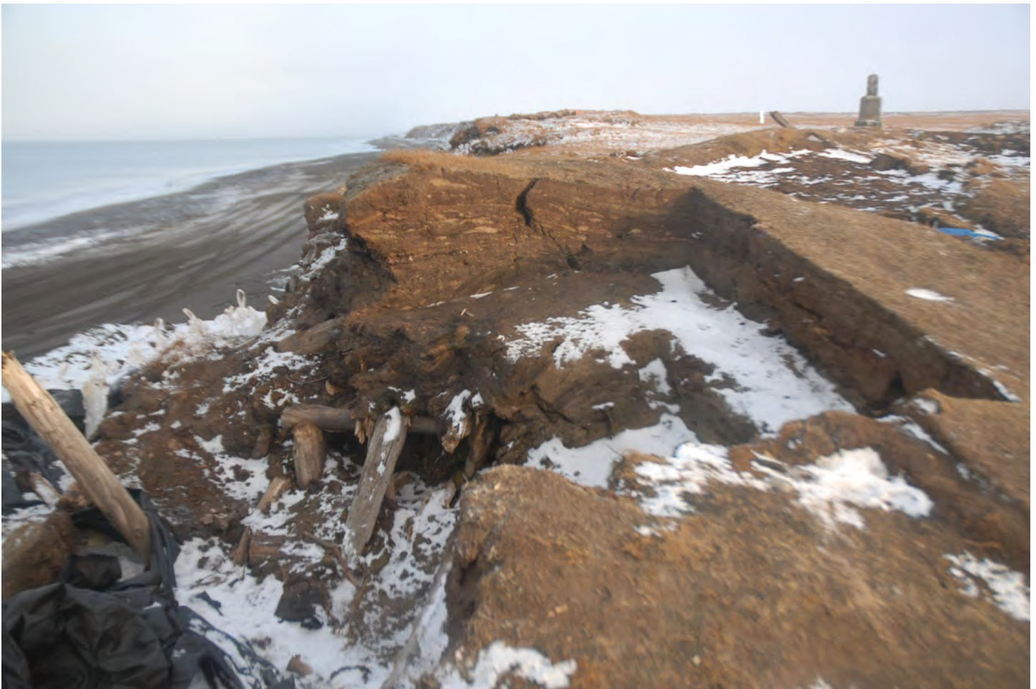
Ancient Walakpa wooden structure slumping into the sea.

What follows is a glimpse of the issues and opportunities currently facing archaeologists who work in the Arctic, using sites in Alaska, Greenland, and Labrador as proxies for the ancient stories in a region that is rapidly thawing and eroding away.