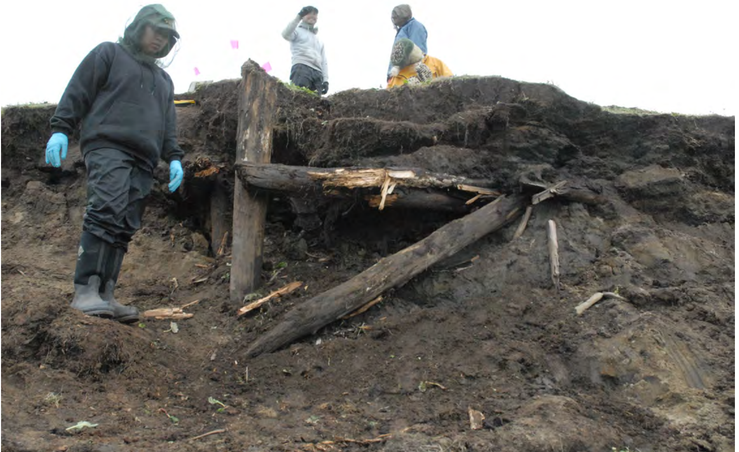
Walakpa house with overhang gone.

Until just a few years ago, this house (above) had stood literally frozen in time. It held not only millenia-old cultural data, but biological data, as well: basic zooarchaeological data, stable isotopes, ancient DNA [1] , cortico steroids, and trace