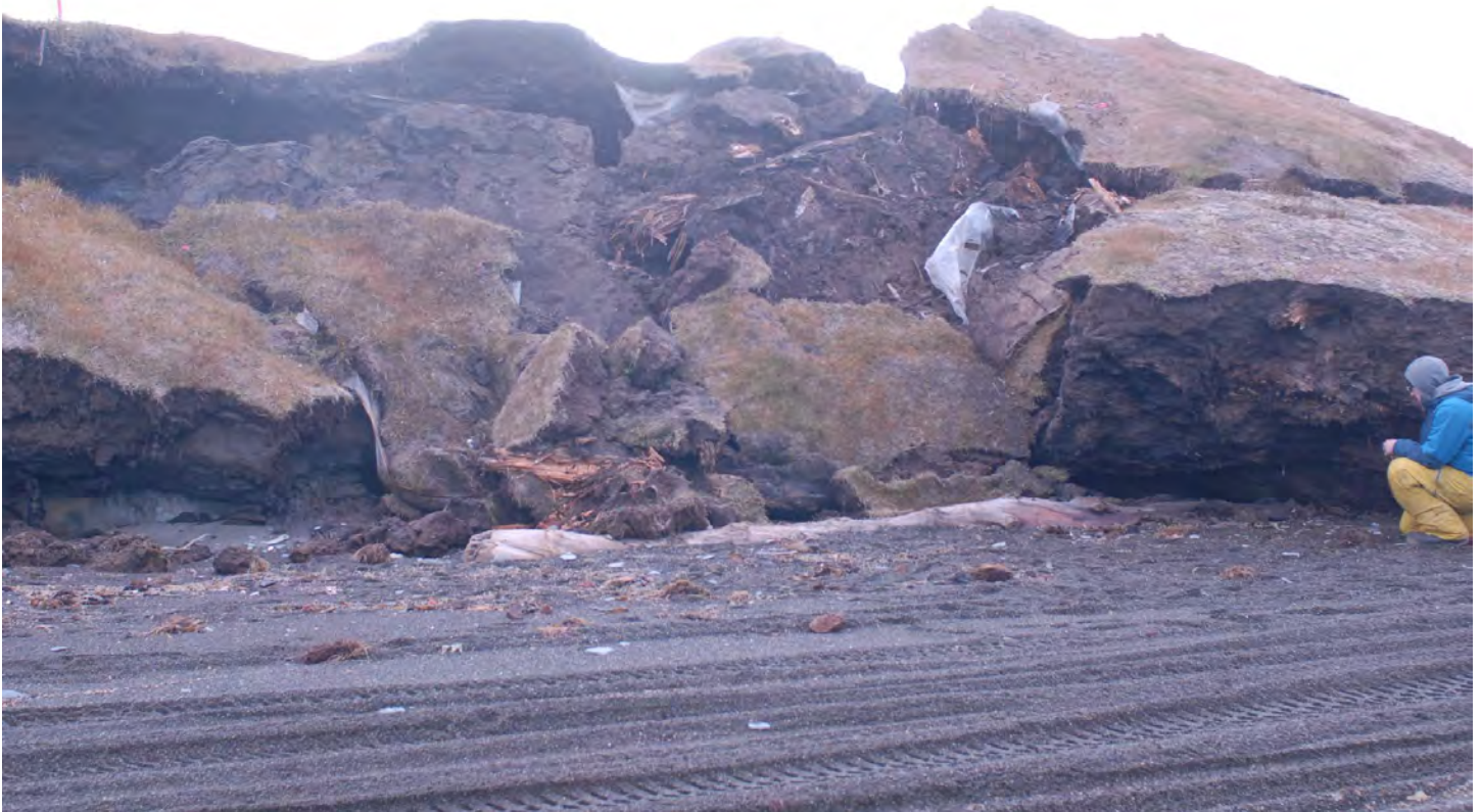
3000 years of cultural deposits all over the beach at Walakpa.

eroding coastal bluffs began exposing human remains and cultural materials several decades ago. This was a village site with a long history that had been relocated more than once due to erosion (Krus et al. 2019). Excavations showed that human occupation there had stretched back not decades but over a thousand years, predating when the Thule, or ancestral Inuit, lived there, making Nuvuk a key site for understanding the Thule migration across the North American Arctic to Greenland over the next several centuries (Jensen 2017; see also, Krus et al. 2019, Tackney and Raff 2019).[2]