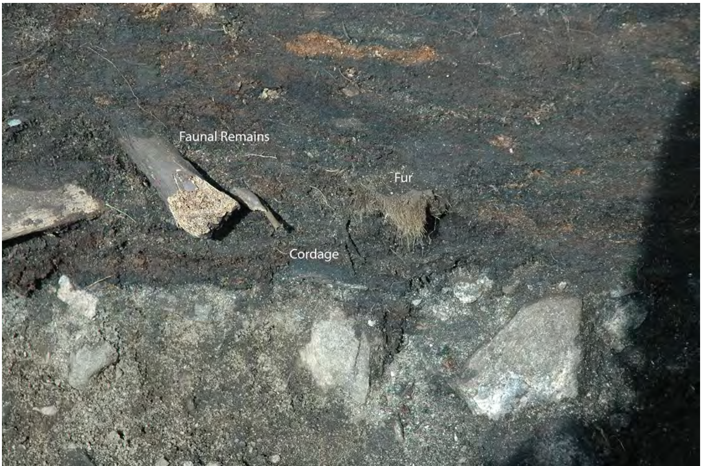
Profile of 2016 excavation unit in Avayalik 1, House 1. Lower portion of the cultural deposit visible in the north wall of 2N/8E shows faunal remains, a piece of cordage, and a piece of fur protruding from the wall. The light-colored deposit at the bottom of the photograph is sterile deposit.

Thus it was the growing concern about the effects of global warming on Avayalik-1 that sent researchers back to Avayalik Island. They carried out limited excavations at the site to collect wood and charcoal samples to establish a chronology, gather soil samples and faunal remains for archaeometric analysis (unknown in 1978), and assess the stability of Avayalik-1 and other sites in the area. They documented areas that were thawing and eroding. “The dried-out deposits on the edges of the terrace are actively