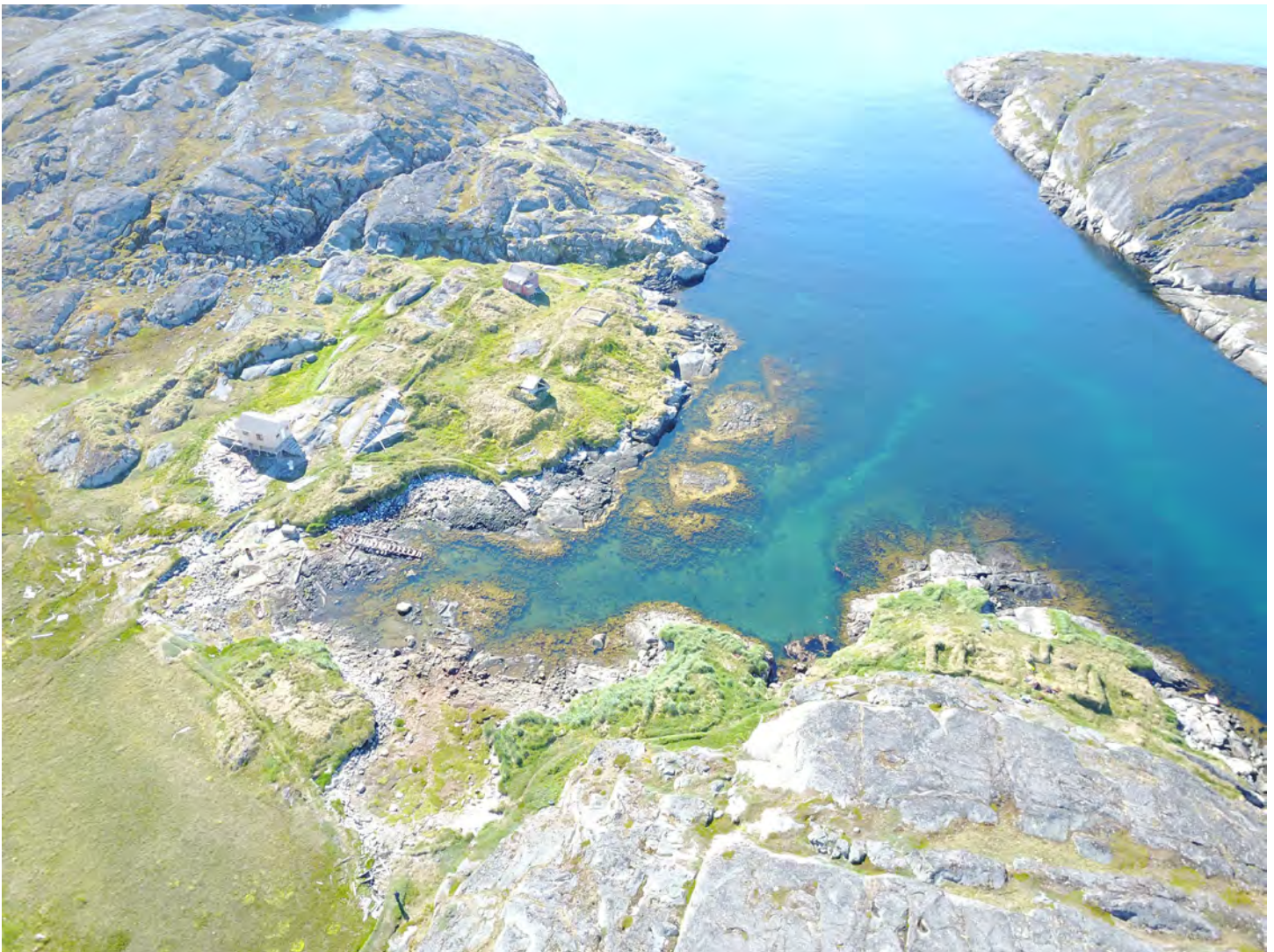
Remains of the village of Kangeq as seen from the air.

example, the Saqqaq peoples, who inhabited the area from approximately 2400 B.C. to 800/500 B.C., were part of a broad techno-cultural tradition (Arctic Small Tool tradition or ASTt) and genetically related to ancient populations that originated in the Western Arctic (Siberia/Alaska). Archaeologically, in addition to the Saqqaq, these ancient groups are represented in Greenland by the Independence I (ca. 2400–1300 B.C.) and Greenlandic Dorset (ca. 800 B.C.–A.D. 1) (Grønnow & Sørensen 2006).