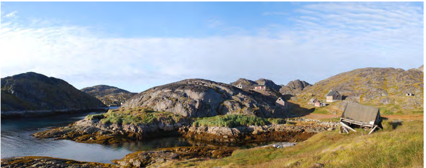
The settlement of Kangeq in Southwest Greenland was abandoned in the 1970s. The site had been occupied for thousands of years.

Boarded-up houses and an abandoned church still remain at Kangeq. A pool of sludge on the water's edge greets researchers coming to assess the site (see Harmsen 2017). Giant whale ribs, wood, glass, and rusting metal stick out of the pool; it is surrounded by a thick layer of compressed turf, which is actually a midden filled with the bones of what the residents of Kangeq were eating over the centuries.