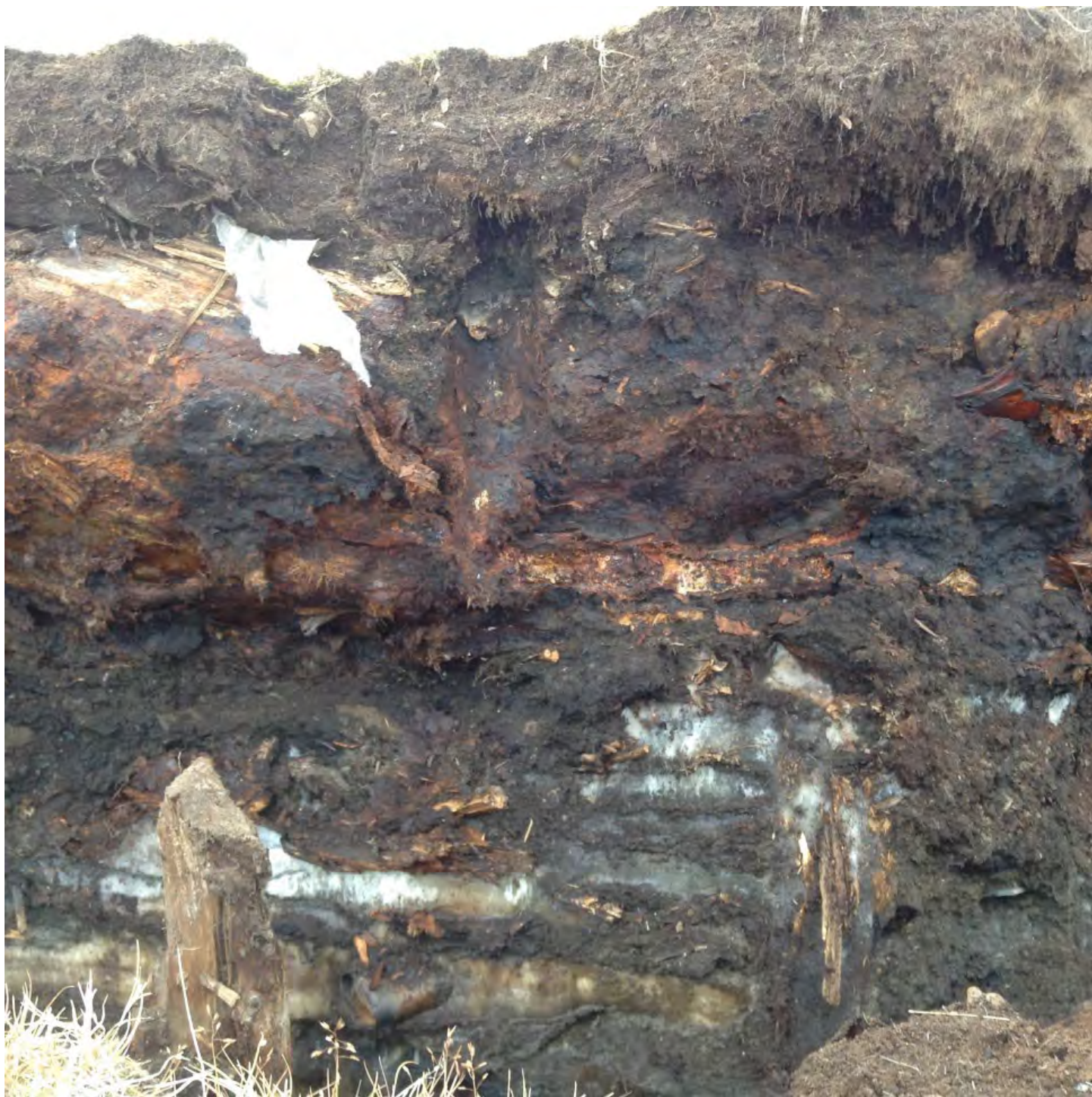
Walakpa slump block strata showing remains of a storage pit or ice cellar (reddish layer) and possible earlier abandoned ice cellar below (ice lenses separated by soil). A baleen (whalebone) bucket is visible in the lowest ice lens, just to the right of the post.