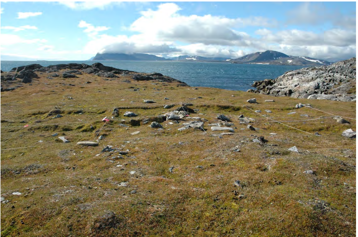
Avayalik-1, House 1 in 2016, view looking south. Backfilled site was well sodded over. Photograph taken after archaeologists re-gridded the area in preparation for opening sample excavation units in the structure.

cultural materials. Under the house were a frozen Middle Dorset house and midden containing organic artifacts and faunal remains, including hundreds of wooden artifacts, strands of musk ox cordage, objects made from baleen or whalebone, and even pieces of worked hide. Analysis of these materials had allowed researchers to begin to develop an understanding of the ecology of the North Atlantic before European whalers removed large numbers of baleen whales resulting in a cascade of changes in the ecosystem. Researchers speculated on trade routes that might have brought non-native materials to the region. They