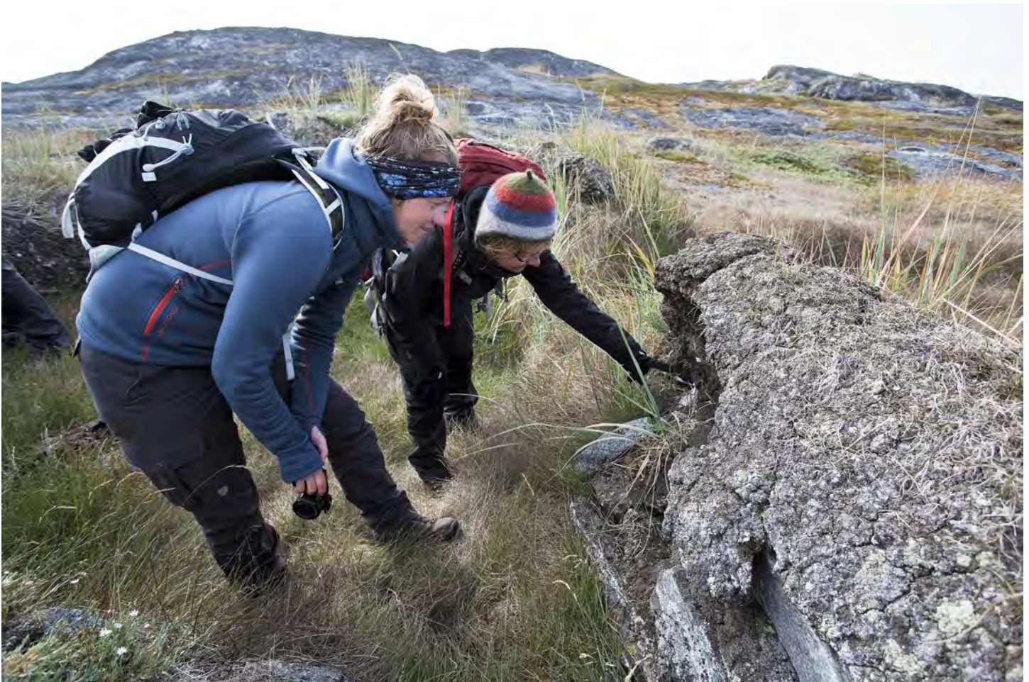
During the REMAINS of Greenland project, scientists have visited 14 different archaeological sites in the Nuuk region. Here the state of preservation is being evaluated at the heavily eroded site of Nuugaarsuk.

Researchers face the task of salvaging what they can of the remains from 4,000 years of human occupation in coastal settlements. Until the late twentieth century, these data have been preserved in middens protected by permafrost; they were veritable time capsules of material culture to be added to the stories passed down through generations: how people lived, what they ate, the tools they used, patterns of trade and migration. Over the last several decades, archaeological