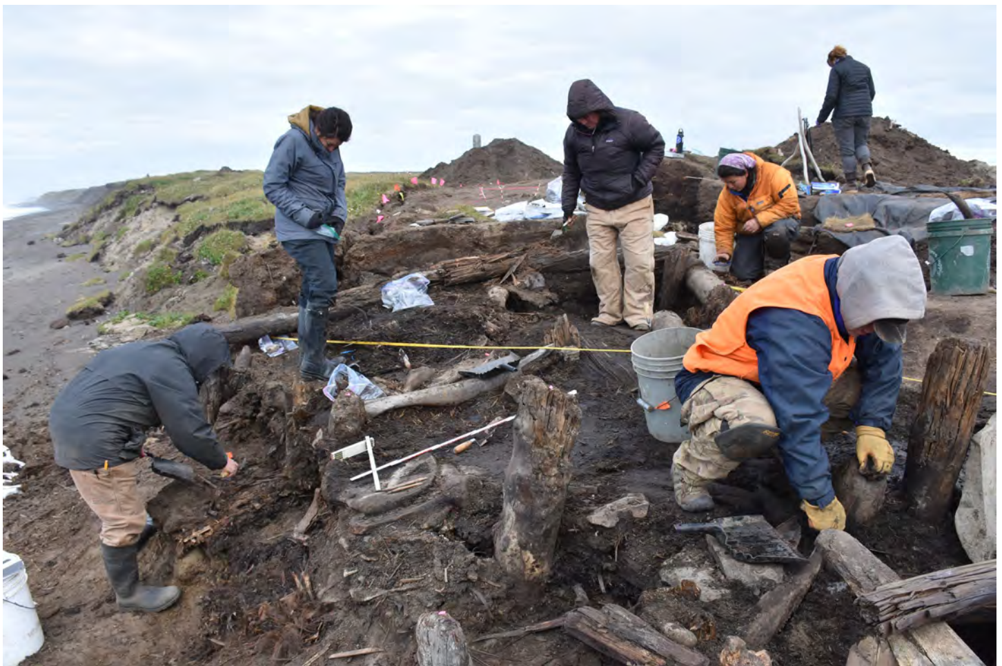
Crew excavating eroding house at Walakpa in 2017.

After a fall 2014 storm uncovered Walakpa, international volunteer efforts to salvage data from the site began in 2015, with support from the landowner (an Alaska Native village corporation) and many individuals (Jensen 2018). Another storm in 2017 nearly destroyed the site, exposing human remains and more cultural and biological materials. The urgency of the situation and the need to move quickly to begin recovery (including the appropriate handling of human remains) outpaced traditional funding cycles for such a project—exemplifying one of the many challenges facing researchers in the Arctic zone.