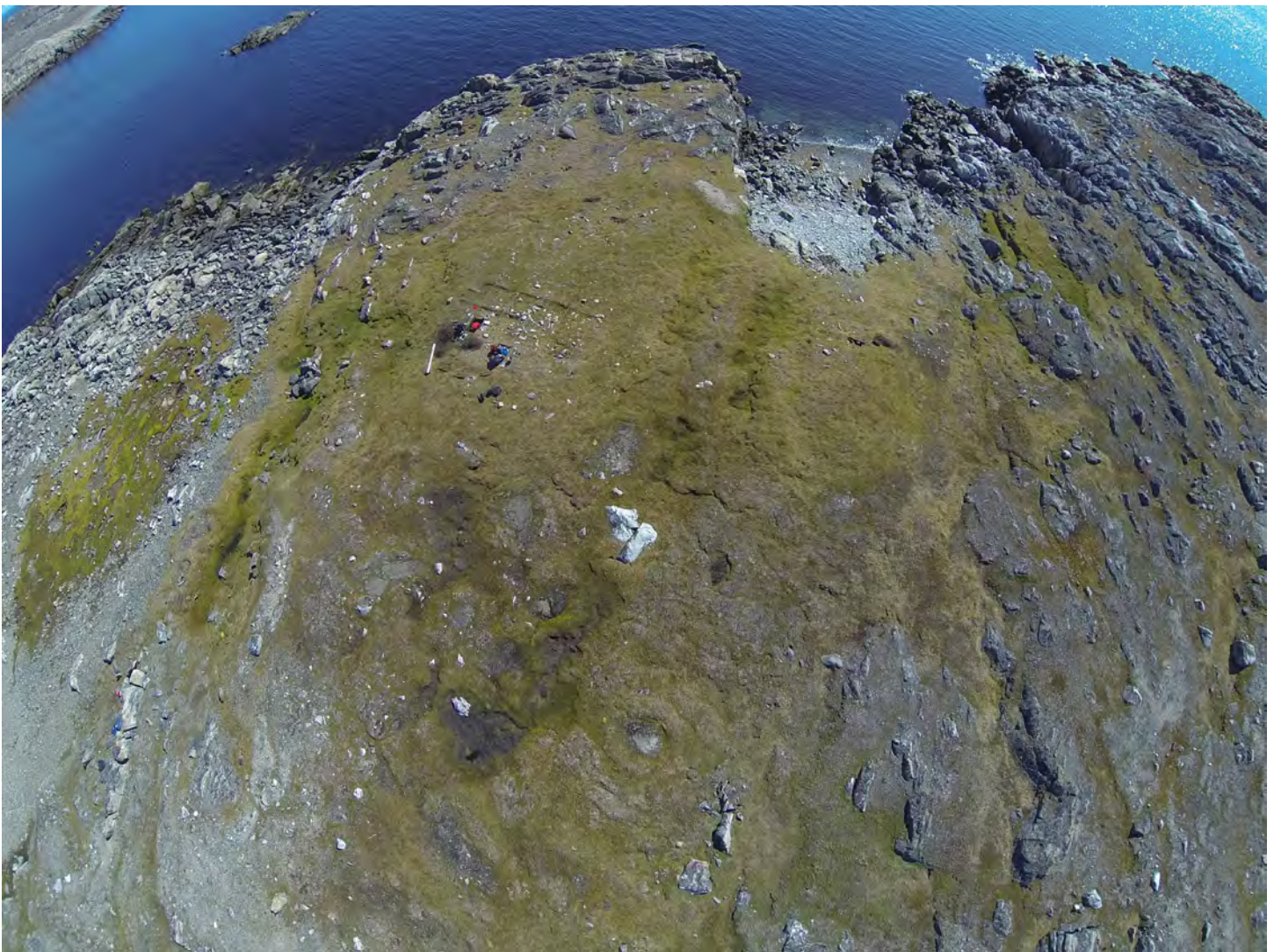
Aerial view of Avayalik-1 taken in 2016 using a drone. The 1978 excavation is visible in the top left quadrant of the photograph. The small cove southwest of the excavation showing active erosion is at the top of the photograph. Dark green areas in the center section of the image are where melting permafrost is pooling.

picture of what life was like some 1,500 years ago, in an ecologically rich area accessible to groups living as far away as Baffin Island and Hudson Bay. Perhaps it was even a central gathering place or an important stop on a vast trade route. Time is running out for researchers to gather the fragile organic materials that hold the clues to this and other stories in the Arctic.