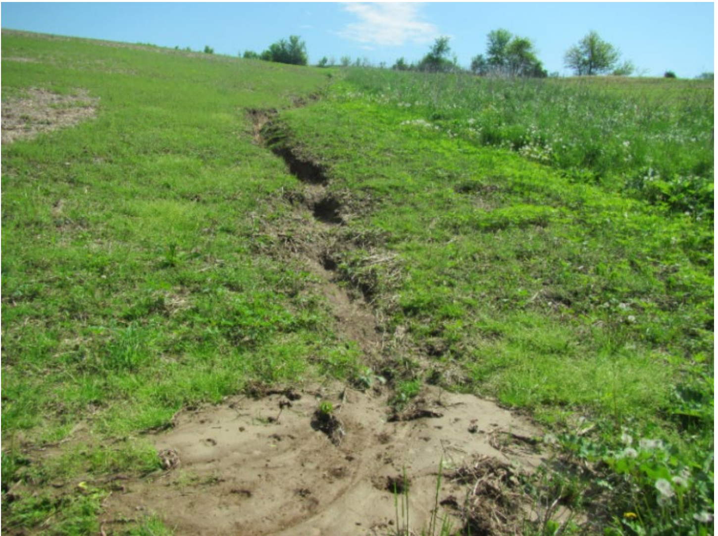
Poorly functioning grassed waterway. A grassed waterway is a broad, shallow channel designed to move surface water across farmland without causing erosion. If not maintained properly, they can fill with sediment causing water to flow along the edge, resulting in ephemeral gully erosion. Ephemeral gully erosion is one of the main mechanisms for off-site delivery of sediment and attached nutrients in surface runoff.

Like Cynthia, most of the farmers were already using a wide range of practices to reduce runoff on their land. However, each farm also had new opportunities. For instance, about one-third of