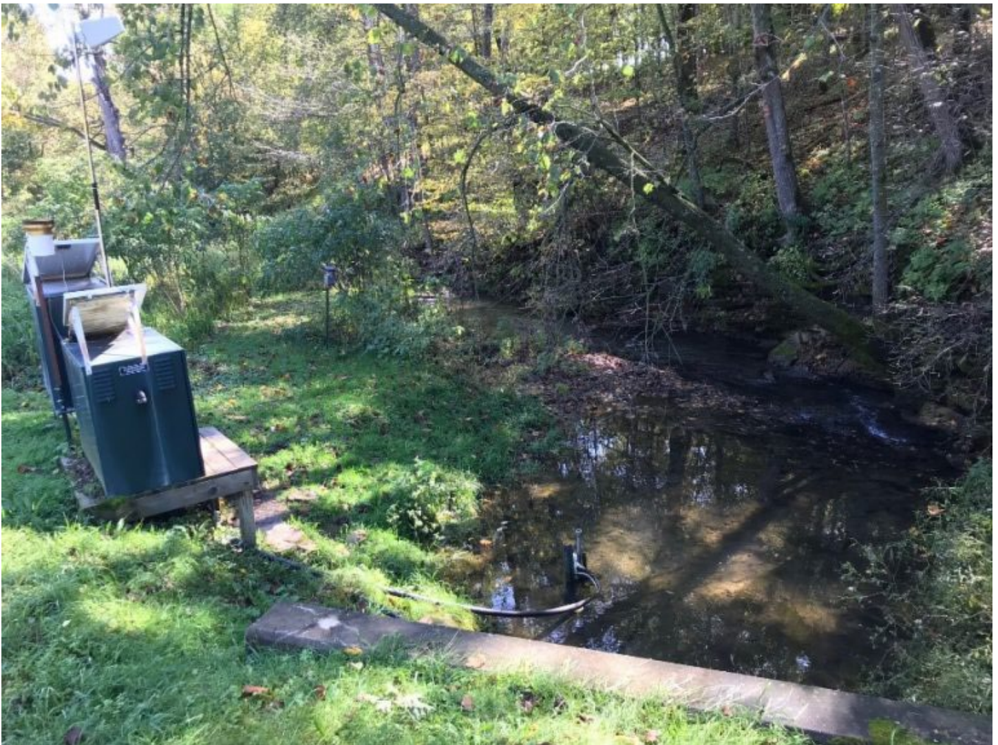
In-stream monitoring stations were installed at the outlets of the small study watersheds. This information combined with edge-of-field monitoring and a wide range of other assessments provides a unique opportunity to evaluate the effects of targeted agricultural conservation practices on water quality.