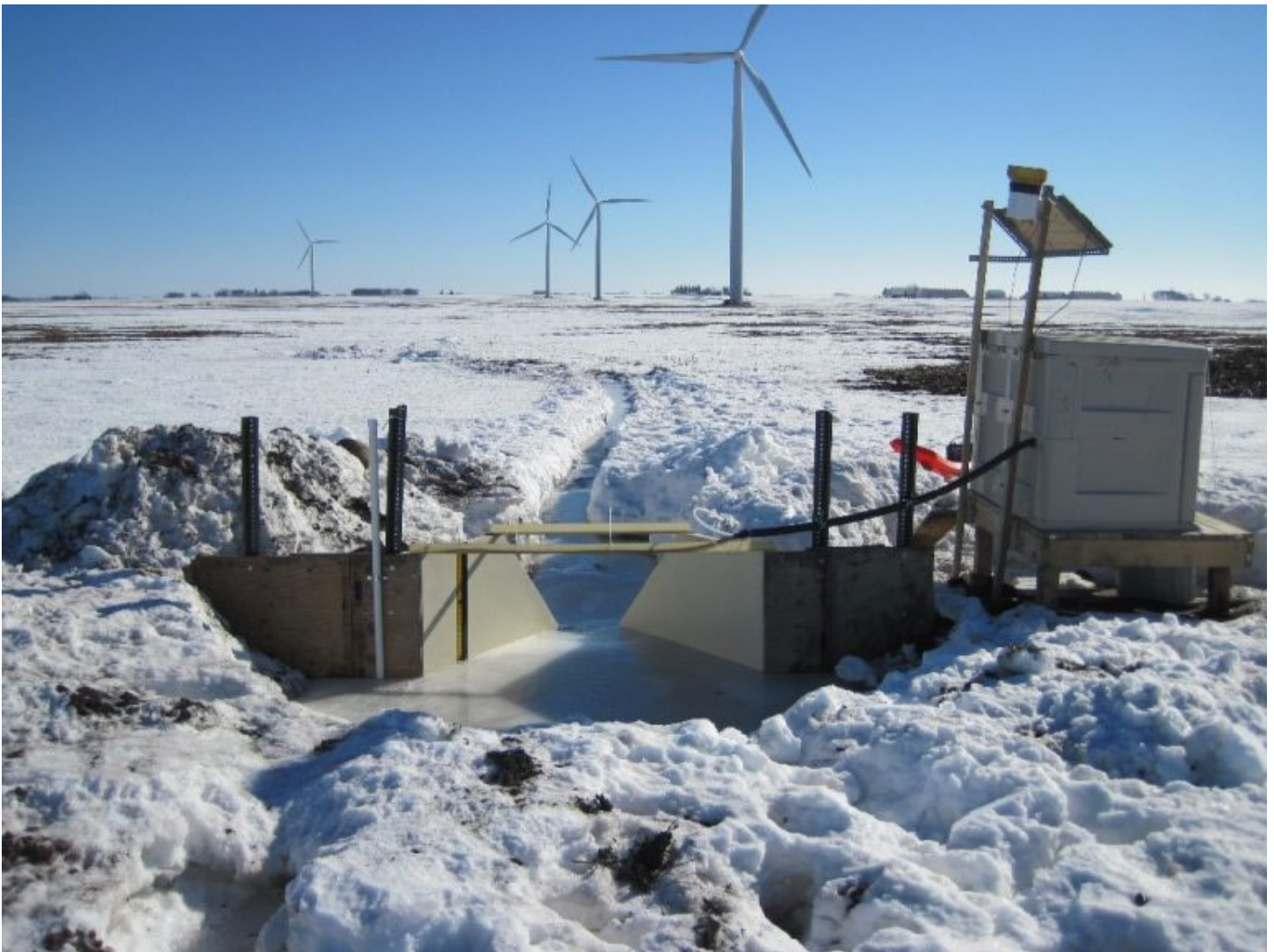
Edge-of-field monitoring stations provide information about the amount of runoff, soil, and nutrients moving off a given field into the waterway. Sites are fully automated to collect water samples whenever runoff occurs. Water samples are analyzed for nitrogen, phosphorus, and sediment and monitoring occurs year-round, 365 days a year. Monitoring has shown that 40 percent of the surface runoff occurs when the ground is frozen.