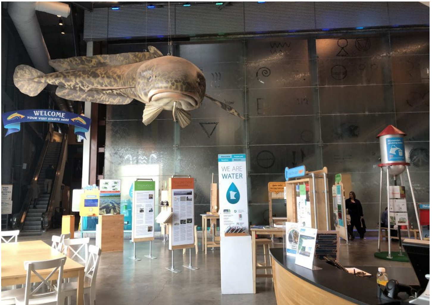
We Are Water MN on exhibit in the lobby of Great Lakes Aquarium, Duluth, March 10–April 22, 2019.