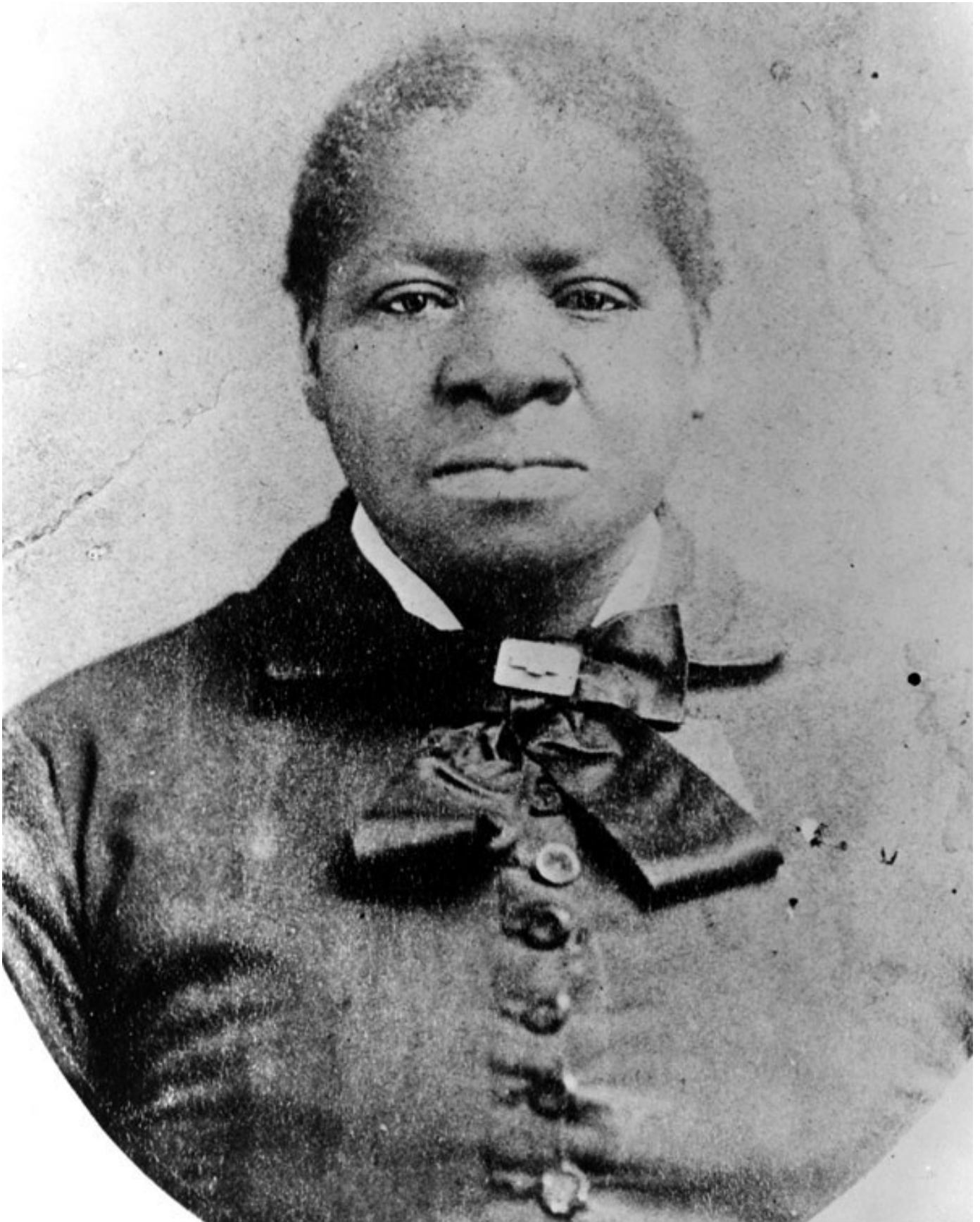
Portrait of Bidy Mason (1818-1891).