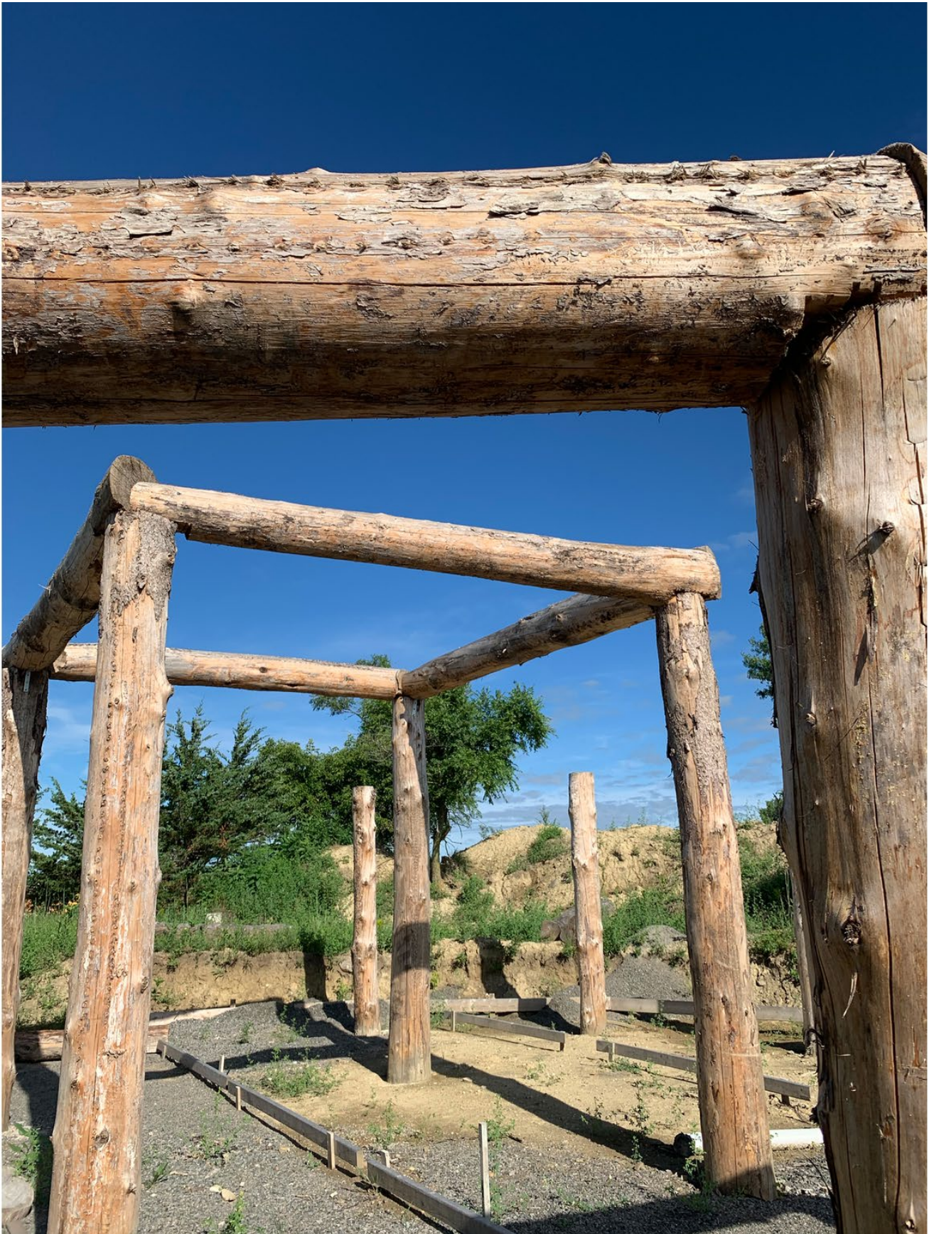
Earthlodge construction at Makoče Ikikčupi.