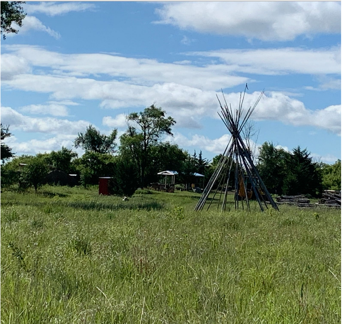
Land, Sky, Tipi.

and our own bodies will suffer fewer changes to chronobiology leading from sleep deprivation and hormonal shifts to cancers. Our firefly relatives can't even find each other to mate. Do crickets, frogs, and fireflies need to turn up the volume and candlepower to get our attention? Who speaks for them? The Pacific hydrogen bomb tests of the '50s certainly turned up the megaheat, light,