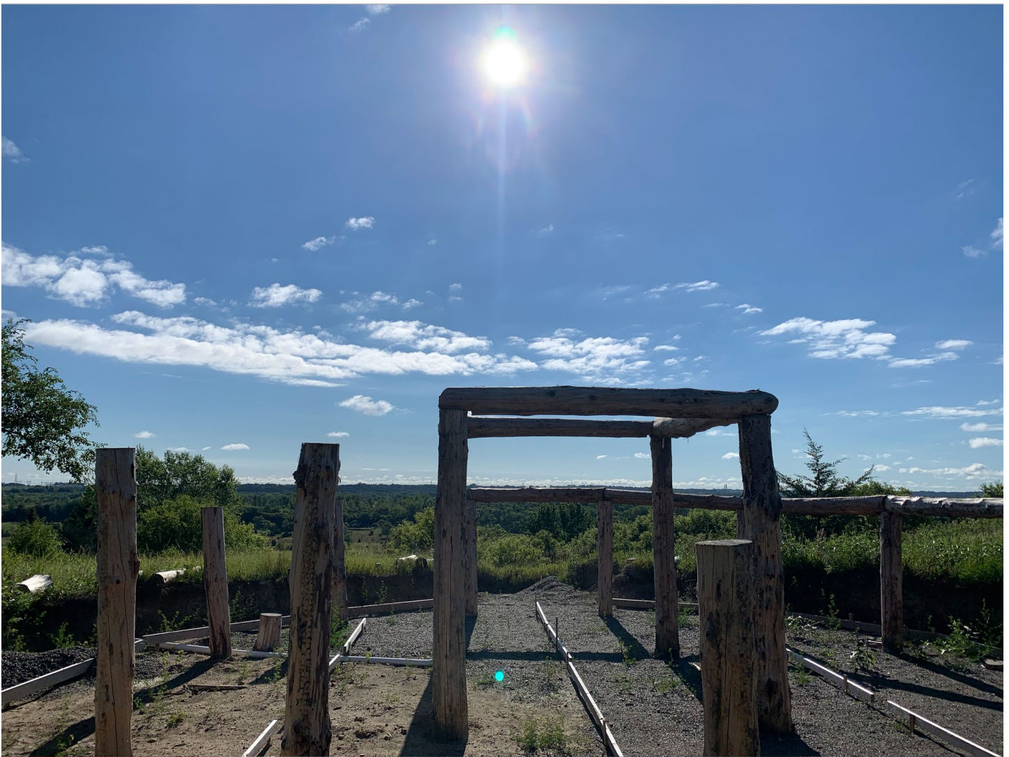
Healthy sunshine over Zani Otunwe (Healthy Village) Lodge.

sand run out of the hourglass." [x] Here is yet another reference to the kapemni-hourglass-Circle X extinction symbol. If a steward in the Greek biblical texts is supposed to watch, guard, and manage the affairs of a household while the owner is away...presumably until that land owner or Earthmaker/Land Creator returns, then that steward will be measured and judged accordingly in this Western view. Yet our local "Garden of Eden" at Bdote (river joining) as Čhokáya Kiŋ (the center) of Mni Sota Makočhe (the land where the water reflects the sky) is still here, albeit drained, exfoliated, paved, toxic, and 99% de-prairiefied and on life support since alien colonization.