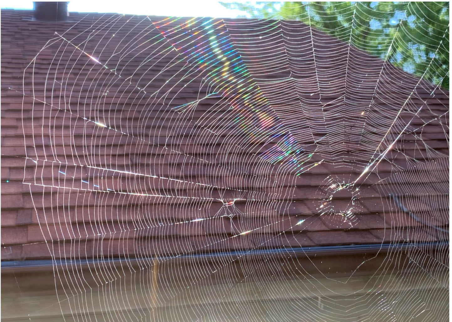
Unktomi Tachekpa—Unktomi’s navel.

Indigenous “First Residents” could not even conceive of owning The Mother, but rather we were to see ourselves as Her children in a loving relationship of gratitude and reciprocity. For well over a thousand generations we were asking permission for every heart-like strawberry and handful of water, thinking ahead of the seventh generation. We were not to overuse and abuse, nor to accumulate individual wealth, since others were in need of generosity and hospitality as our relatives. What $emi-annual, balanced-$pread-sheet $ymbol does the colonial-$ettler power of imperma-culture, mo$t use, value, and remember? They rarely or never memorialize and remember the descendants of slaves (say their