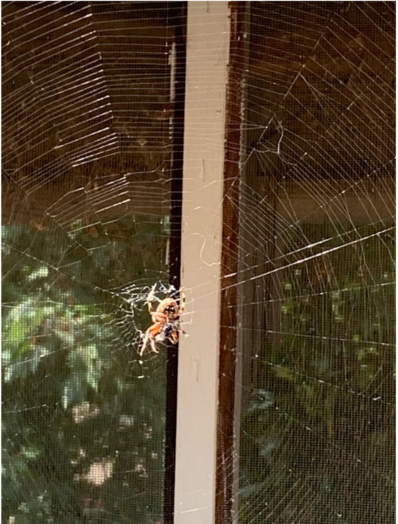
Unktomi. Image courtesy of Jim Rock.