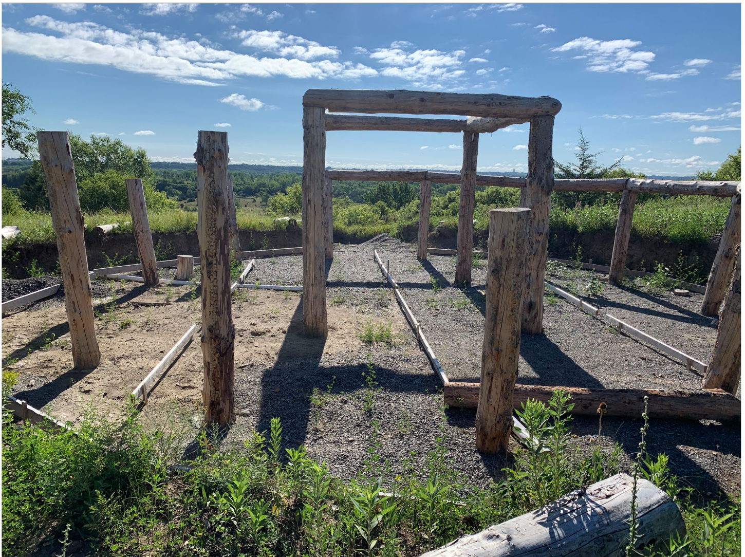
Waiting for the roof poles and Earth covering for the earthlodge at Makoče Ikikčupi.

and off the ice while traveling about 4 miles per second across the pole, to earth-watch from sky how ice is changing. It's melting way faster than we thought. Actually these laser beam pairs are 90 meters apart to also calculate elevation changes during each 90 minute pass over the pole. Ninety meters is over half of the two millenia-old REMA Giant Snake Mound (55.3% of REMA = 163 m). Minnesota's REMA is an Unktehi who is both flood watcher and eclipse watcher and who also gains elevation from 1 foot at the rattlesnake tail to 5.5 feet at the head. REMA is further explained by this author in a separate article in this same journal.