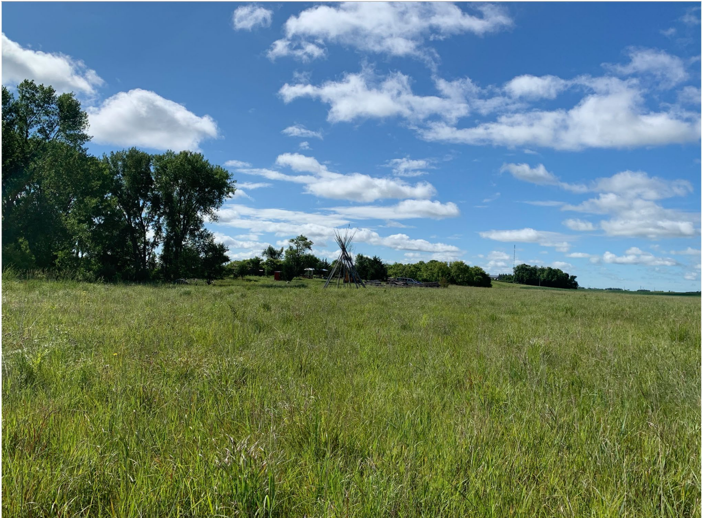
Kapemni Mirror of Earth-Sky and Tipi reflecting both.

What single painted symbol will we place on our wintercount spiral for 2020-21? Should it be a black ball of spikes for Covid-19? The first confirmed Minnesota case on March 1 was followed by a state of emergency declared March 13. This was the end of 2019 for us Dakotas. Our Dakota New Year came with the spring equinox and lock down. Should the symbol be a mask? Or should the symbol be a knee on a neck for an entire life eclipsed within 8 minutes? What should justice look like? Perhaps a skull and crossbones.