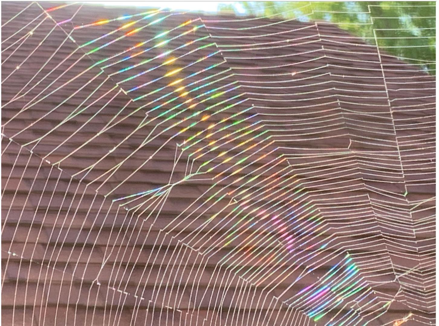
Unktomi's Rainbow Tipi.

So if Space and Turtle Island Mother Earth (Space&TIME) is our mutual Ultimate Thípi, then we must somehow "Ištásu thókhiyopñeunyanpi..." Basically, we trade eyeballs and tongues(k'a čeží) as more than two-legged relatives, and we learn from each other. As Earth is our thípi, we must all watch, live, work, and row together within the same wáta (canoe) circling through the ocean of spacetime. But it can also seem like the time to stop leaning thípi poles together with those whose individualized values are incompatible with our Mother's collaborative values. Systemic and personal acts of racism, aggression, and violence continue in the land O'MinNice.