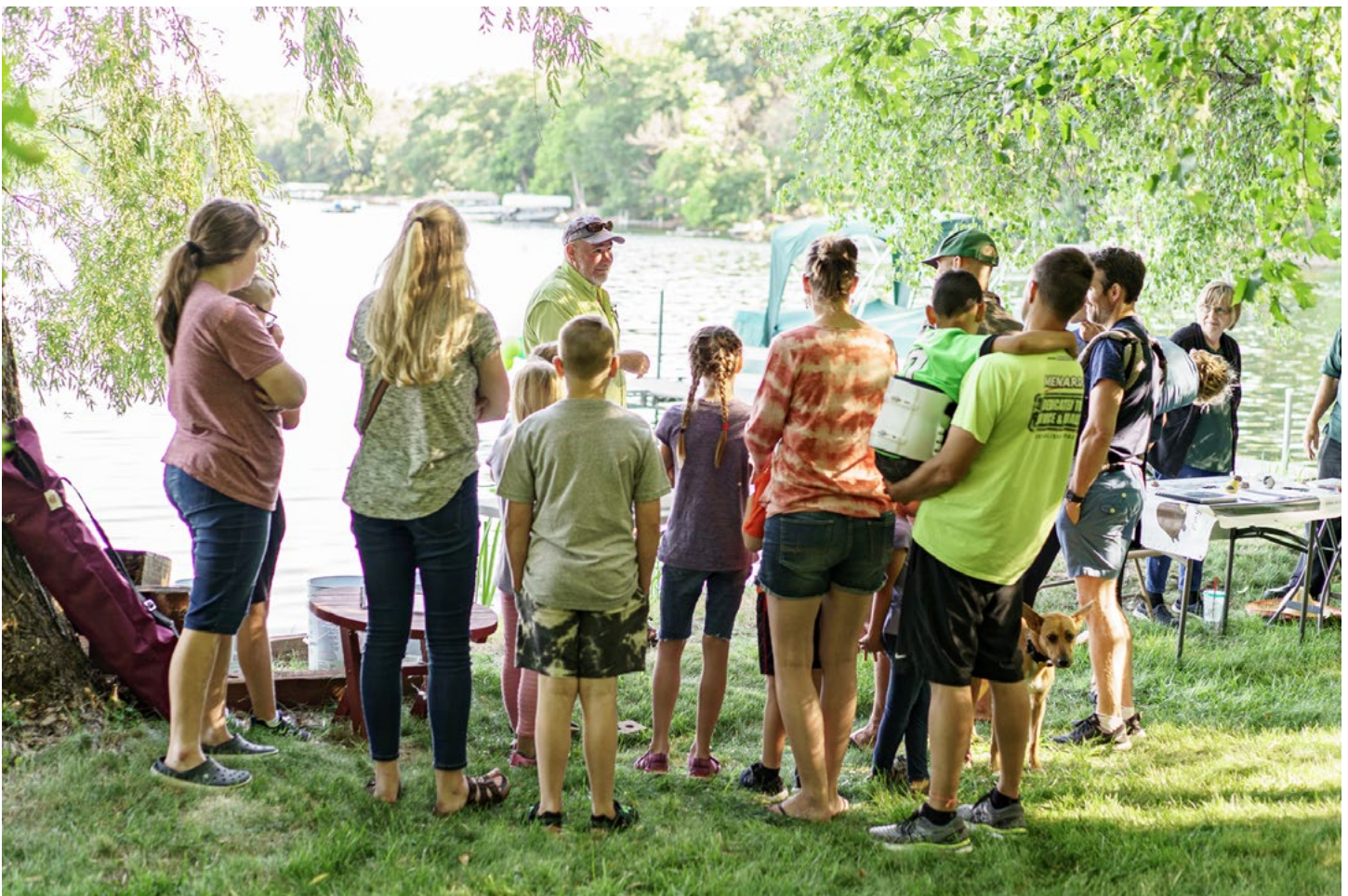
Neighbors in Lake Elmo, Minnesota gather at an EMWREP-sponsored community event to learn about aquatic invasive species and landscaping practices to protect local lakes.

Washington County, Minnesota. The program launched with 6 local government partners and has since grown to 25, including Washington County, Washington Conservation District, all 8 watershed management organizations in the county, and 14 cities and townships.