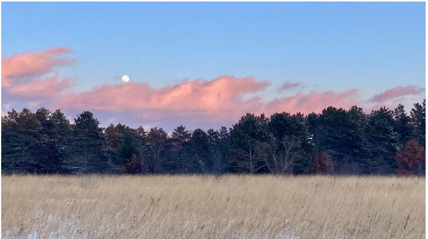
Moonrise over a snow covered field at William O'Brien State Park in Minnesota.

In addition to thinking of creative ways to package our water stewardship messages, we’ve expanded our virtual communications to adapt to the changing media landscape. Four of our local newspapers have gone out of business in the past five years, leaving an information gap in the most populated portions of our county. Meanwhile, social media platforms have surged in popularity. Publishing my weekly newspaper column on a WordPress blog site ( www.eastmetrowater.org ) makes it easy to include multimedia components, such as photos and video, and share the content via Facebook , Twitter , LinkedIn , and email.