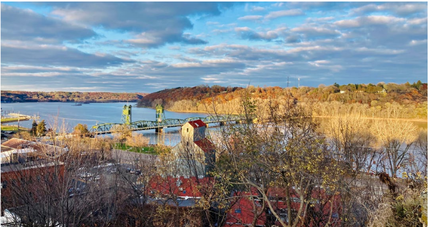
St. Croix River in Stillwater, Minnesota, autumn 2020.

A few months later, after having been persuaded otherwise, I sent my first few articles off to the Stillwater Gazette and other local papers. Did you know that you live in a watershed? Did you know that dog poop carries E. Coli ? (Ho hum, I'm already yawning.)