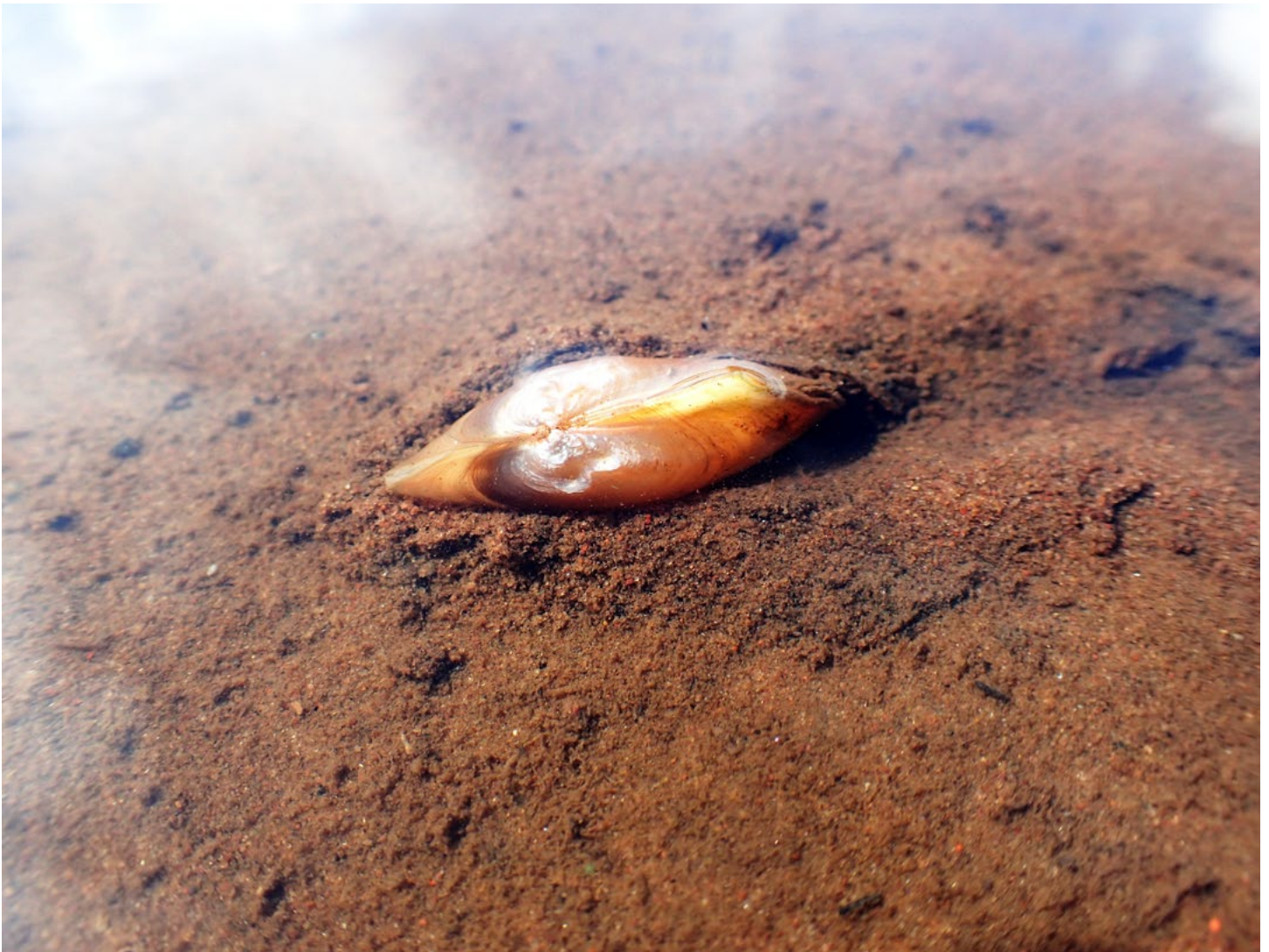
Native mussel in the St. Croix River. The river supports 41 species of freshwater mussel, including several endangered species.