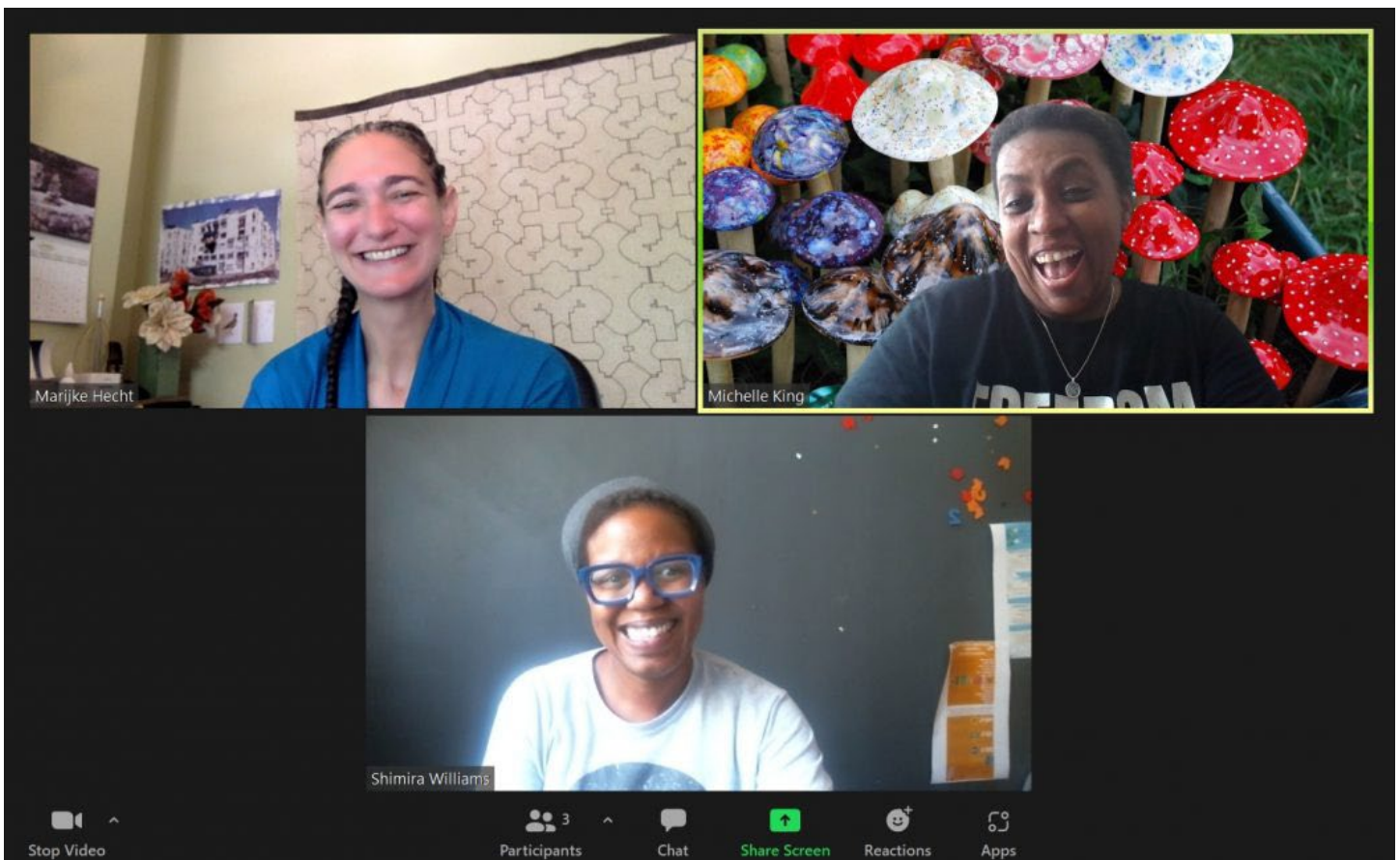
Figure 2. A screenshot from a Walking Alone and Together Zoom conversation.

Through the discipline of showing up week after week, we have created refugia , an area in which a population of organisms can survive through a period of unfavorable conditions. Our learning refugia is an emergent space, centering our complex identities of race, gender,