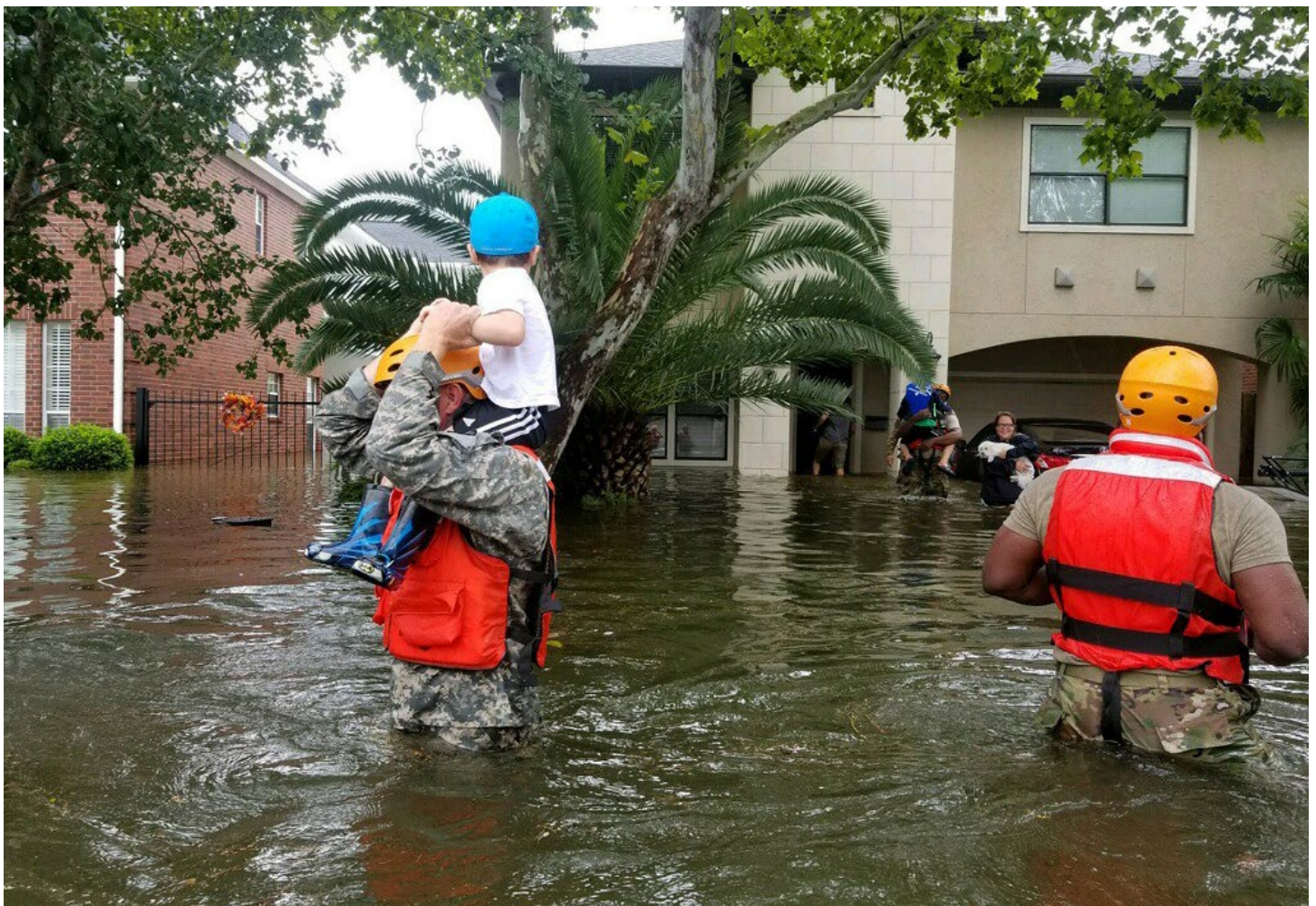
Harris County flood rescue.

quite folded back) under a dim car light. Then, in the mid-1990s, a web-based mapping service called MapQuest revolutionized driving. Users