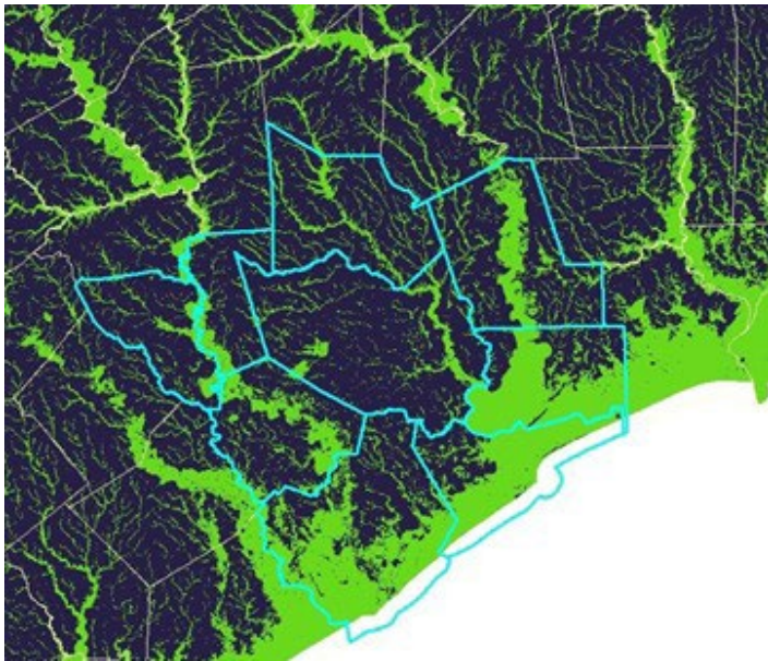
Figure 1. The Houston-Galveston-Brazoria region with county boundaries highlighted in light blue. Map courtesy of Kristin Osiecki.

Figure 1 shows the eight counties within HGB in which each county boundary is highlighted in light blue. Underneath the county boundaries is a topographical map that shows floodplains in fluorescent green. Here we can see a large fluorescent green area in the lower right corner bordering the ocean with smaller floodplains along rivers, lakes, or low-lying areas. This map shows that all eight counties have floodplains and four counties with larger areas are more vulnerable to flooding.