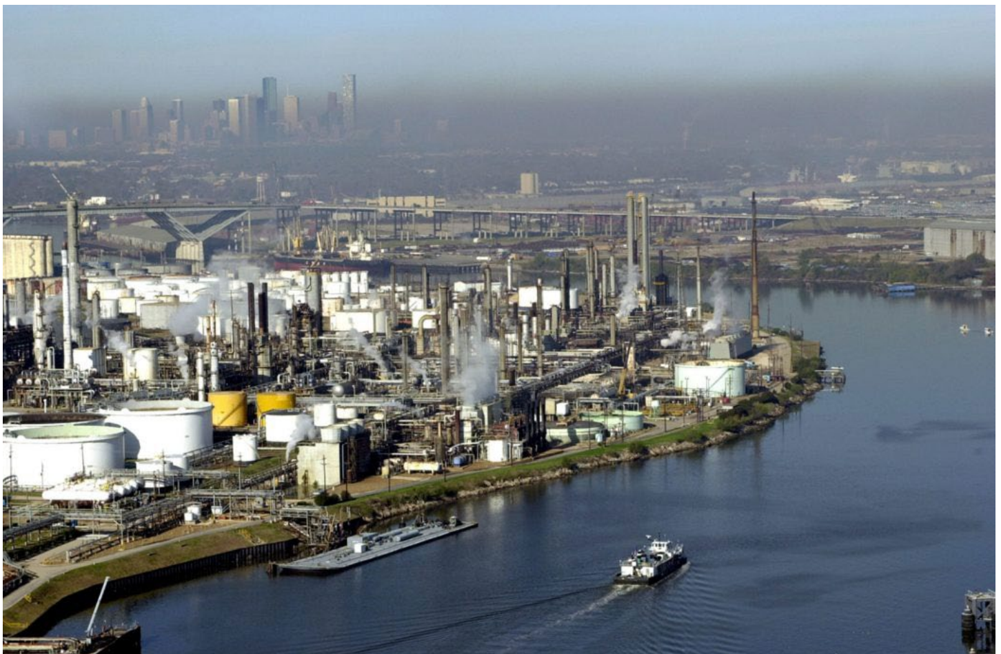
A view of Houston, Texas, showing the proximity of the ship channel and the city. Note also the pollution in the air.

Neighborhood disadvantage looks at things like unemployment, lack of education attainment, pollution, poor living conditions, and food insecurity. Disadvantaged individuals are then socially categorized by gender, race, and poverty. There are populations that face more challenges than others. In the U.S., 25% of female-headed households—which includes 11.9 million children younger than the age of 18—are living in poverty